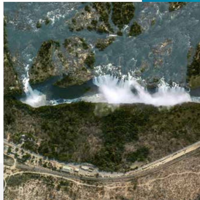
Victoria Falls, Zimbabwe

Pléiades Neo, Airbus' most advanced optical constellation, with two identical 30 cm resolution satellites and optimum reactivity, will allow you to unleash the potential of geospatial applications and analytics.