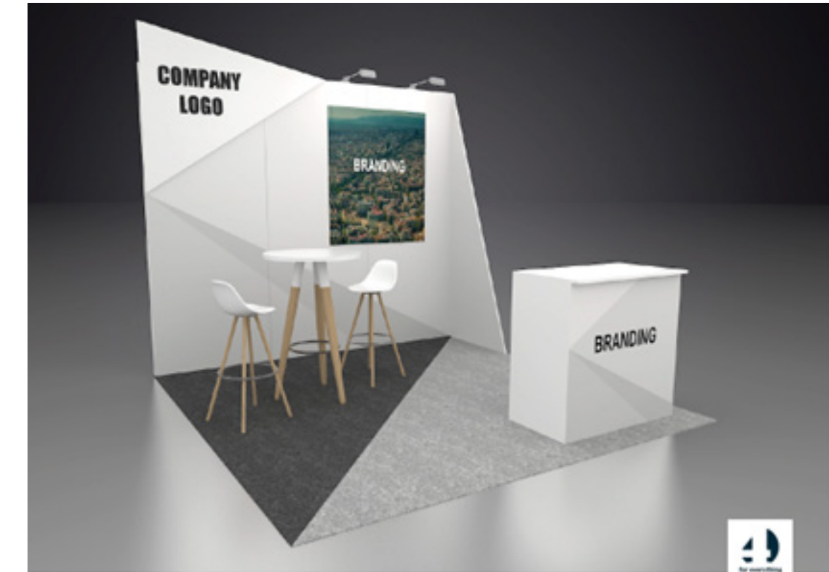
3x3 (9 sqm)

Join over 1000 of the world's leading technology suppliers and solution providers at ISE, the world's largest AV Systems and Integration exhibition by choosing your booth.