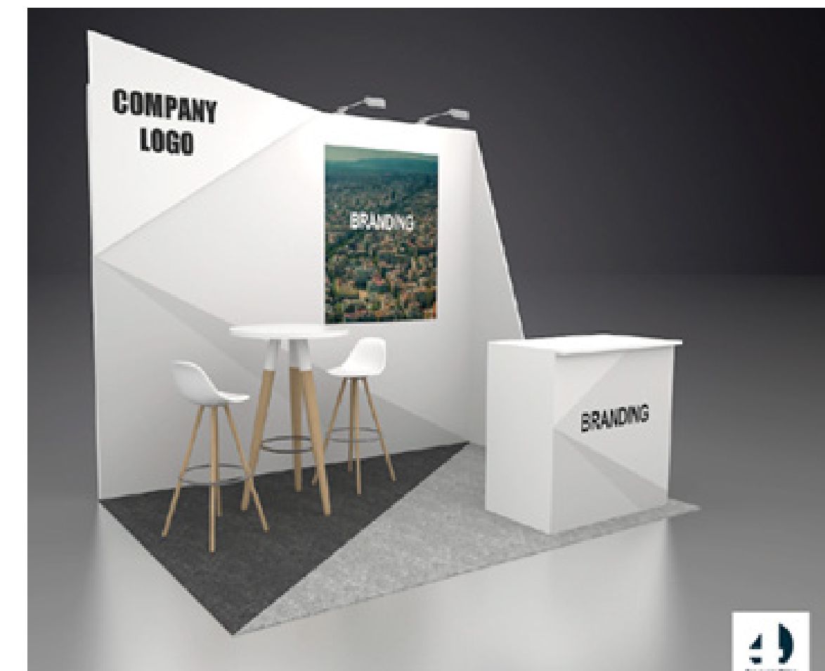
2x3 (6 sqm)