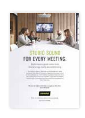
Full page ad site on the reverse of the Product Locator opening page