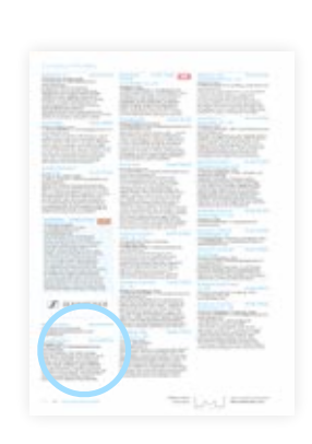
Exhibitor Extended Profile.