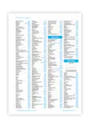
Exclusive Sponsorship of your relevant individual product categories