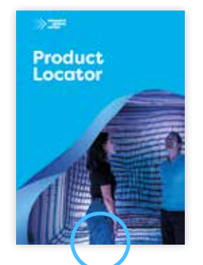
Exclusive logo branding on the Product Locator opening page and on the footer of every Product Locator page

Exclusive to one Exhibitor, sponsorship of the Product Locator section gives one company the opportunity to stand out over and above competitors in the most high profile way.