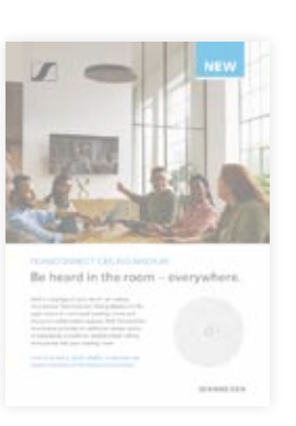
Full Page Outside Back Cover Advert