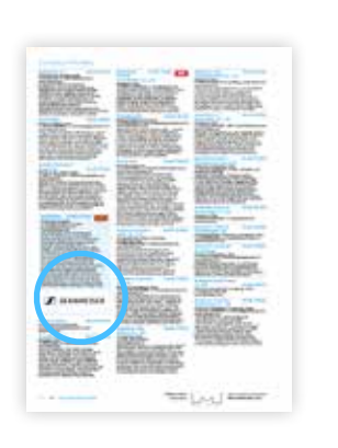
Exhibitor Extended Profile.