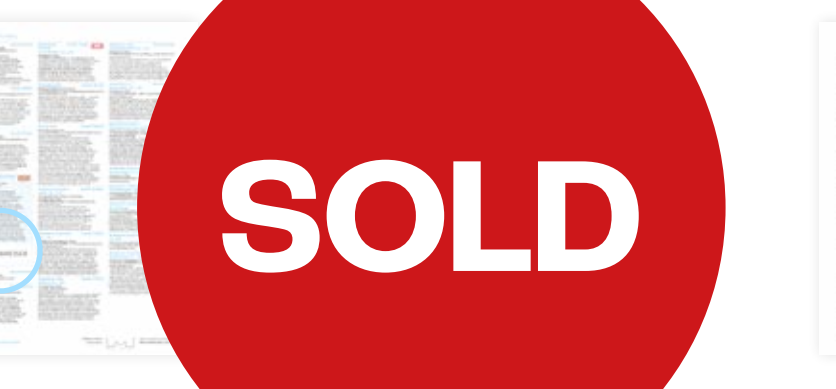
list opening page