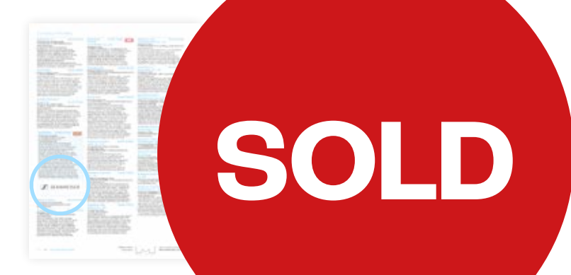
Exhibitor Extended Profile.