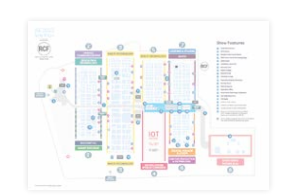
Logo branding on the rollout site map

Exclusive to one Exhibitor, sponsor one of the highest traffic sections of the Guide, maximise your presence and branding and drive relev