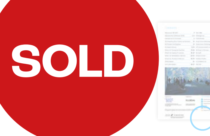
Exclusive Logo Branding On All Editorial Pages