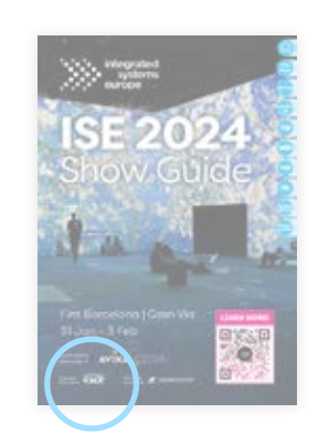
Your logo branding on the front cover

A unique opportunity to draw maximum attention to position your brand alongside ISE and stand out above all of