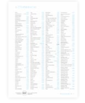
Exclusive logo branding on the footer of every Alphabetical listing page