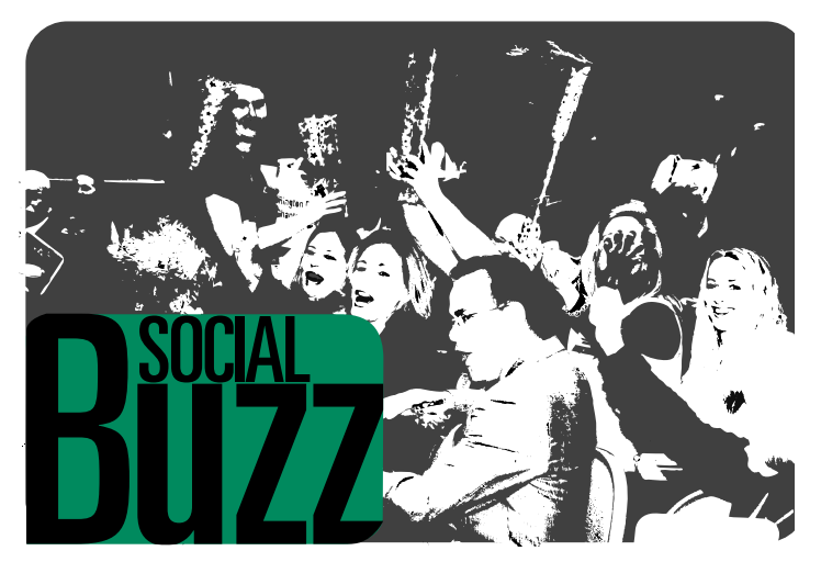
Photos of the Washington, D.C. chapter luncheons and other events IAEE DC September and October Luncheons