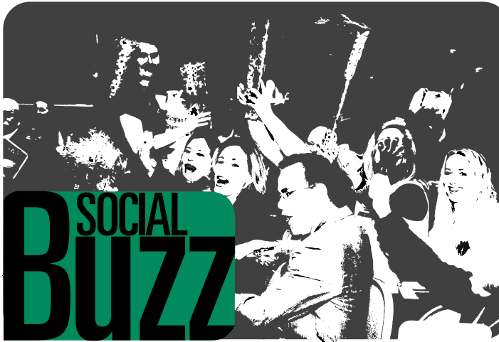
Photos of the Washington, D.C. chapter luncheons and other events