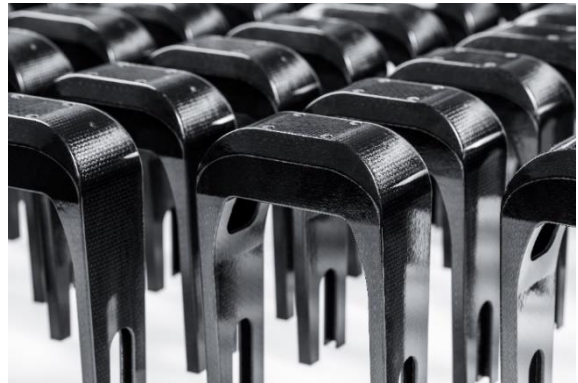
Figure: High frequency pick-and-place rocker for semiconductor manufacturing.

Looking at lower volume production of less than 1,000 parts per year, manufacturers typically rely on prepreg technology. However, the automation and short cycle time of BIONTEC's process allow significantly higher productivity, thus typically cutting production costs by half.