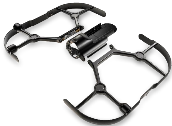
Figure: Drone structure with fully integrated electronics.

BIONTEC has successfully developed a process to integrate electronic components into structural parts allowing for standard conductors and connectors to be used. A world first and award winning metrology product will demonstrate the unique technology. It can be applied to any electronic device, whether it is connected via traditional wire or flex-print cables. The technology gives designers new possibilities for clean and sleek optics.