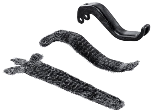
Figure: Stitched fabric, preform and finished part of brake lever

Whether you need load path aligned fibre layup, complex three-dimensional preforms or composite parts including attachments and finishing: Our automated and robust processes ensure that you receive first-class quality that pays off and that you can rely on.