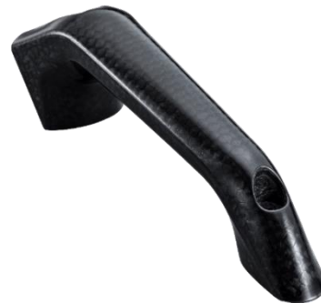
Figure: Cockpit handle for business jets meeting flammability requirements and providing weight reduction and thermal insulation.

Other applications are the replacement of milled aluminium or titanium fittings for example in the machine or aerospace and space industry where performance and part consistency can be well met. Even tight regulations regarding flammability can be met. BIONTEC will show solutions specifically for aerospace interior components.