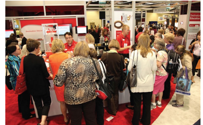
Case Study: Sponsored Conference Recordings Wound, Ostomy and Continence Nursing