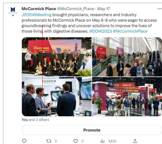
McCormick Place Twitter post after the 2023 Digestive Disease Week #DDW2023 Meeting.