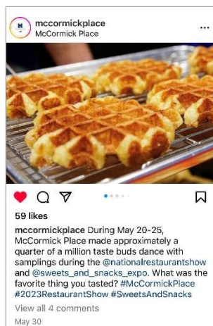
McCormick Place Instagram post after the 2023 National Restaurant Show and Sweets & Snacks Expo.

Examples of past McCormick Place event social media posts: