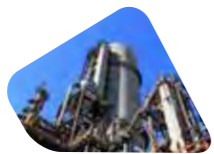
Manufacturing & Engineering