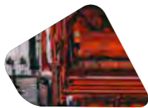
Transport & Logistics