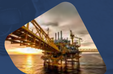
Business & Industry