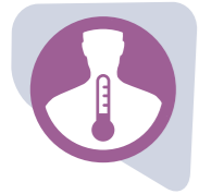
Head and Hypothermia