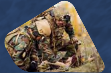
Security & Defence