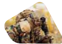
Security & Defence