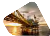
Maritime & Offshore