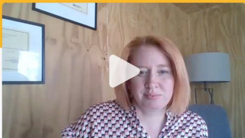
Julie McAulay Free Intro Call (up to 30 mins)