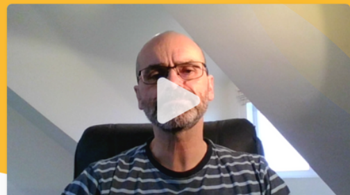
Paul Free Intro Call (up to 30 mins)