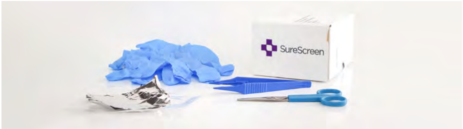
HAIR COLLECTION KIT

Rapid Screening allows you to eliminate the negative samples quickly and efficiently. If you do find a non-negative result, the next stage is to find out exactly what is in the sample and the quantity. We do this by sending the sample to the laboratory where it is analysed using advanced chromatography methods such as GCMS and LCMS.