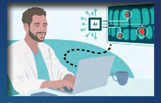
Pearl Al Exhibitor: Software of Excellence Stand: F50

Software of Excellence is once again setting the standard for innovation and excellence by becoming the first Practice Management System (PMS) provider to deliver Integrated AI to the UK market. We have teamed up with Pearl, a global leader in dental AI solutions, to bring the most advanced dental artificial intelligence technology to practices like yours, before anyone else. Here are just a few benefits of integrating Pearl AI into your practice: