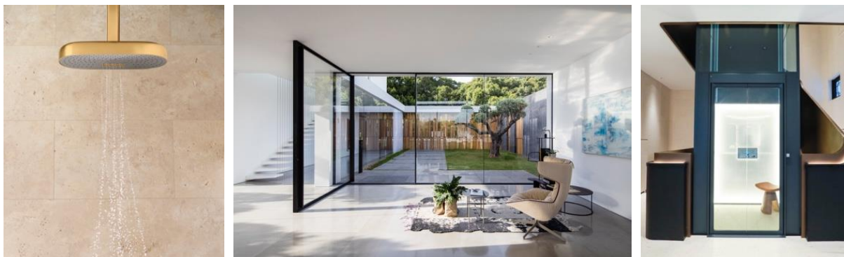
Above (from left): Statement showerhead by Kohler; Bespoke windows by Vitrocsa; Geometric Design Wall by Aritco

More bathroom and kitchen exhibitors are to be announced in the coming weeks.