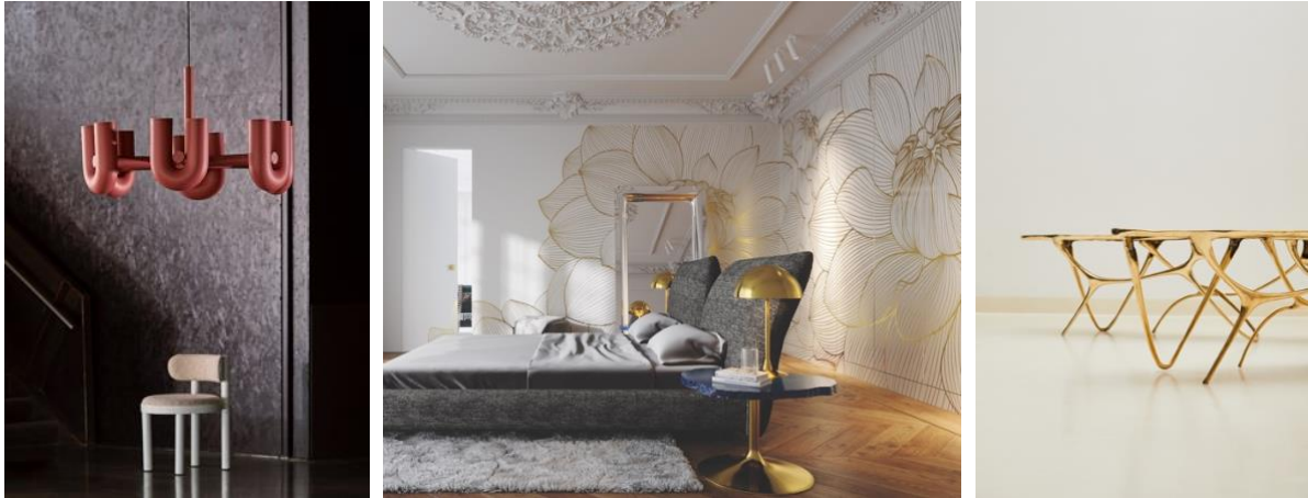
Above (from left): Cirkus pendant by Ago; Bespoke wall system by Creadoor; Ink side tables by Masaya