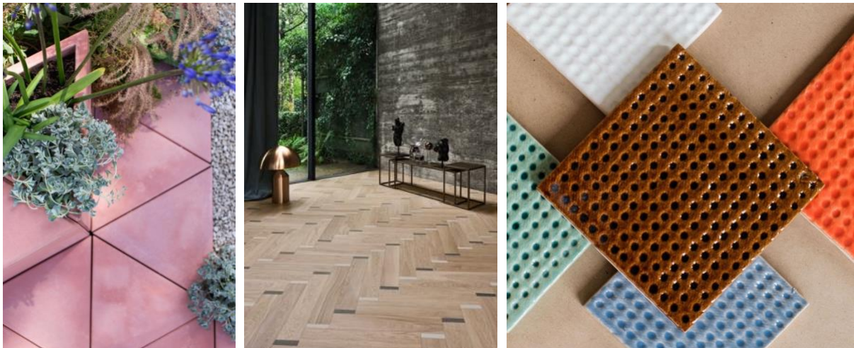
Above (from left): Concrete tiles by Lazenby; Open Frameworks Design Edition flooring by Parador; Handmade tiles by New Terracotta

Other exhibitors to look out for include: Artemide, Penta Light, Ago Lighting, Spark and Bell, Centrsvet and Hamilton.