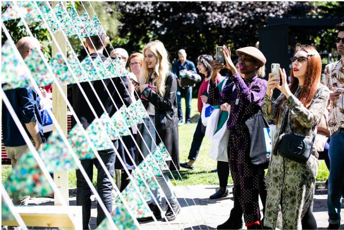
Community with Collaboration with STORE at CDW 2019