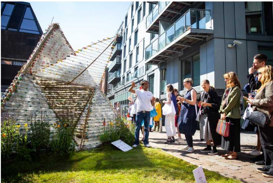
BottleHouse™ at CDW 2019

Each year, one of the highlights of the show is CDW Presents, showcasing specially commissioned, site-specific street spectacles across Clerkenwell.