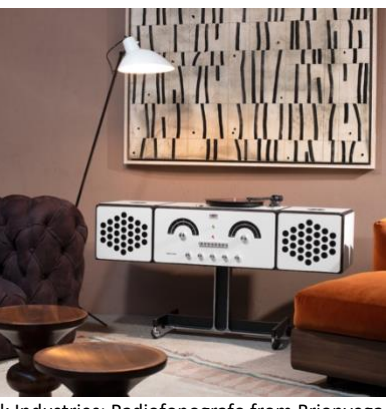
Above (from left): Ora 3-D acoustic wall panel from AllSfär; Neuron activation pod from Loook Industries; Radiofonografo from Brionvega

Visit Old Sessions House and experience Clubhouse from KI Europe – a new flexible system of acoustic frames and panels for creating phone booths or more complex structures with different levels of privacy and tech integration. Meanwhile, outside Design Fields, Texaa will present its Vibrasto flexible acoustic cladding that can be stretch-fitted to walls, ceilings or furniture – alongside its Stereo acoustic panels and Stereo Air open mesh panels.