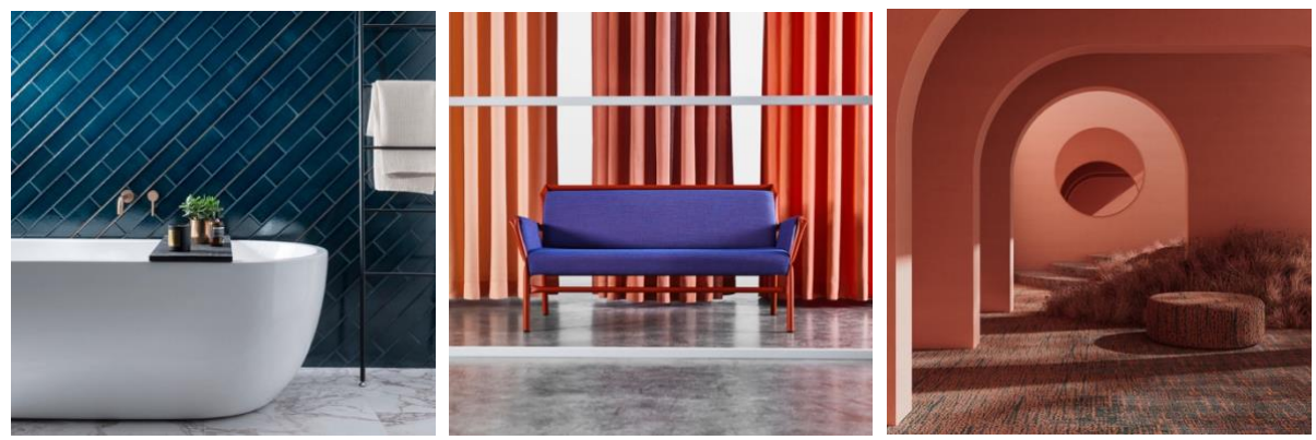
Above (from left): Principle Blue tiles from Parkside; Node, Yoyo and Core fabrics from Svensson; Artcore carpet flooring from Modulyss

At CDW, Parkside 's Sequel Principle – a recycled composite tile consisting of over 91% recycled content – will be presented in its Sekforde Street showroom. The manufacturer collects unwanted materials from the ceramic and glass industry to create this range, while all of the recycled materials are locally sourced in Spain – with every square metre of the tile diverting 8kg of waste from landfill.