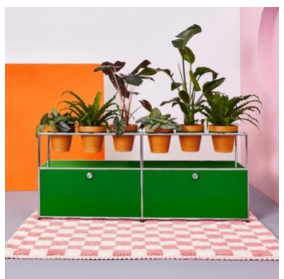
Above (from left): Morag Myerscough; Kameleon acoustic pod from Askia; Haller World of Plants from USM

As a global design destination, <u>Clerkenwell Design Week</u> (CDW) is set to return this May (23 – 25) with its biggest programme yet, featuring over 600 industry events over three days. The 12<sup>th</sup> edition also sees a total of 12 <u>exhibition venues</u> presenting more than 300 design brands and makers – supported by a network of over 130 <u>local showrooms</u> – across the whole of Clerkenwell. Architects and specifiers, interior designers and the general public alike will have the opportunity to experience everything from new furniture and lighting to kitchens and bathrooms, materials and surfaces, decorative accessories, and more.