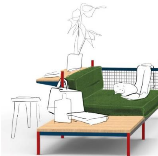
Image 5. GRID SOFA by Ronan & Erwan Bouroullec for Established & Sons

For Clerkenwell's 10 th anniversary, a plethora of exciting pop up showrooms and workspaces will take place during the festival. Established & Sons will take up residency in Fora to launch four new designs including The GRID SOFA by Ronan & Erwan Bouroullec, the KD TABLE and BEAM TABLE by Konstantin Grcic and the LUCIO CHAIR by Sebastian Wrong. Conceived as a complete take-over of Fora's breakout spaces, the installation will invite visitors to explore the possibilities of Established & Sons' new, innovative designs by trying them out with hot-desking, wi-fi and refreshments from Fora's in-house cafe. The installation will be complemented by a series of talks, workshops and events. Fritz Hansen will be collaborating with Zaha Hadid Architects to showcase aspects of their Heritage Exhibition, whilst Relay Design Agency will present + Halle, Baux, Orsjo, Mitab and Zeitram within a fashion house on Clerkenwell Road. KI , one of the world's largest manufacturers of workplace and education furniture will take over an architectural gem in the centre of the festival site. The pop-up showroom at the landmark Paxton Locher House on Clerkenwell Green will be transformed into ' KI House ' for the launch of several new UK-designed & manufactured products.