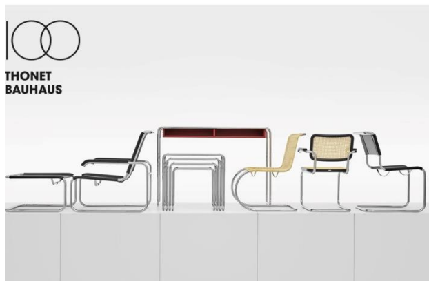
Image 10. Thonet