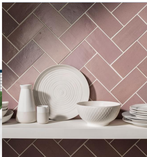
Image 6. Sequel by Alusid at Parkside