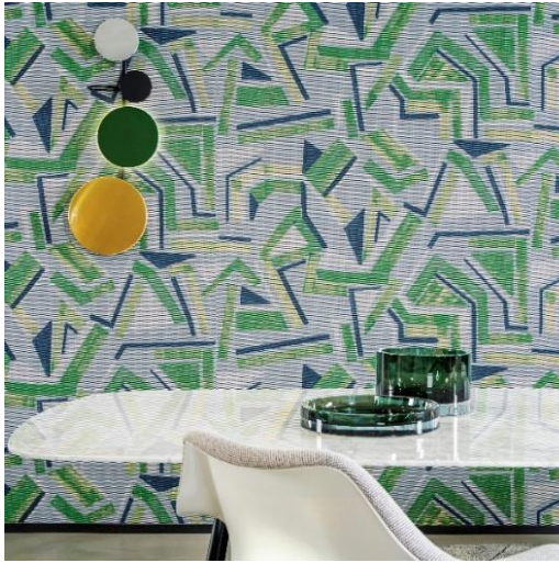
Image 13. Vanguard Collection by Arte