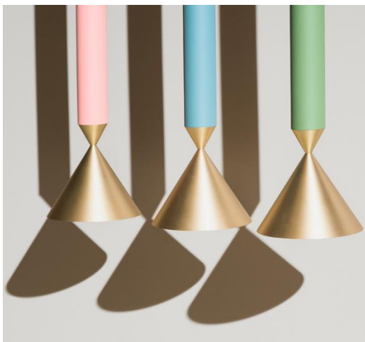
Image 10. Apollo Pendant by Pholc

Back by popular demand, Light will showcase the top international lighting brands located within the brick vaults of fabric, the former cold-store turned nightclub. Exhibitors include Belgian based company Wever Ducre who create trendsetting lighting systems. Established in 2015, Swedish design brand Pholc will be showcasing lighting in collaboration with talented designers, each sharing the Scandinavian aesthetic.