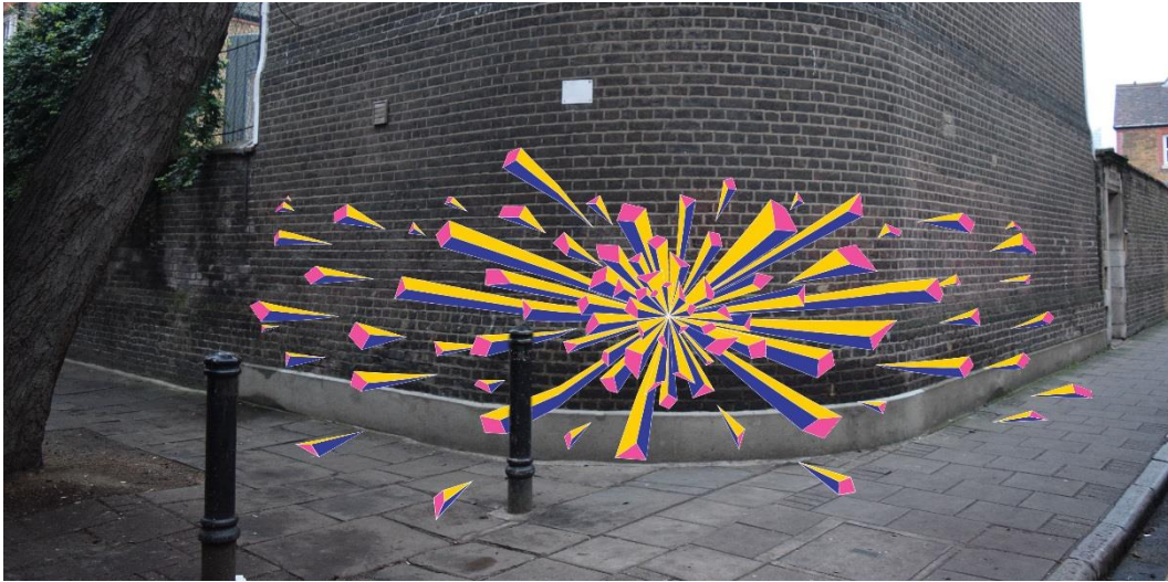
Image 2. Once Upon a Time designed by Natasha Lopez from Chelsea College of Arts

CDW will also present Decade , a dramatic trail of 10, three metre high candle-like beacons designed by pioneers within the creative industry as well as confirmed collaborations with brands such as Hakwood and Parkside . The installations, symbolic of birthday candles will also form part of CDW's wayfinding strategy to help guide visitors across the exhibition route whilst playfully celebrating CDW as the UK's leading independent design festival. With a nod to the area as London's creative heart, each installation will showcase the designers' individuality and imagination.