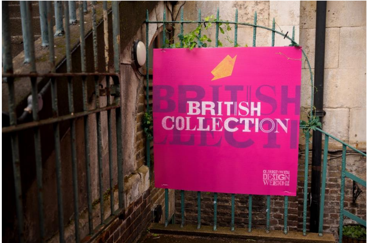
Clerkenwell Design Week 2022