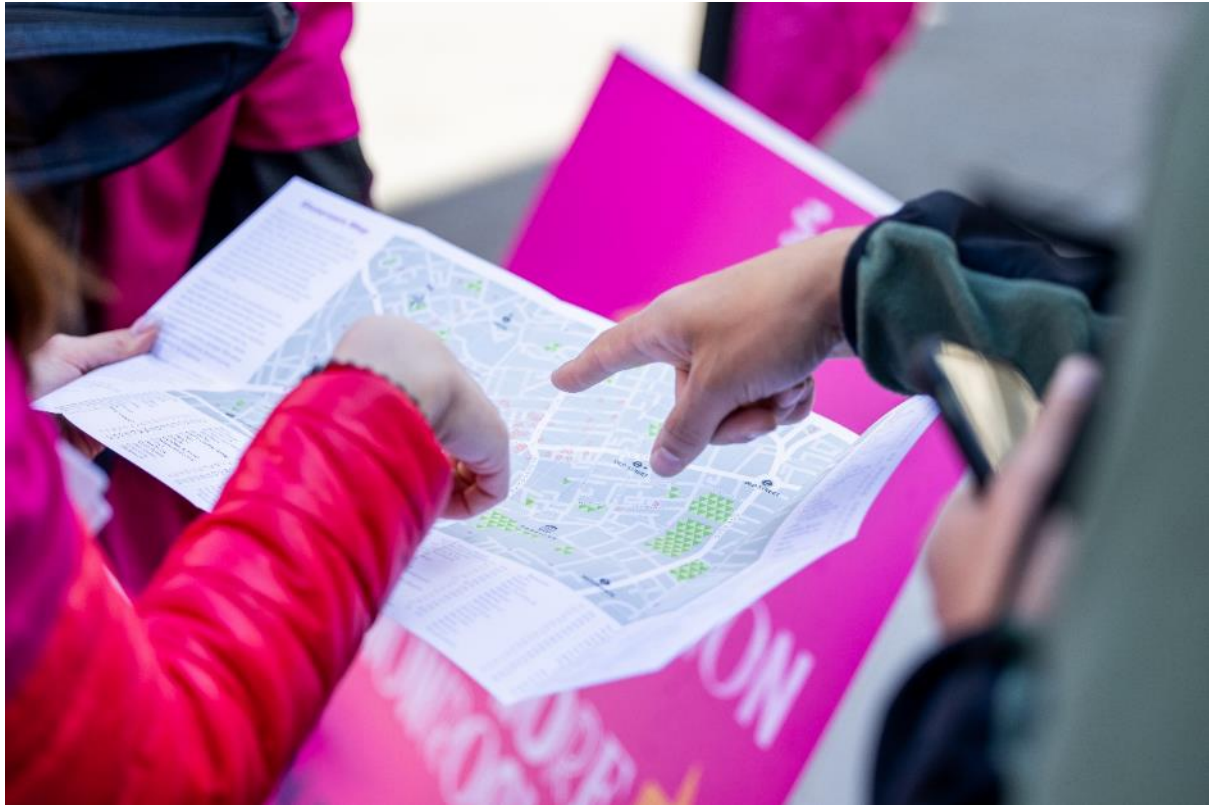
Clerkenwell Design Week 2022

London Metropolitan Archives , which holds an archive of London's history dating from 1067, will host Magnificent Maps of London during CDW. This free exhibition explores London's history in maps and includes a unique opportunity to see the first surviving map of the city, showing London in the 1560s.