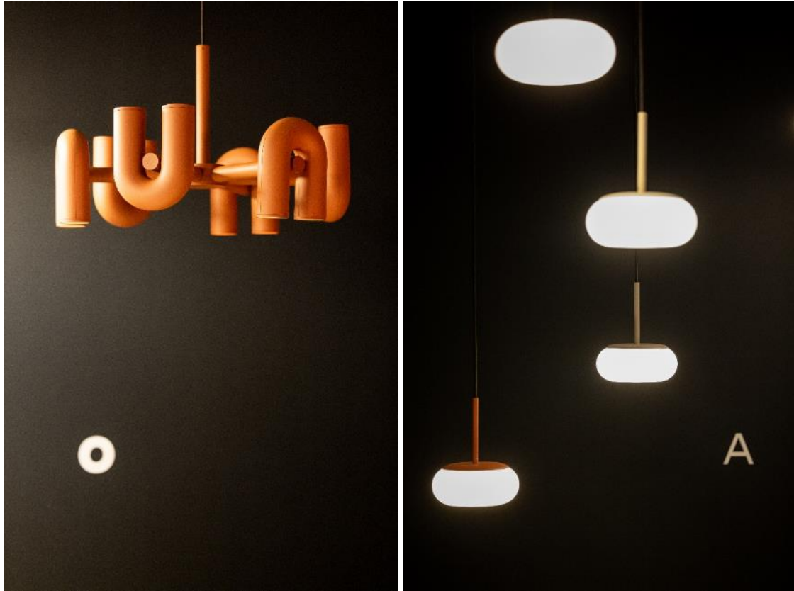
AGO, exhibiting at POP during CDW 2022 – Image by Black Edge Productions

POP , the former cold store turned nightclub is an essential visit, hosting pop-up brand activations and immersive experiences. POP features the latest designs by Case Furniture as well as the 170 th anniversary of their Robin Day 675 Chair and contemporary sculptural lighting by Square in Circle Studio and innovative lighting solutions by LEDS C4 .