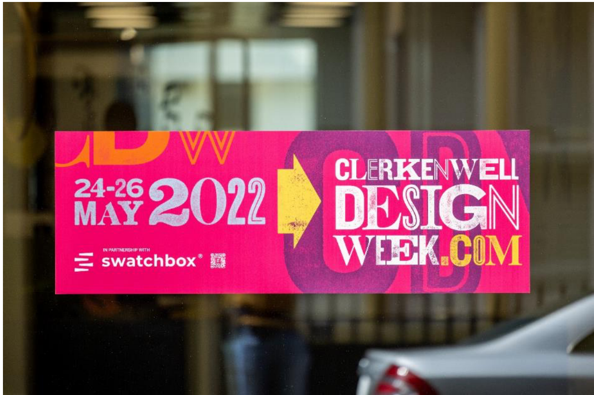
Clerkenwell Design Week 2022

May 2022, London: Opening today, the eleventh edition of Clerkenwell Design Week returns to London across 24 th – 26 th May. After a two-year absence, the much-loved design festival takes over EC1 – the capital’s most creative district – to celebrate the extraordinary creativity housed across London’s historic Clerkenwell. This year features more exhibitors, showrooms and venues than ever before. Over 140+ world-class design showrooms have partnered with CDW, providing an array of stimulating events, talks and workshops.