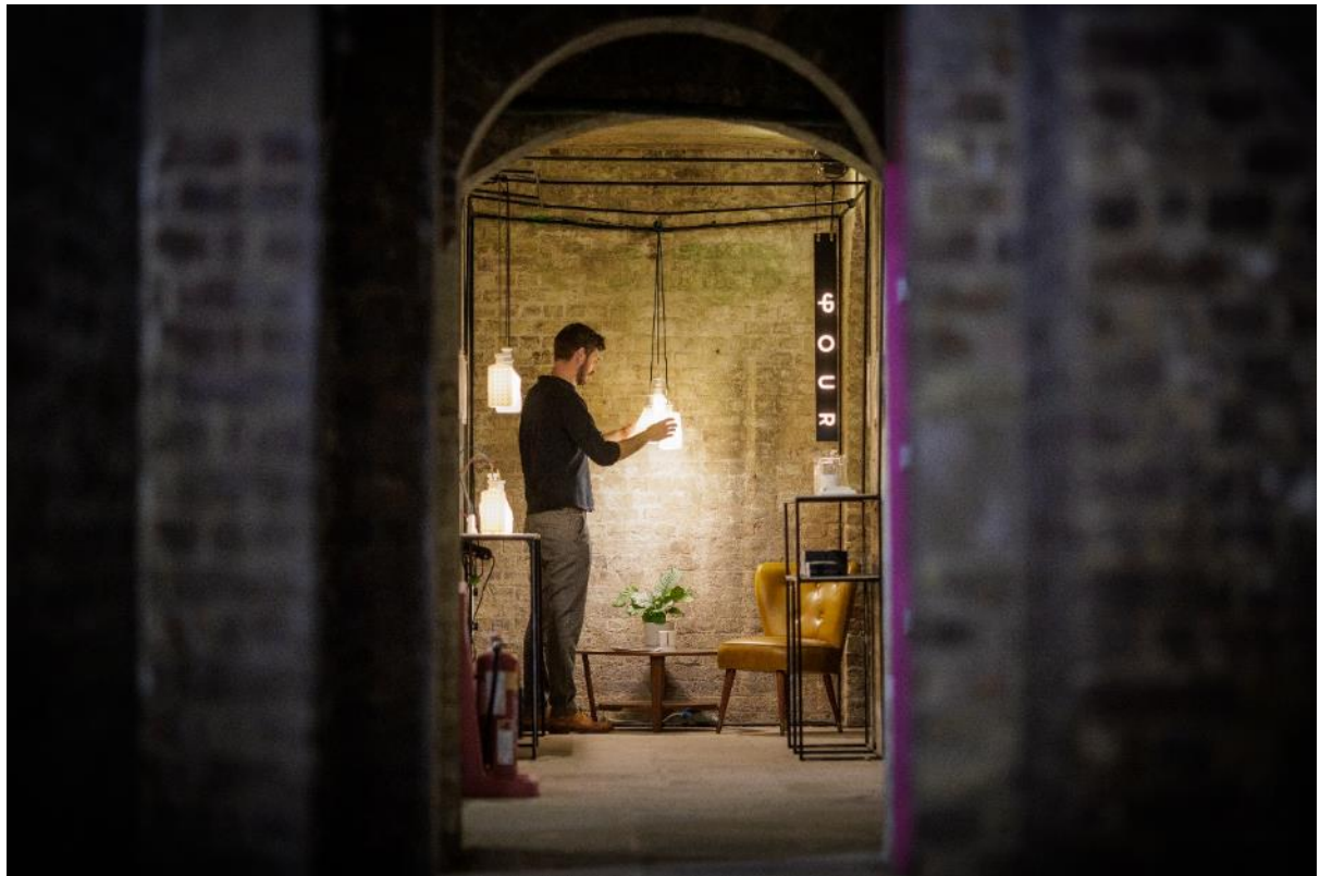
British Collection at CDW 2022