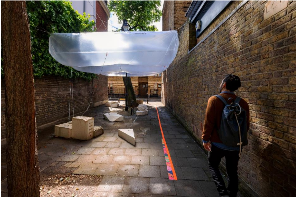
Shelter Installation by NVBL Architects at CDW 2022

OnOffice magazine are collaborating on another installation during CDW with plant and biophilic design specialist, Plant Designs . The project, titled Plant.Nurture.Bloom explores the importance of planting within urban working environments. The immersive installation is a jungle oasis within the bustling heart of the city for visitors to take a moment of calm and restoration by sitting within the leafiness and reflecting on the wealth of benefits that nature brings to modern life. The concept of green offices is on the rise and it's not hard to see why, with the average person spending a third of their life at work, it's more important than ever that we ensure our offices are an environment of positivity and inspiration. Plant Designs are also hosting workshops and demonstrations across the week including exploring how to incorporate biophilia and greenery in the workplace, and how to make a kokodama display.