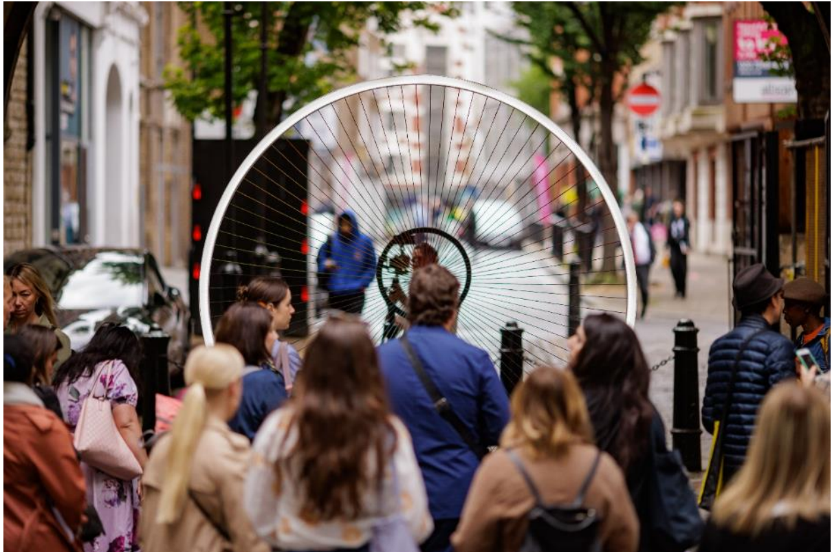
Interface Installation at CDW 2022

Interface's installation at Clerkenwell Design Week takes you on a visual journey of the company's history – from petroleum-intensive flooring manufacturer to global leader in climate conscious design and manufacture. Situated within St John's Arch, a stone's throw away from Interface's new showroom in Pennybank Chambers, the installation takes the form of a vortex made from the 100% recycled econyl yarn used in Interface's carpet tiles.