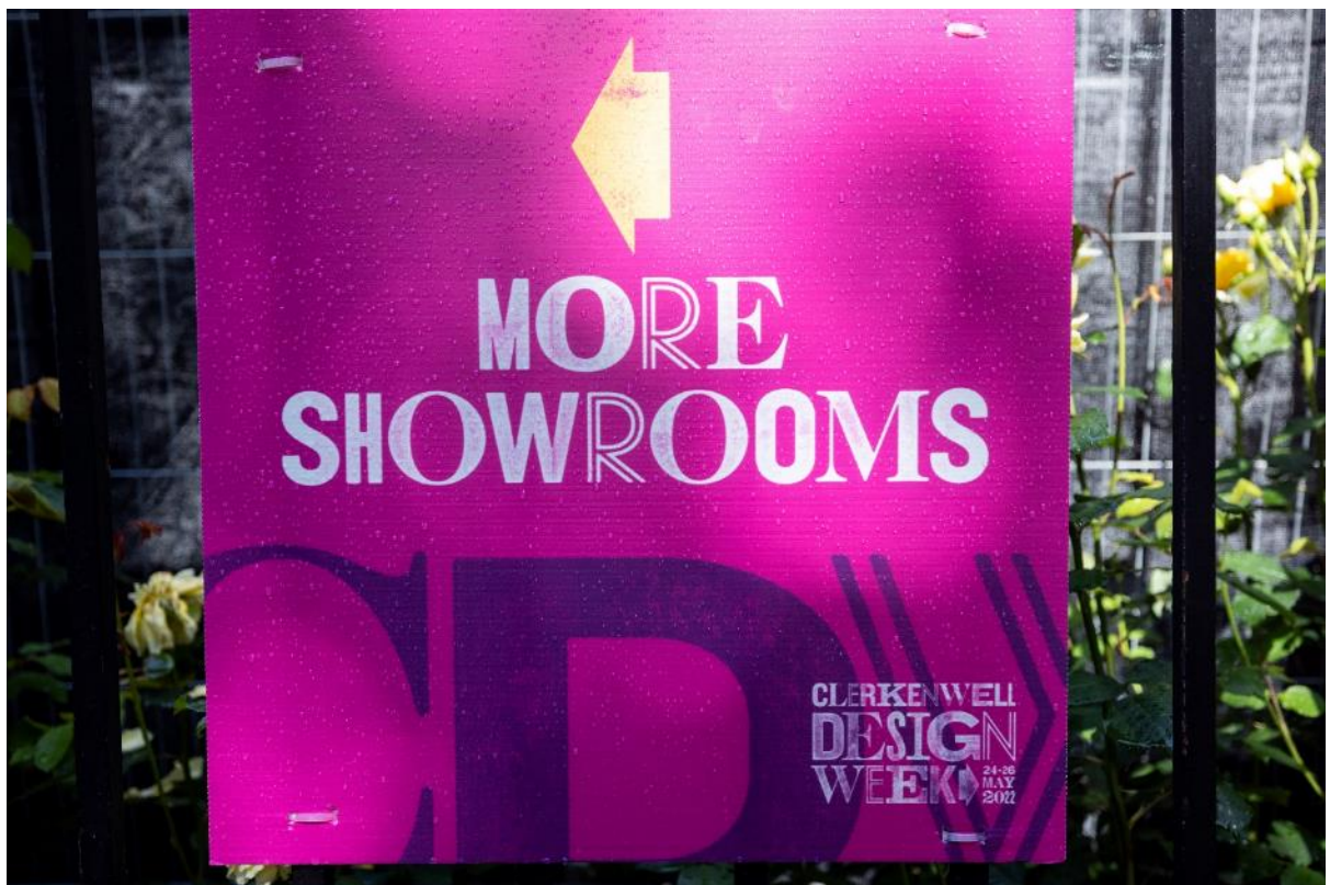
Clerkenwell Design Week 2022 – Image by Black Edge Productions