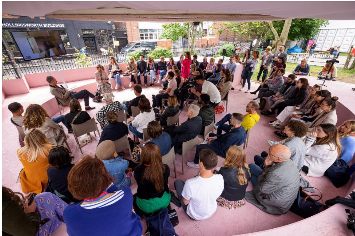
Conversations at Clerkenwell