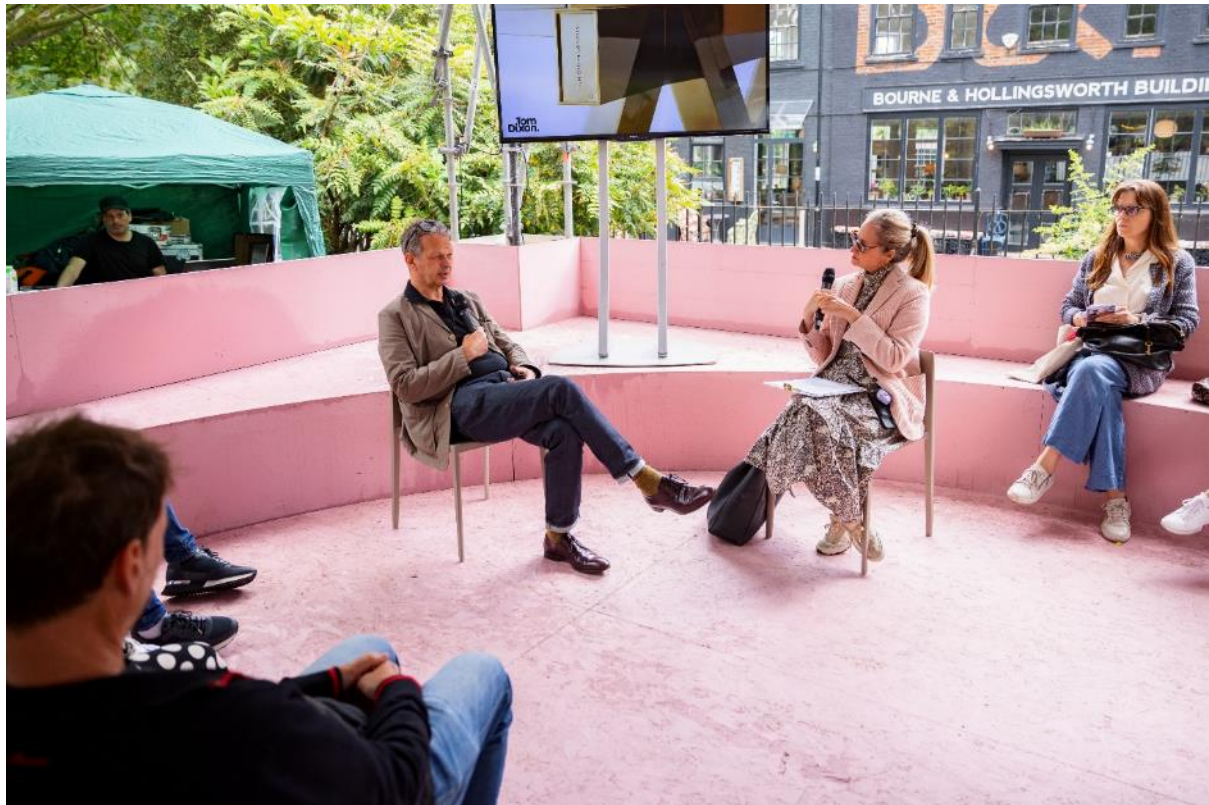
Conversations at Clerkenwell