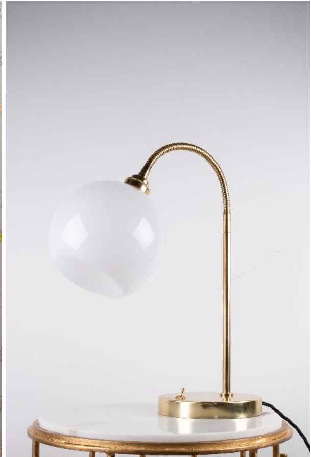
Designs by Fritz Fryer Lighting presenting at CDW 2022

Other new showrooms include natural stone specialists, SolidNature and RAK Ceramics , who have both opened new spaces in Clerkenwell in time for CDW 2022. RAK Ceramics's new 8000sq ft showroom called the RAK Ceramics Design Hub is at 100 St John's Street, hosting a number of events over the three days. SolidNature are celebrating their opening with an installation by Squire & Partners .