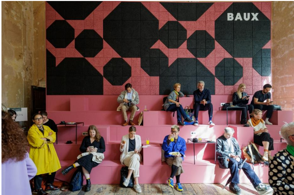
BAUX House of Acoustics at CDW 2022