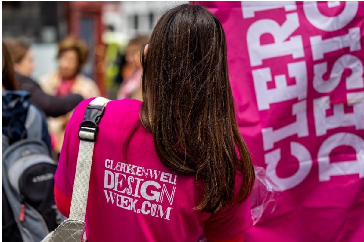
Clerkenwell Design Week 2022

Spanning across Clerkenwell, CDW's exhibitions are hosted in distinctive spaces – both purpose built and historical venues – around the area linked by a route running through the centre of EC1. For 2022, there are ten exhibitions – including three new venues - each with a different curatorial focus, ranging from cutting edge international design, to emerging talent, lighting, luxury interiors and the best of British design. New for 2022 is Covered sponsored by RAK Ceramics, an exhibition dedicated to interior surfaces. Forming part of a new festival location in Charterhouse Square, Covered will display the best in surface design and material innovation, and Contract where visitors can view the latest products for commercial interiors. Also new for 2022 is the ITA – Italian Trade Agency who are working in collaboration with the Ceramics Association of Italy to showcase nine brands in a specially built venue next to St John's Gate.