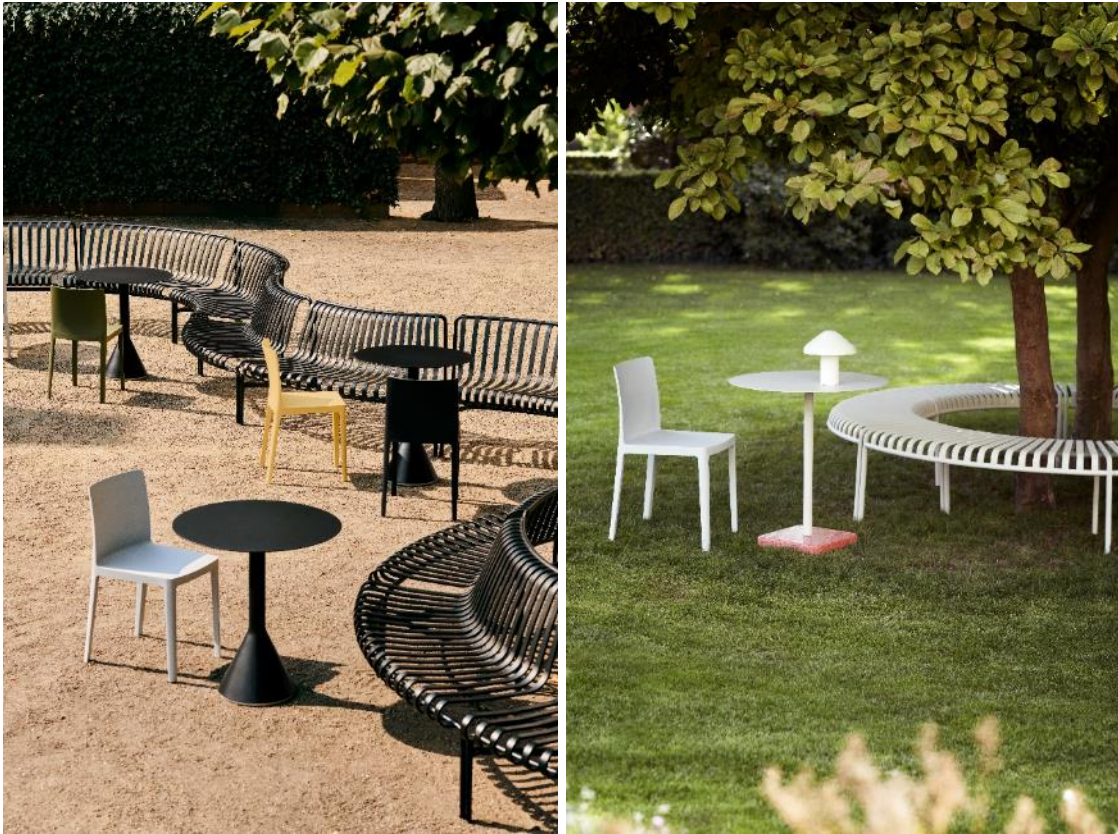
HAY, presenting at CDW 2022

Cult Danish design brand HAY are also presenting at CDW 2022, installing their stylish outdoor furniture within The Long Walk, part of Crypt on the Green, as well as hosting a number of events across the week.