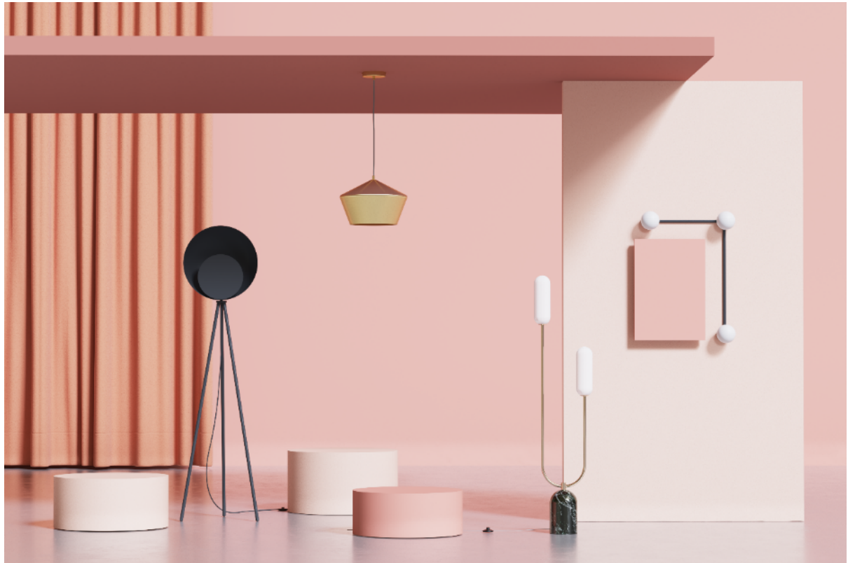
Houseofdotcom, presenting at Light + Rising Stars during CDW 2022

Clerkenwell's subterranean House of Detention, previously a prison in the mid-19 th century showcases Light + Rising Stars where a host of new and upcoming designers are exhibiting alongside leading lighting brands. Highlights include Artemide, Anna Hayman Designs, houseofdotcom, Kinkatou Studio London, Pour, Rankin Rugs among others.