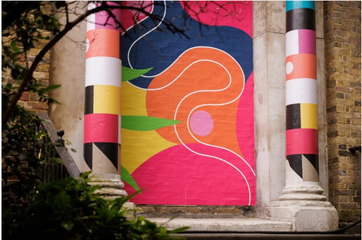
Mural by Lois O'Hara at CDW 2022

Over in Clerkenwell Close, NVBL Architects are presenting the installation Shelter . The London based office wanted to transform the Close into a public square to encourage social and cultural conversation whilst introducing minimal materiality. Returning to basic principles of architecture and the primary structure of shelter, the installation offers a delicate intervention with no disruption to the site, shaping a space where people can sit and gather. The temporary shelter is made of three elements: An inflatable, biodegradable TPU roof sits on a primary structural frame which is anchored down with off-cuts of stone. To respond to the temporality of the pavilion, the structure can be easily assembled & dismantled, and all materials are re-usable & recyclable.