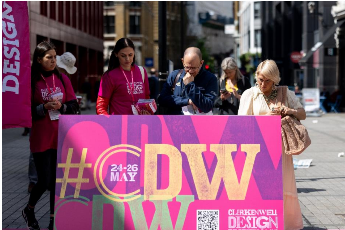
Clerkenwell Design Week 2022