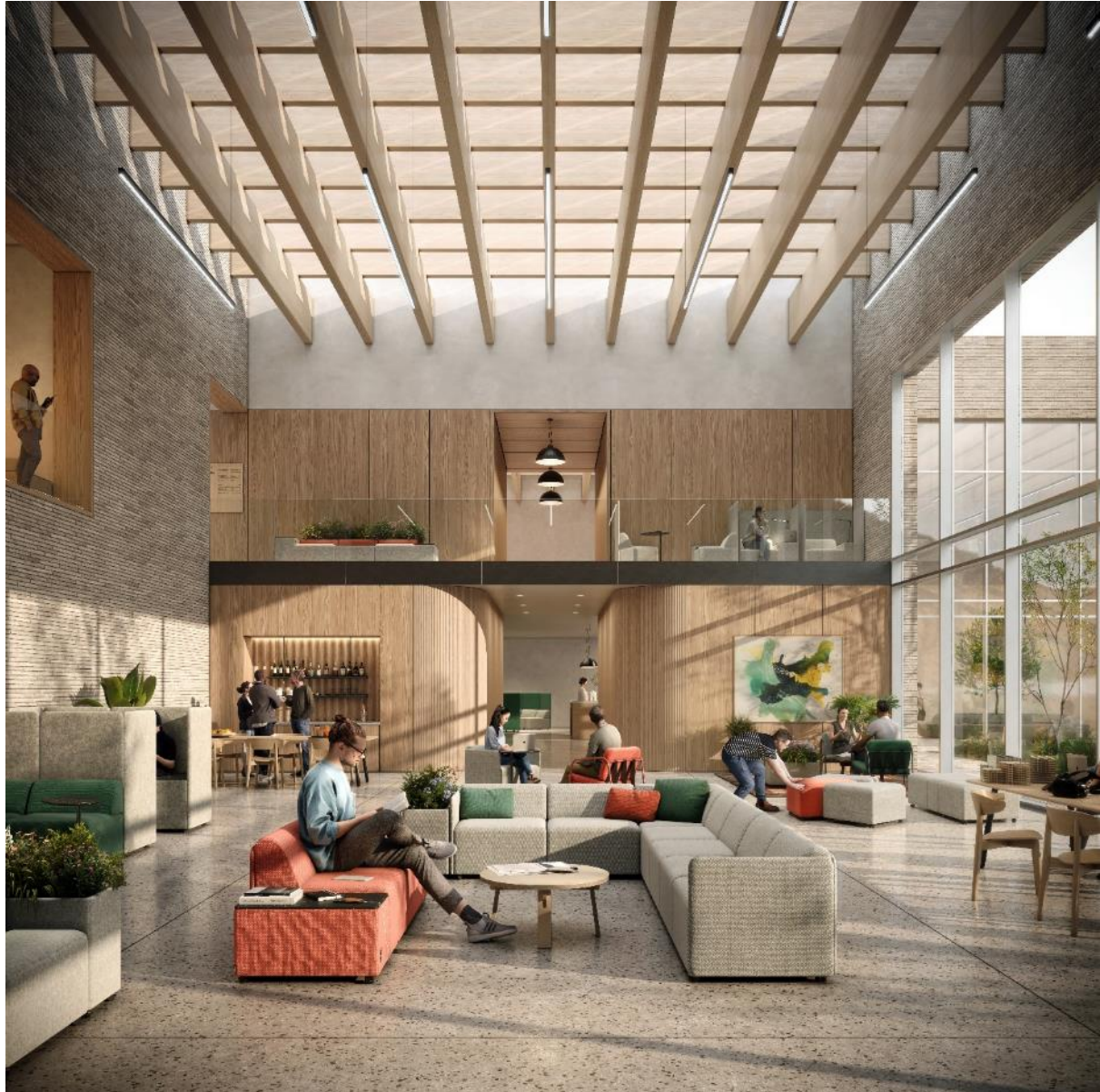
ReWork by Deadgood launched at CDW 2022

Integral to the festival are the local resident design showrooms. With more participating than ever before, Clerkenwell Design Week promises to provide an array of stimulating events from talks and workshops to major installations. From CDW's humble beginnings with less than 40 participating showrooms back in 2010 to over 140+ confirmed for 2022, this year's show is truly bigger than ever before.