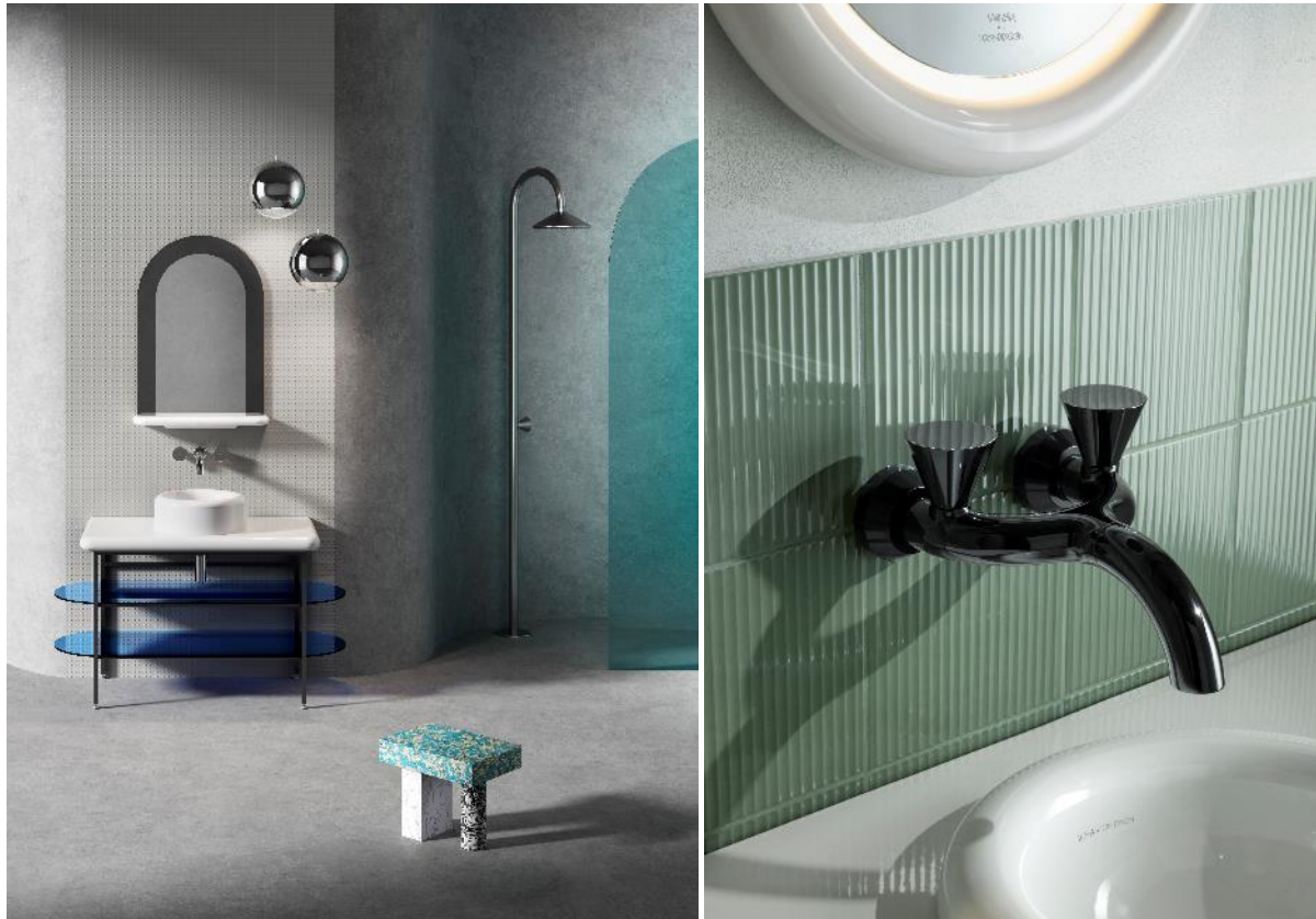
Liquid series by Vitra presenting at CDW 2022