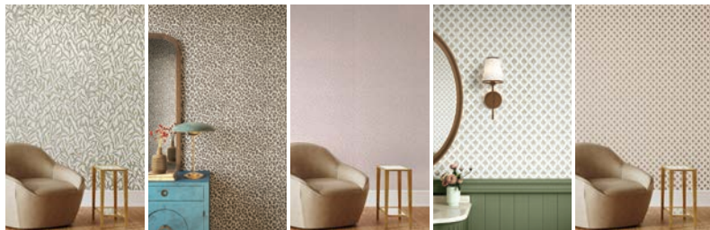
Walk in the Park* Wild Thing Wild Thing* Tea Time Tea Time*