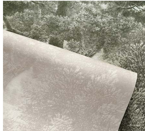
Items Shown (left to right): 28000 Serene, 28004 Meadow

Inspired by a vintage 18th-century drawing discovered at a Paris market, this delicately illustrated and detailed landscape exudes elegance and charm. The soft, muted tones transform this picturesque view into a serene and idyllic backdrop. Offered in seven curated colors that feel like scenes from a storybook.