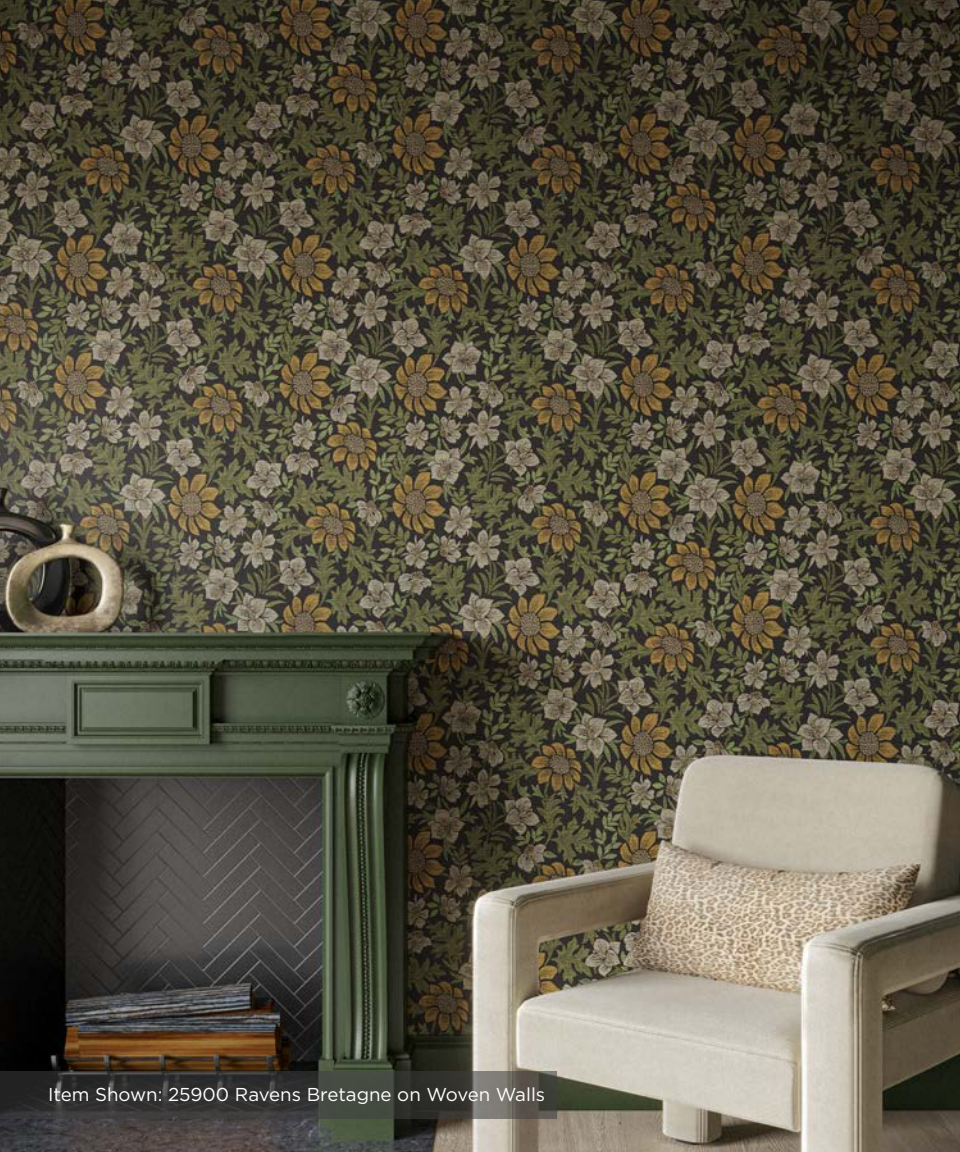
Item Shown: 25900 Ravens Bretagne on Woven Walls

With a nod to classic botanical illustrations, this intricate floral pattern blends nature with colorful charm and a modern sensibility. These eight colorways add a touch of nature to the walls.