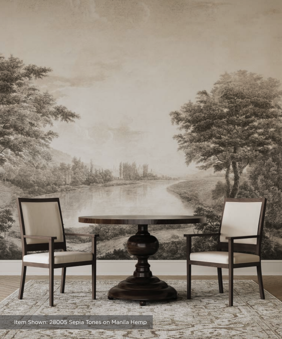
Item Shown: 28005 Sepia Tones on Manila Hemp