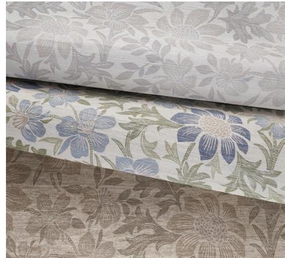
Items Shown (top to bottom): 25906 Greige Garden, 25901 Bluebell, 25904 Smokey Taupe