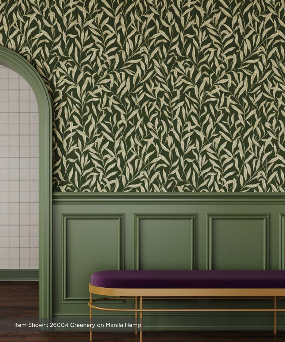
Item Shown: 26004 Greenery on Manila Hemp