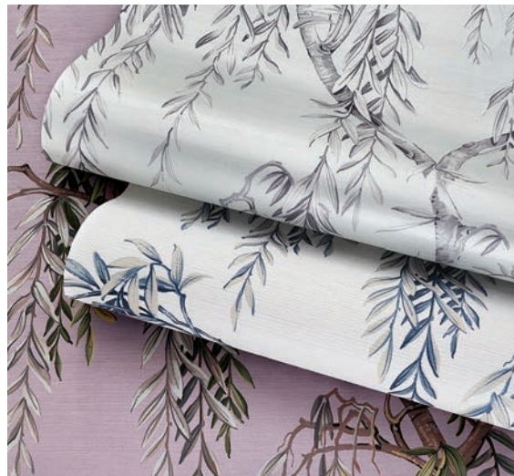
Items Shown (top to bottom): 27804 Silver Silhouettes, 27806 Blue Harmony, 27802 Lush Lilac

The gentle arch and graceful curves of sweeping willow branches add serene beauty and effortless elegance to any space. Embrace the calm of nature with this immersive, all-over design offered in eight colors.