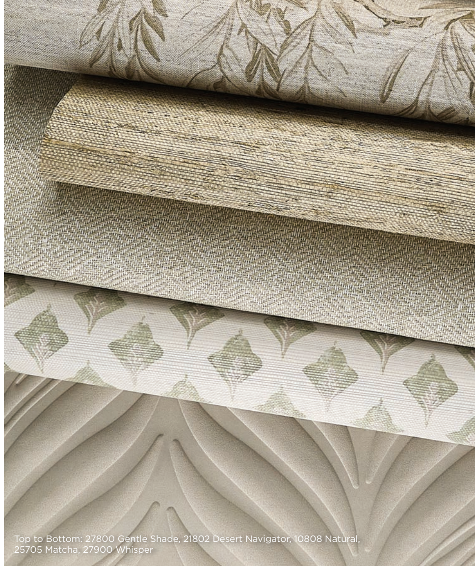
Top to Bottom: 27800 Gentle Shade, 21802 Desert Navigator, 10808 Natural, 25705 Matcha, 27900 Whisper

© 2025 PHILLIP JEFFRIES. All Rights Reserved. We Vigorously Enforce Our Rights.