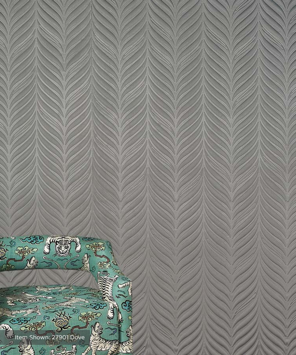
Item Shown: 27901 Dove

A new twist on a herringbone pattern, this soft, suede-like fabric is meticulously crafted into a flowing dimensional design with sound absorption qualities. Seven sophisticated colorways elevate any space.