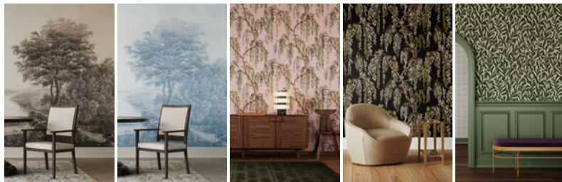
Vista* Vista* Whispering Willows Whispering Willows* Walk in the Park

All images have vertical and horizontal options available.