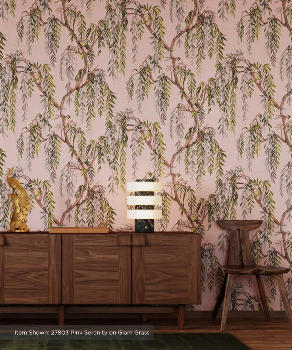
Item Shown: 27803 Pink Serenity on Glam Grass