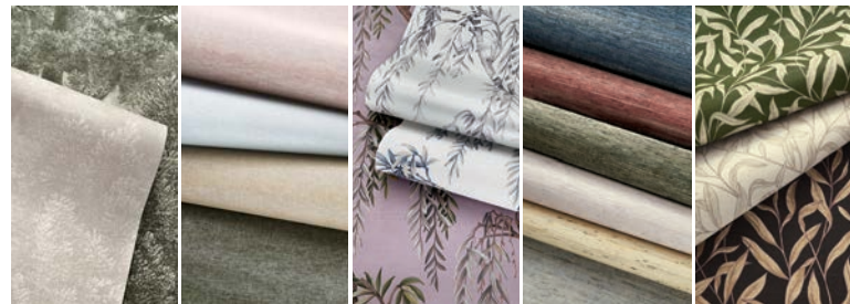
Vista Pastoral Linen Whispering Willows Extra Fine Arrowroot Walk in the Park