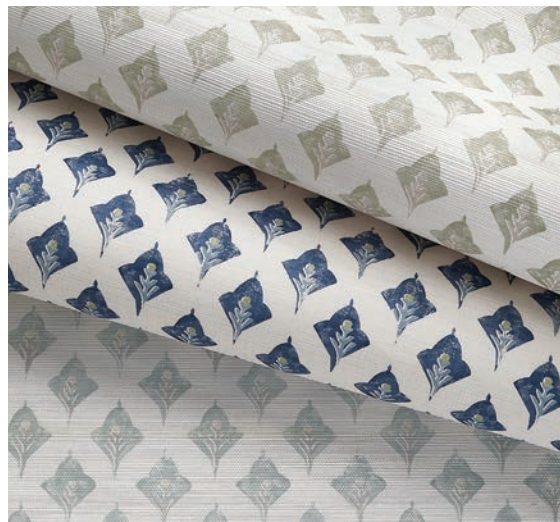
Items Shown (top to bottom): 25705 Matcha, 25703 Butterfly Pea, 25707 Celadon Pearl

Capturing the sense of shared moments, this vintage-inspired all-over pattern has the look of a hand stamped block print with muted hues and incredible texture. Eight colorways are versatile for a chic layered look in any space.