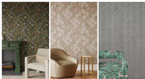
Brittany Botanicals Brittany Botanicals* Peaceful Plumes