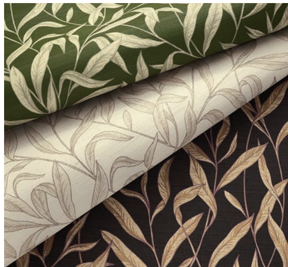
Items Shown (top to bottom): 26004 Greenery, 26000 Beige Bliss, 26001 Midnight Stroll

Like a casual stroll through nature. This delicate leaf-inspired print has a graceful flow and elegant style offered in nine soft tones and bold, dramatic hues.