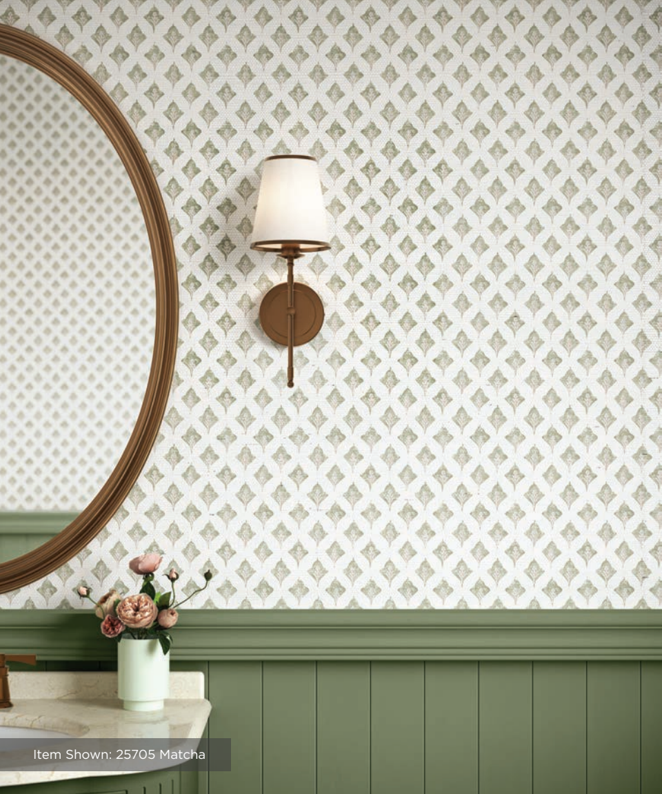
Item Shown: 25705 Matcha