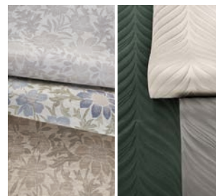
Brittany Botanicals Peaceful Plumes