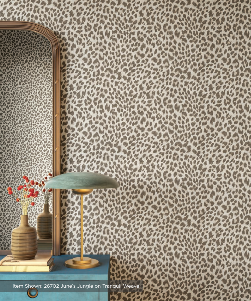
Item Shown: 26702 June's Jungle on Tranquil Weave

Embrace untamed elegance. This sophisticated cheetah print has a refined color palette that enhances the pattern's natural contrast and timeless style. Offered in six fashionable colors.