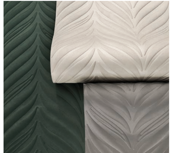
Items Shown (clockwise from top right): 27900 Whisper, 27903 Ashen, 27902 Enchanted