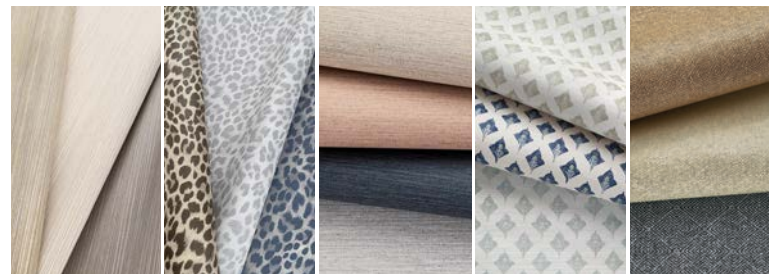
Sienna PVC Free Wild Thing Enzo PVC Free Tea Time Compass Weave