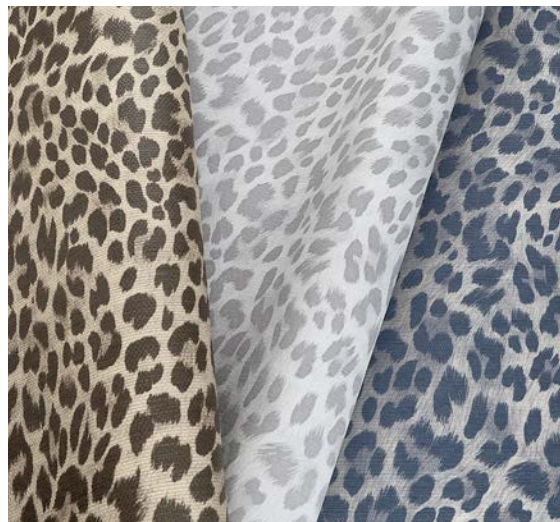
Items Shown (left to right): 26702 June's Jungle, 26705 Steel Prowl, 26703 Cosmic Roar