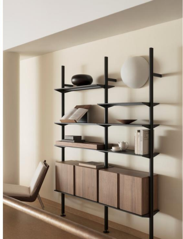
LEFT: Pira G2, White, floor-ceiling mounted. Cabinets and organisers in white oak RIGHT: Pira G2, Black Grey, floor-ceiling mounted. Cabinets and organisers in walnut

Thanks to its frame and size, Pira G2 carries an obvious gravitas and architectural expression. An elegant and impressive piece of furniture, Pira G2 is suitable for large living spaces or public spaces as its shelves can hold up to 50 kilos, large cabinets, solid bookends and dividers.