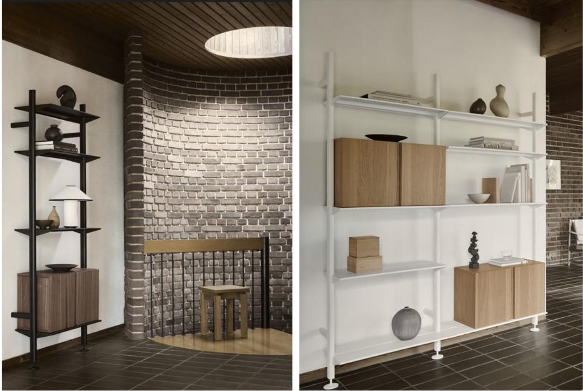
Pira G2, Walnut and Oak

Manufactured exclusively from high-end materials, its shelves are made of lacquered steel sheets and the poles of extruded aluminium which emphasises its solid expression. With a choice of walnut or white oak cabinets, bookends and the magazine shelf, its wood brings a beautiful warmth, creating a contrast against the lacquered materials.