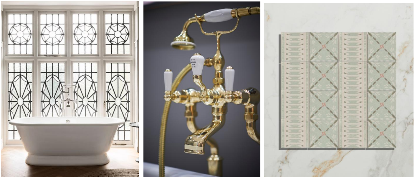
LEFT : Victoria + Albert York bath CENTRE : Perrin & Rowe Traditional Bath Filler (24-carat gold)

For true bathroom luxury, traditional bath taps alongside a roll-top bath epitomise the era of Downton Abbey and aristocratic good taste. Victoria + Albert is better known for its contemporary designs, but the York is one of their Edwardian-inspired baths, with a roll top and a classic plinth, cleverly hiding the waste plumbing. In an en vogue Olive Green (RAL 3005, one of a choice of over 200 RAL colours available on any Victoria + Albert bath or basin), the bath is complemented by a Perrin & Rowe Traditional bath filler in a 24-carat Gold finish.