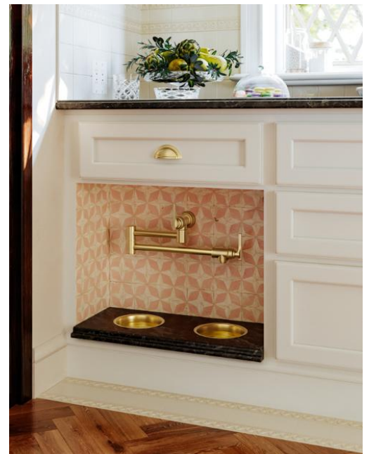
Perrin & Rowe Southbank pot filler (used as dog bowl filler)

The island features appliances from Fisher & Paykel, recognised as the brand of choice for quality kitchens.