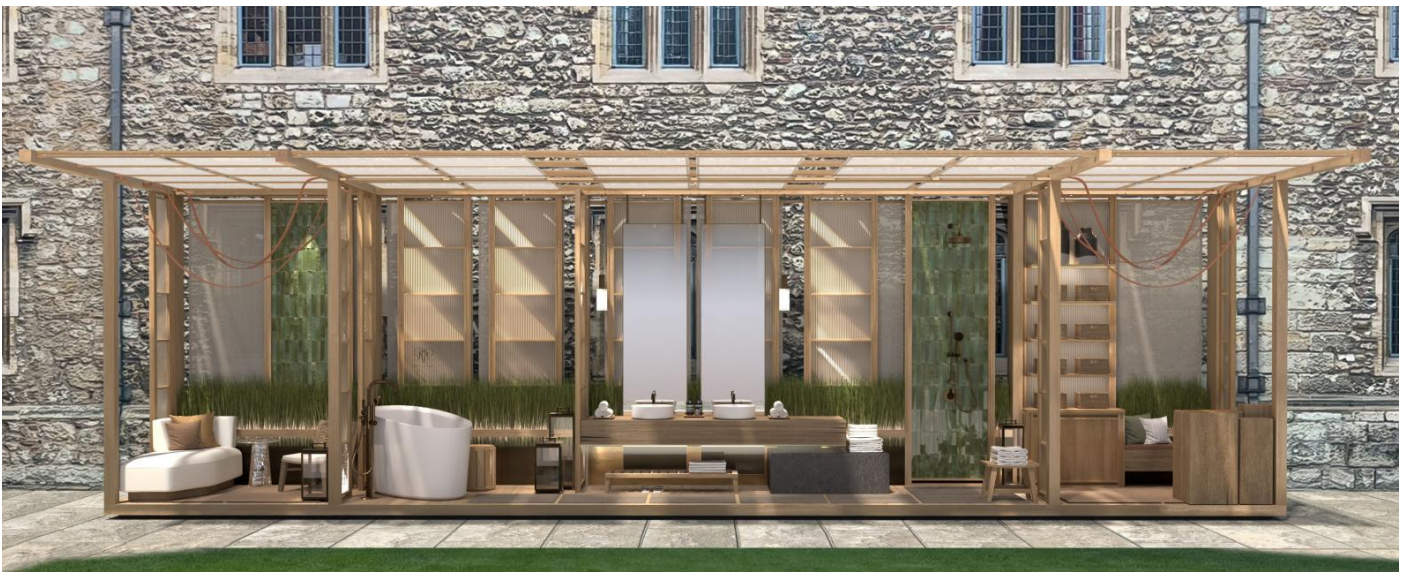
Visualisation of Victoria + Albert display, by GA Design, at the courtyard of the London Charterhouse

Traditional bathroom display by Perrin & Rowe and Victoria + Albert, with Artisans of Devizes