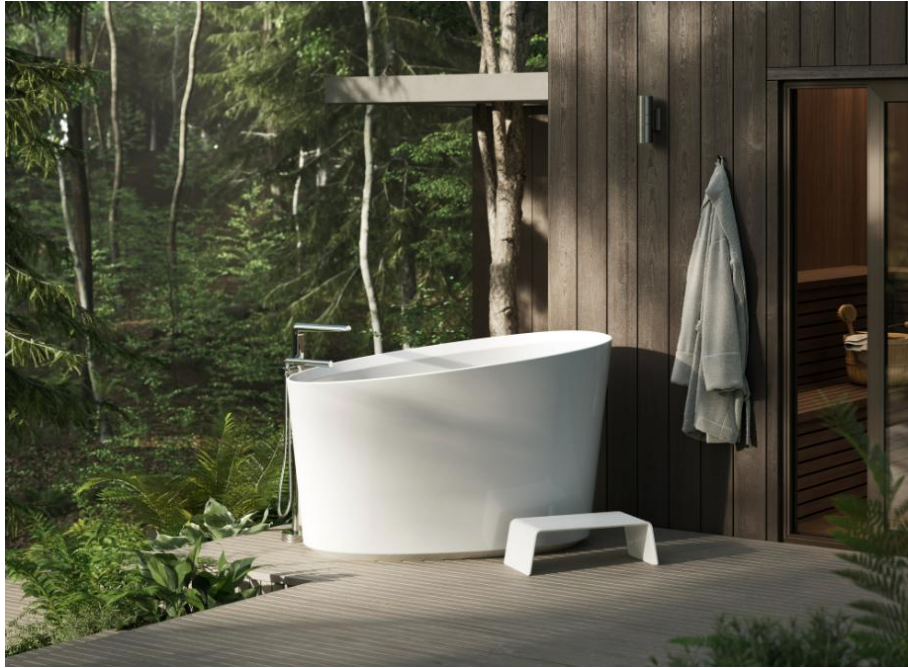
Victoria + Albert's new Kerid soaking bath, shown with Riobel's Parabola brassware

creates a cradle for the neck and head. There is also a deep chamfer at the base of the bath, creating a 'floating' effect.