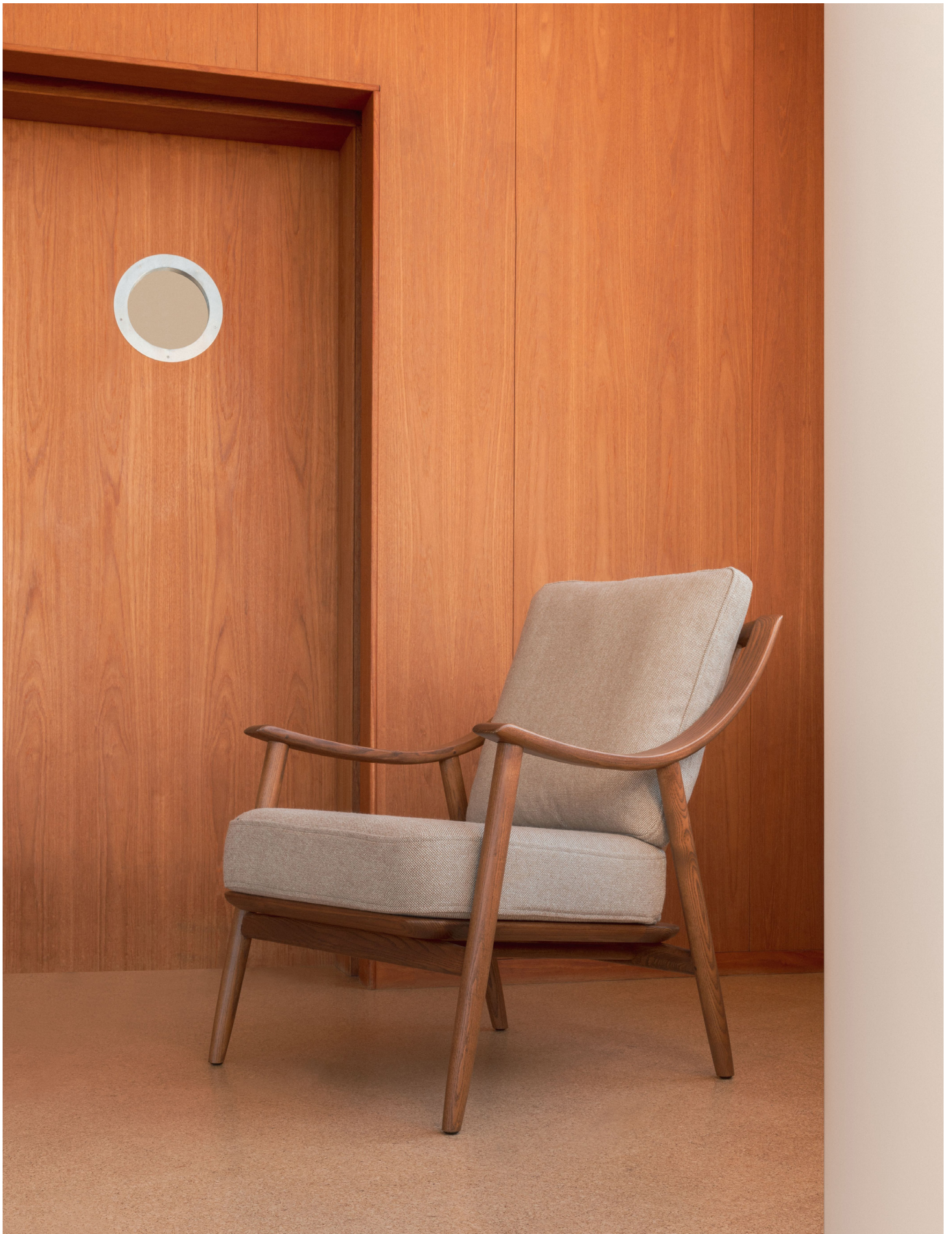
British Collection, Crypt on the Green Stand B3