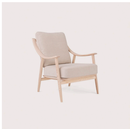
ercol Marino Chair