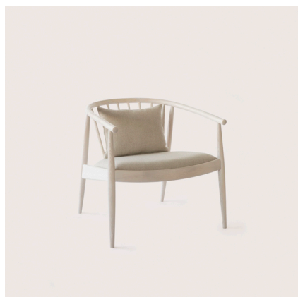
Reprise Upholstered Chair

Manufacturing British handcrafted furniture for over 100 years, ercol Furniture takes immense pride in the brand's heritage and is admired for its rich history and pioneering spirit. Specialising in solid wood furniture, craftsmanship and quality, the brand is synonymous with its signature mid-century collections as well as an award-winning portfolio of contemporary ranges crafted for modern living.