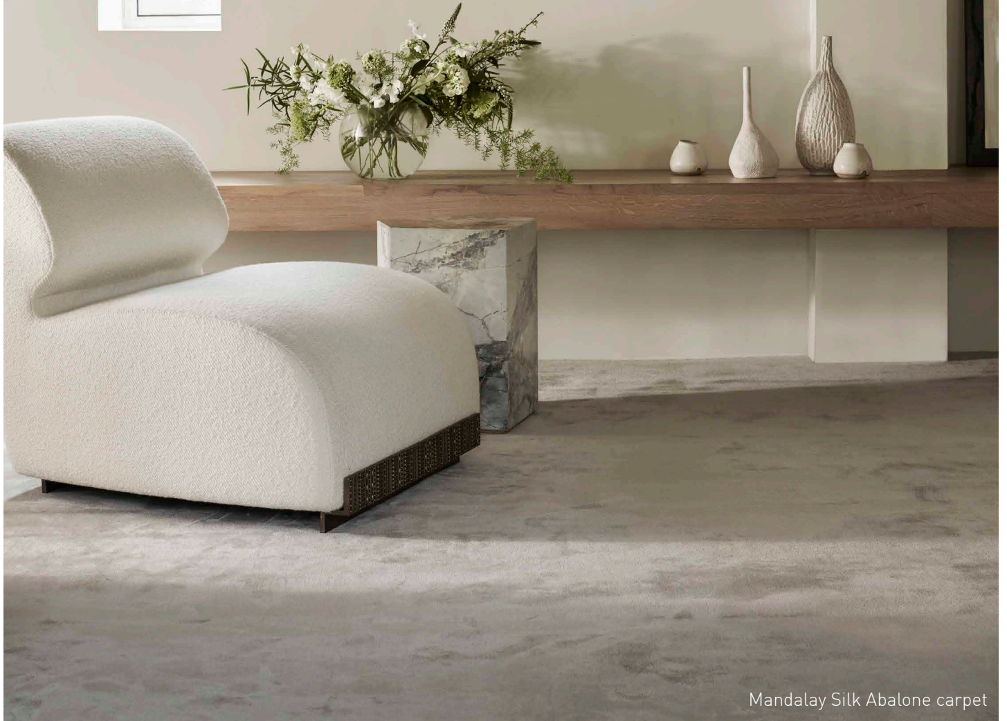
Mandalay Silk Abalone carpet

Mandalay Silk is handwoven from 40% real silk and 60% Merino wool .