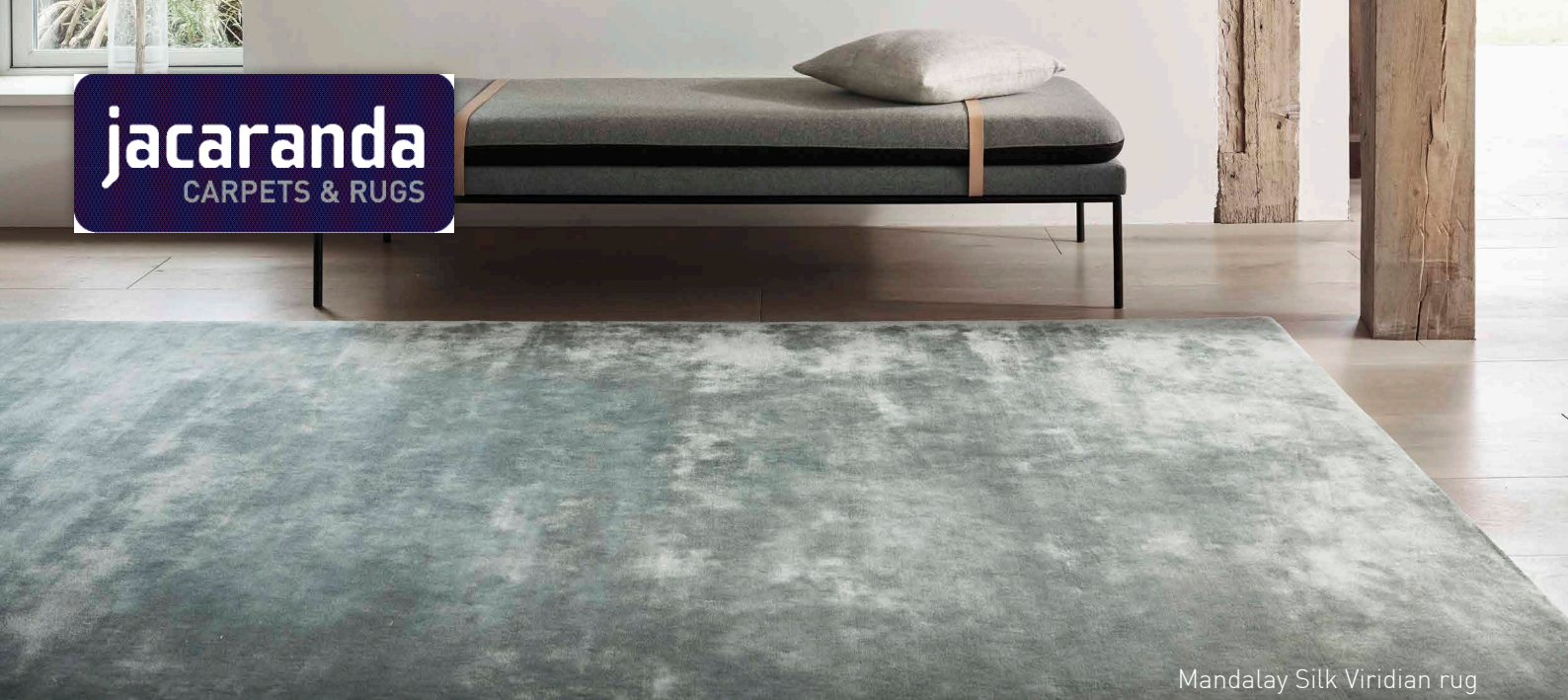
Mandalay Silk Viridian rug