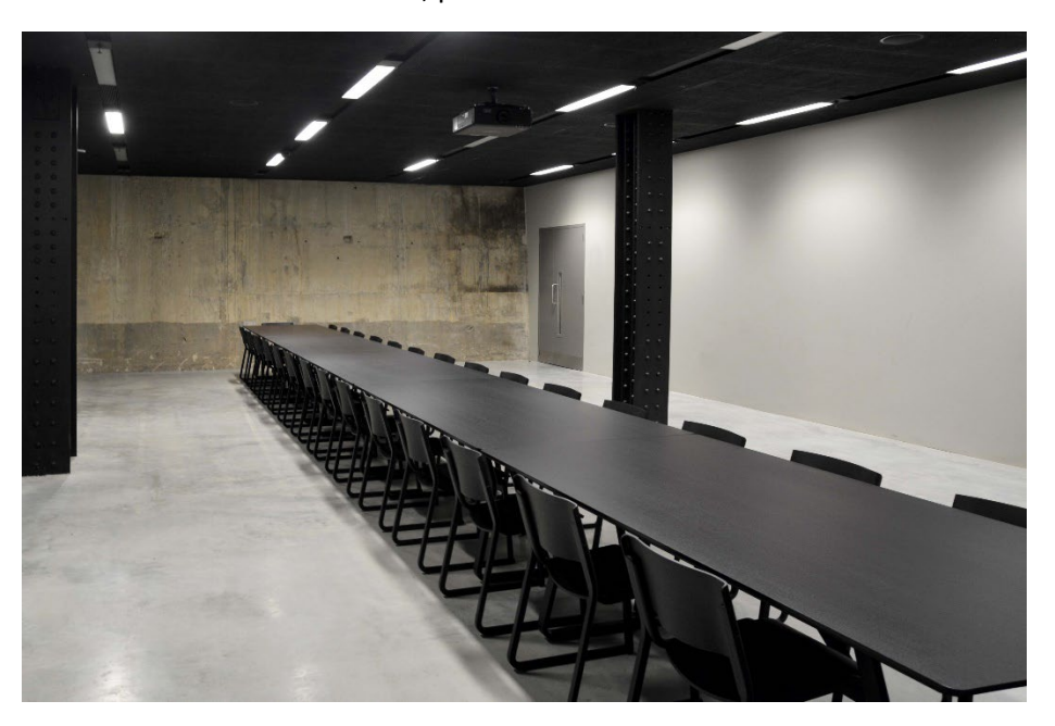
THEO Chairs & Folding Tables at the Tate Modern

For more information on THEO, please visit: theofurniture.com