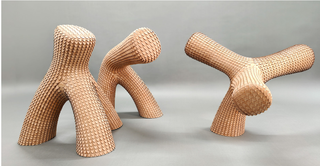
Spirits. January 2024

SPIRITS is a series of conceptual sculptures, brought to life by surface designer Orsi Orban in collaboration with design studio Duffy London.