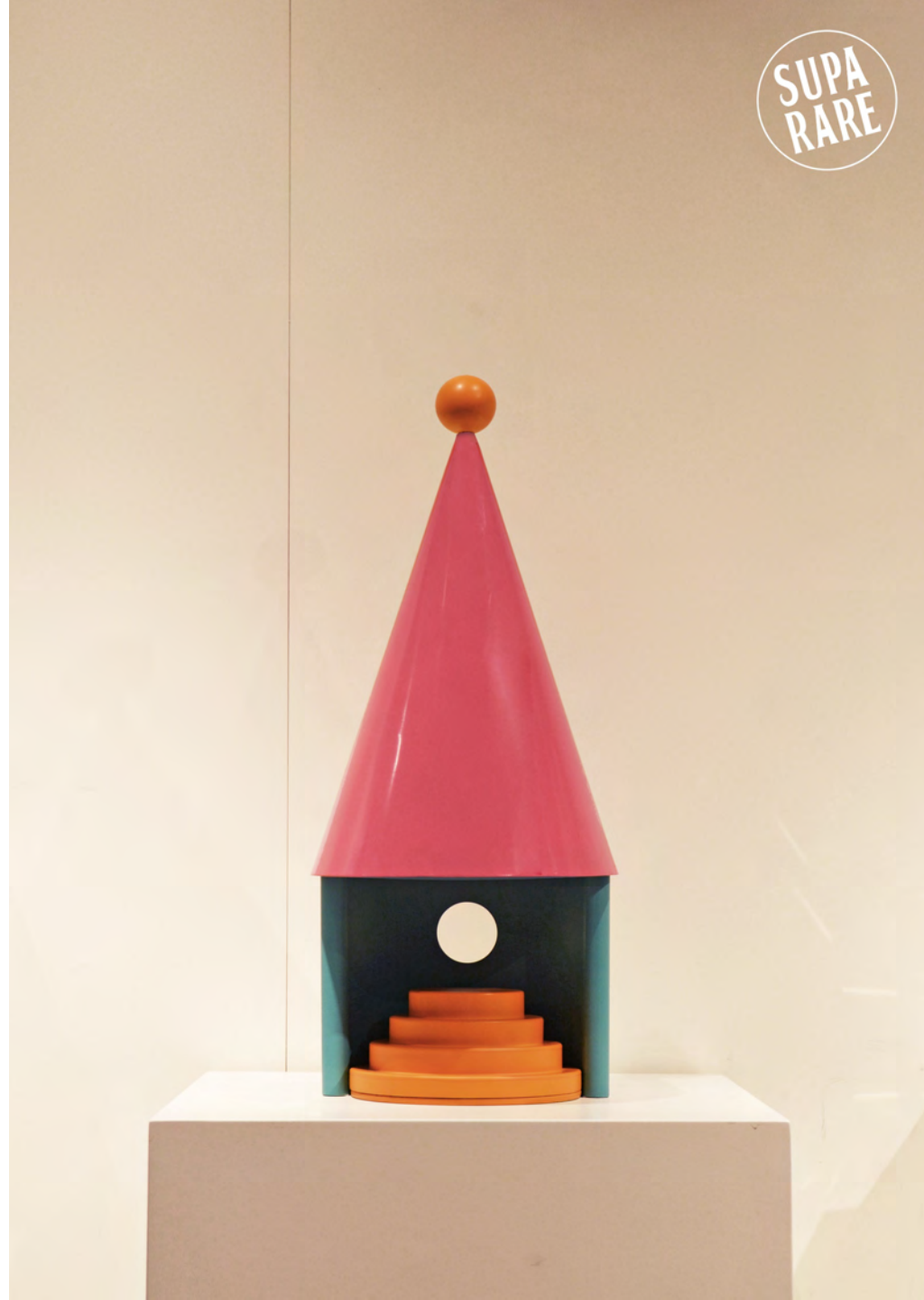
DREAM CASTLE LAMP