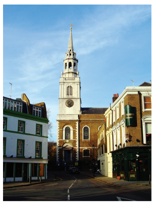
St James Church, Clerkenwell | Event Venue

SCP advocates products that are functional, beautiful, and made to last. They work closely with a wonderfully diverse group of designers, who ensure creativity is kept at the heart of the company. The SCP company headquarters on Curtain Road, Shoreditch, houses both an esteemed and award-winning Retail Showroom and first-floor Showroom for SCP Contracts, the division of SCP that work directly with interior designers and architects.