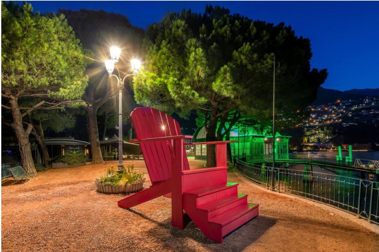
Orticolario's Delenimentum installation - the gigantic version of the Adirondack Chair created in 1903 by designer Thomas Lee, which will feature in Charterhouse Square during CDW 2022

This year CDW's festival route has been extended to include Charterhouse Square which will see Orticolario's Delenimentum installation taking centre stage. The gigantic version of the legendary Adirondack Chair created in 1903 by the designer Thomas Lee is a playful and photo-worthy addition to this year's show.