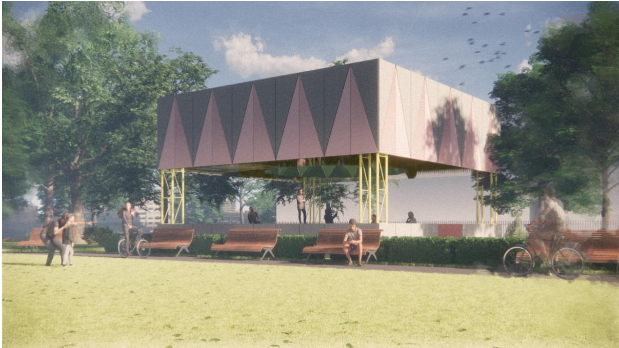
Render of Conversations at Clerkenwell Talks Space

Conversations at Clerkenwell has always been a highlight of the show, with a specially designed venue in Spa Fields. Designed by Fieldwork Architects, the concept for the CDW 2022 talks space reimagines the traditional Victorian bandstand as a focal point within the park, a place for gathering, discussion, entertainment and shelter. Rather than a traditional forward facing seating arrangement, the nature of the bandstand form allows the focus point to be partially in the round and engage the audience as a discussion, rather than a presentation. As a place for debate, the talks space is required to be both inward and outward looking. The mass of the bandstand has been inverted within a solid cube, focussing attention and sound on the speaker via a centrally located geodesic formed dome and circular seating below.