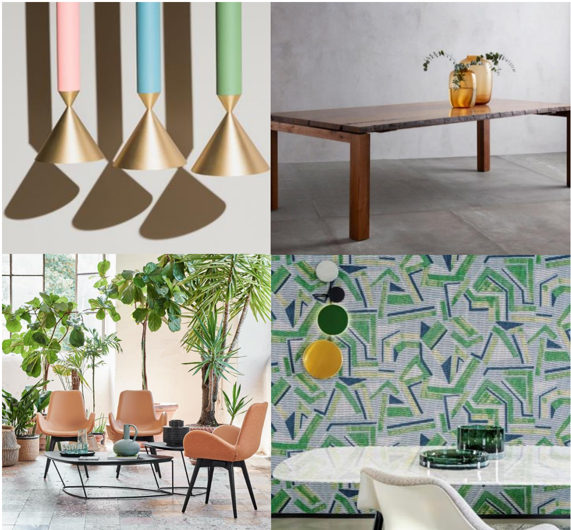
Images clockwise from left to right: Pholc, Takumi Woodwork, Arte, Midj

Clerkenwell Design Week (21 – 23 May) is London's leading design district and an important part of the global design calendar. Set across seven exhibition spaces, CDW venues include fabric , The House of Detention , St James Church and Spa Fields . Each venue reflects the unique nature of this culturally rich area, with leading UK and international companies exhibiting and launching new products during Clerkenwell Design Week. From luxury interiors to innovative lighting, emerging talent and the best of British brands, the exhibition spaces at CDW encompass every facet of design.