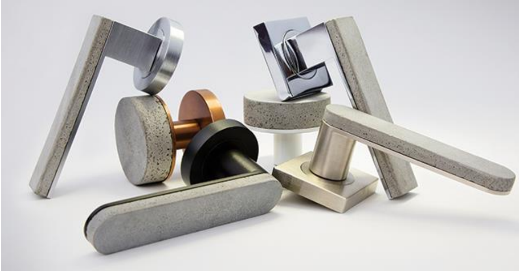
Image 11. Designer Doorware

Design is in the detail - and details are showcased at Elements which brings together a leading selection of ironmongery, hardware, switch plates and architectural accessories within a street-market style pavilion on St John's Square, becoming a go-to destination for designers looking for the perfect finish.