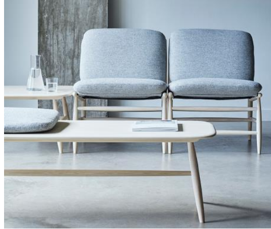
Image 6. ercol, VON collection

Benchmark , the powerhouse of British craft will be presenting new upholstered versions of the OVO collection designed by Fosters + Partners in an ebony finish. Hand & Eye Studio will present the O-Beam , a highly versatile light that suits a myriad of spaces with a unique texture inspired by ceramics. Other renowned names in the British furniture industry exhibiting include Brixton-based cabinet makers West & Reid , Forest & Maker and Nathan Furniture .