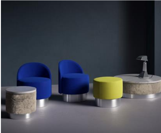
Image 7. Tacchini X Studioepepe, PASTILLES