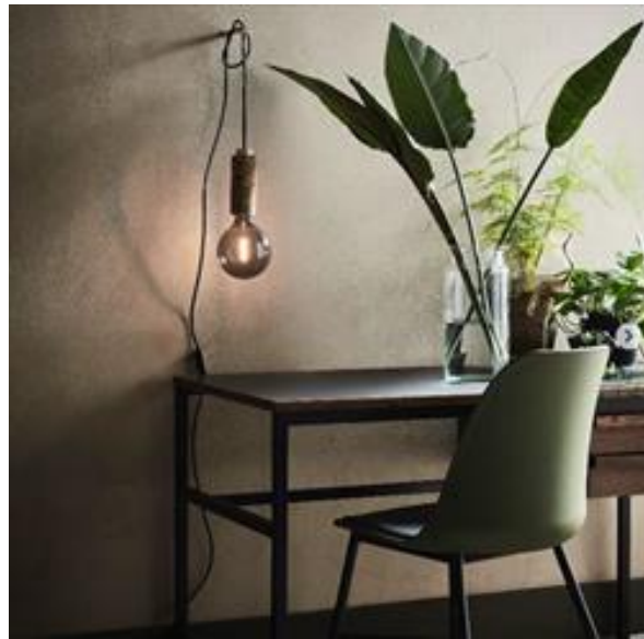
Image 10. NOVE Lighting