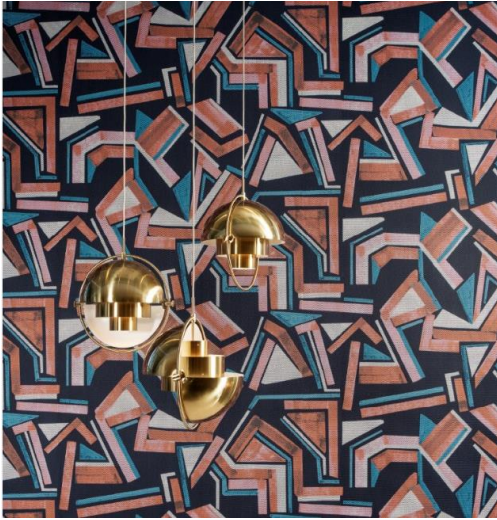
Image 12. Vanguard Collection by Arte

Opening hours: 10:00 – 19:00 daily and 10:00 - 21:00 on Wednesday