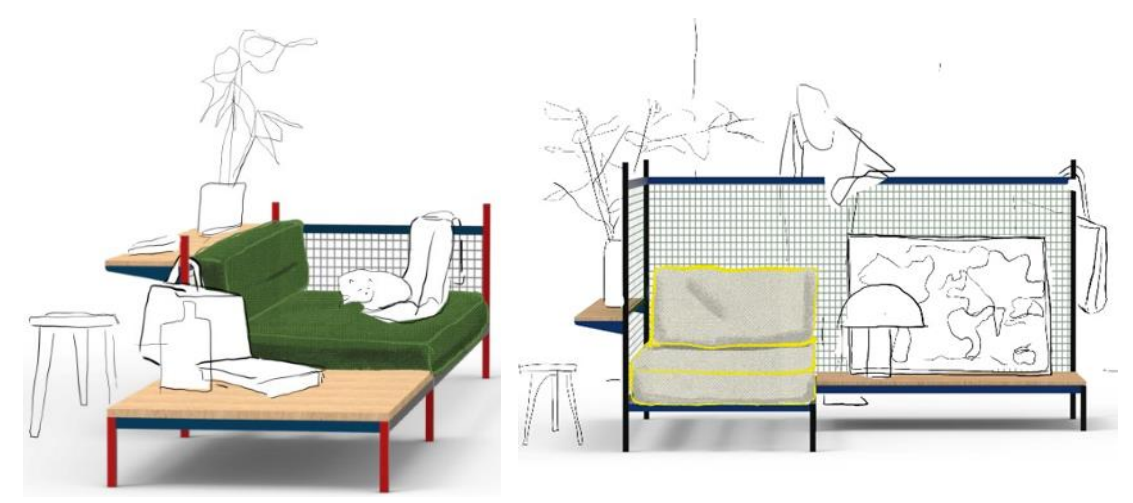
Image 10 & 11. GRID SOFA by Ronan & Erwan Bouroullec for Established & Sons

For Clerkenwell's 10<sup>th</sup> anniversary, a plethora of exciting pop up showrooms and workspaces will take place during the festival. Established & Sons will take up residency in Fora to launch four new designs including The GRID SOFA by Ronan & Erwan Bouroullec, the KD TABLE and BEAM TABLE by Konstantin Grcic and the LUCIO CHAIR by Sebastian Wrong. Conceived as a complete take-over of Fora's breakout spaces, the installation will invite visitors to explore the possibilities of Established & Sons' new, innovative designs by trying them out with hot-desking, wi-fi and refreshments from Fora's in-house cafe. The installation will be complemented by a series of talks, workshops and events.