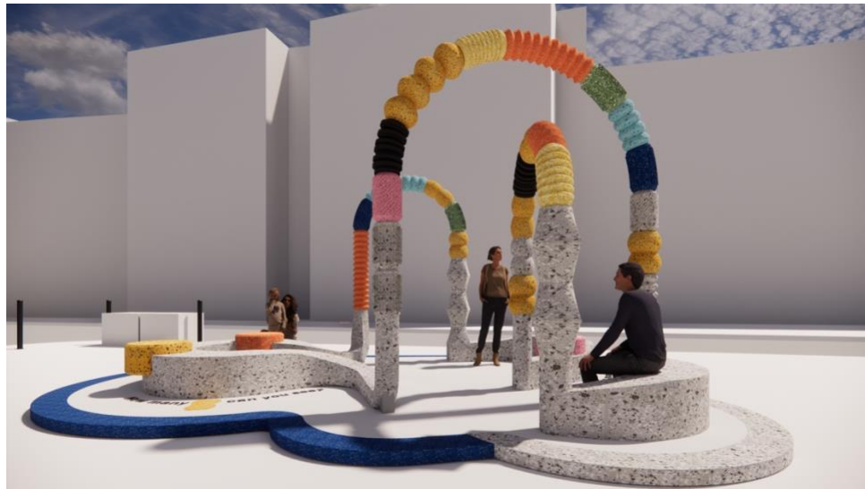
The Fountain of Technicolour Beads by One Bite Design (above)