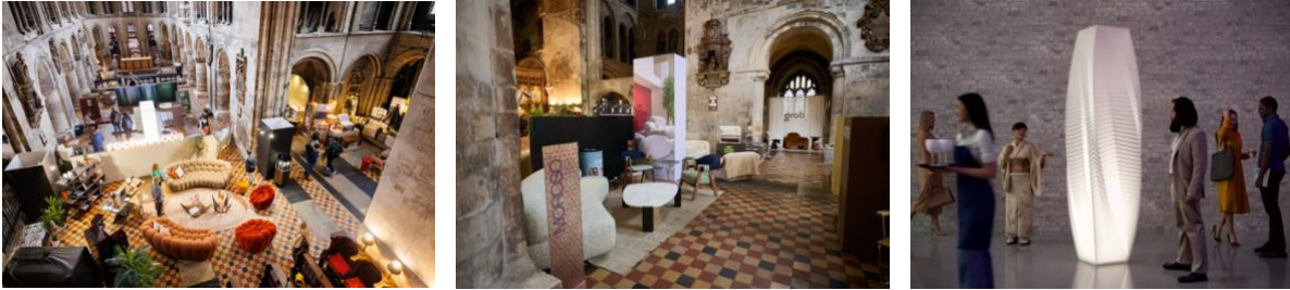
Church of Design at St Bartholomew the Great (left and centre); Loom Light (right)

The House of Detention returns as the host of Light , showcasing a selection of exciting local and global lighting brands. Visitors will be greeted at the entrance with Loom Light , a 3D-printed light sculpture drawing on the optical language of Op Art, designed by MIMStudios, AI Build and SEAM Design. [d]arc thoughts , an enlightening series of talks curated by [d]arc media, also returns.