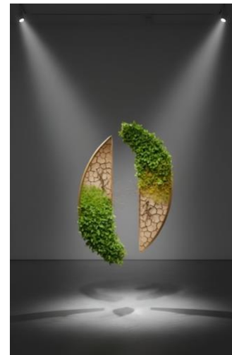
The Luxury Edit located at Haberdasher's Hall (left). The Pulse of Becoming Design Intervention (right) will be installed outside the venue.