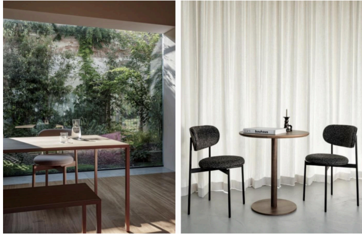
Slim | Enso by Arco