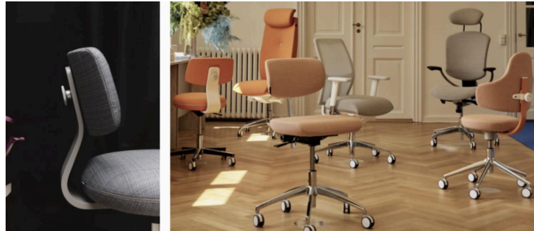
Savo 360 | Savo range