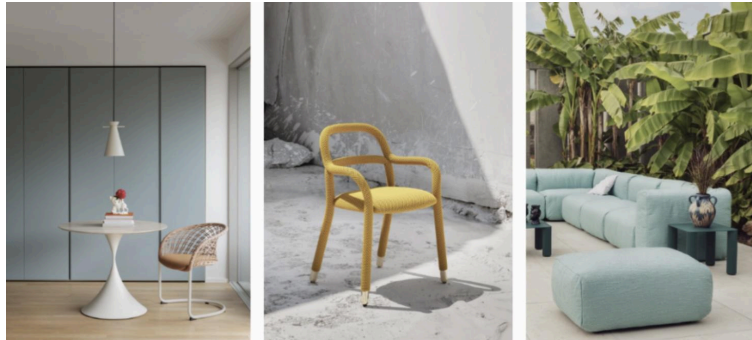
P47 | Pippi | Yak by Midj