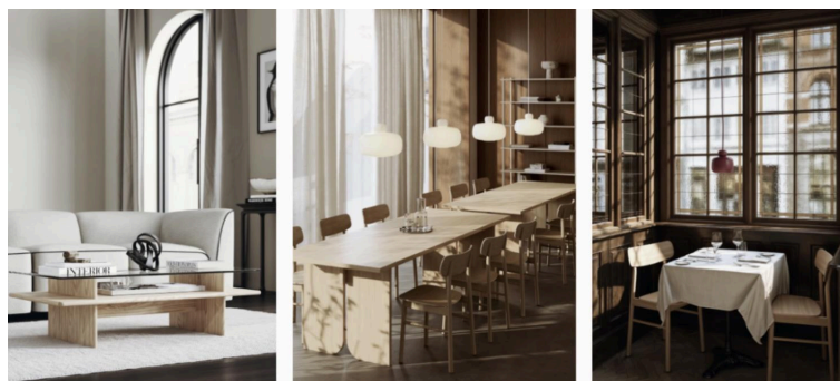
Flora, Kimino and Soma by Woud