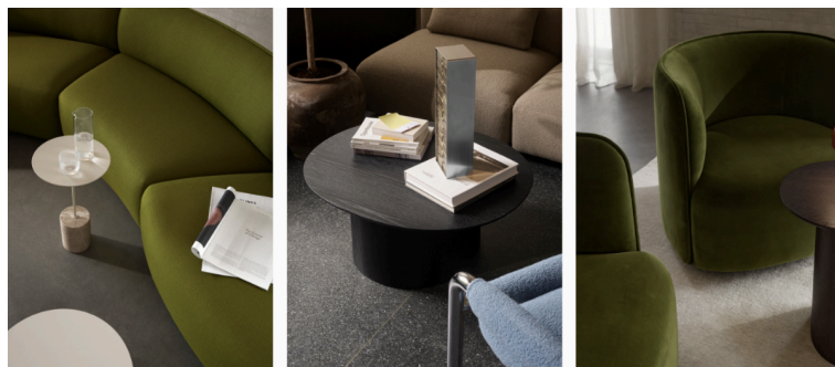
Panorama Sofa | Kin Table | Panorama Lounge Chair by Wendlebo