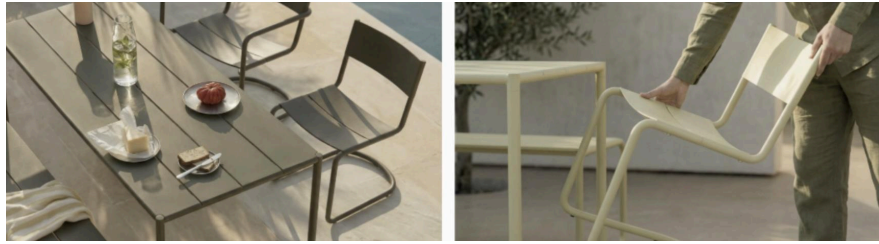
SINE by NINE