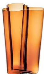
Aalto vase 251mm, copper