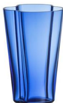
Aalto vase 220mm, ultramarine blue