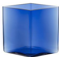
Ruutu vase 205x180mm, ultramarine blue