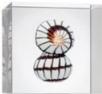
Annual cube 2022, 85x80 mm, copper/white (DTC only, limited edition available in 2022)