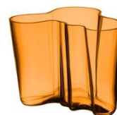
Aalto vase 160mm, copper