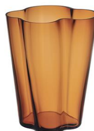
Aalto vase 270mm, copper