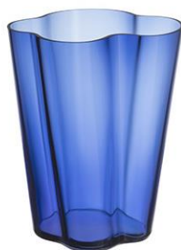
Aalto vase 270mm, ultramarine blue