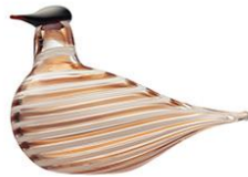
Birds by Toikka annual bird 2022 Crake, 145x115mm, copper/white (limited edition available in 2022)