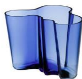
Aalto vase 160mm, ultramarine blue