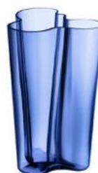
Aalto vase 251mm, ultramarine blue