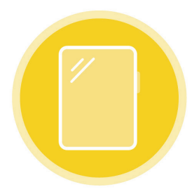
108,000 vehicle tests on digital app