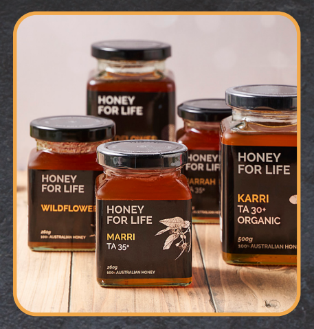
The Honey Colony Honey for Life Booth No: F16