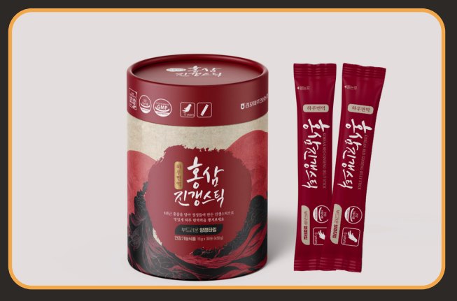
Gyeonggi Government Trade Corporation Daily Immunity Red Ginseng Jelly Sticks

Curtice Brothers Tomato Ketchup Booth No: G23