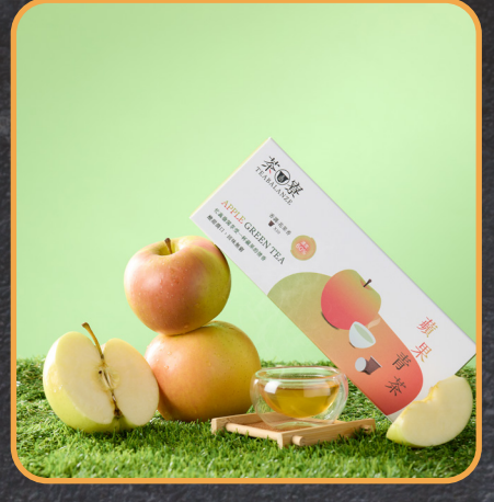
Teabalanze Limited Apple Green Tea