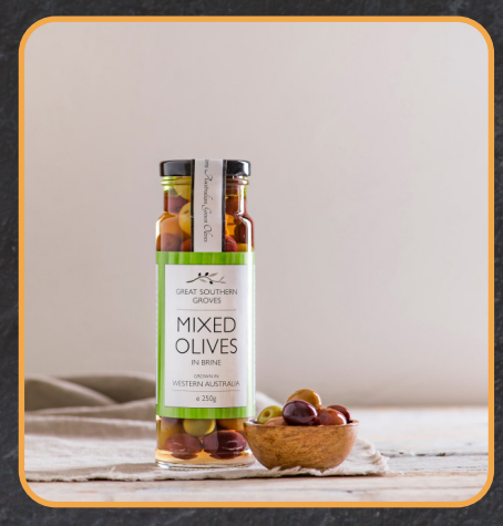
SME Connect Australasia Pte Ltd