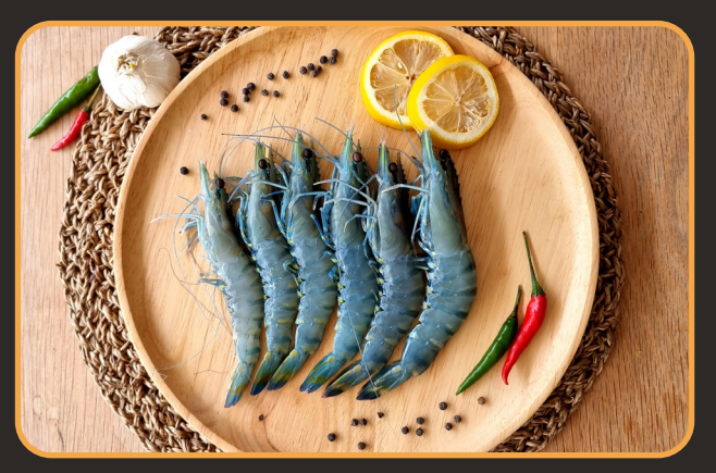
Blue Aqua International Blue Tiger Shrimps Booth No: M15