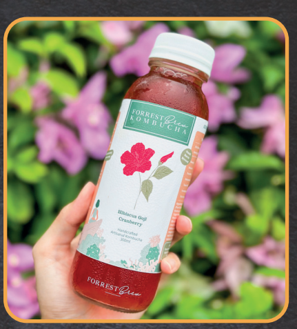
Zeng He Pte Ltd Hibiscus Goji Cranberry Booth No: L14