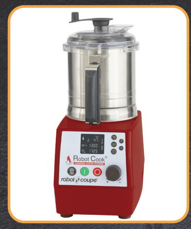
Lau Choy Seng Pte Ltd The Robot Cook® Booth No: G15