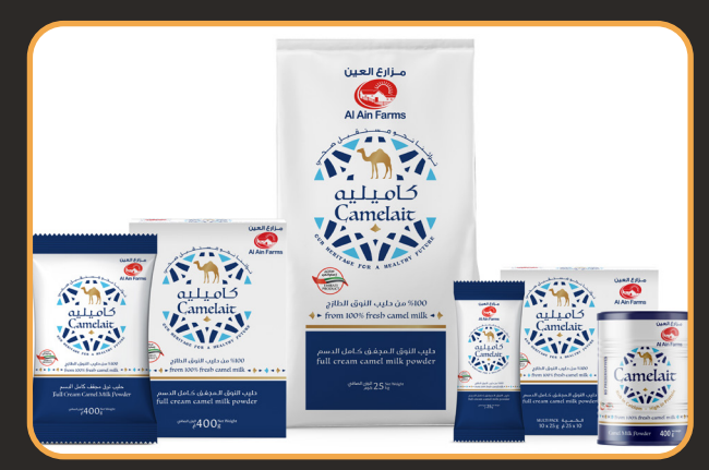
Al Ain Farms Camelait Full Cream Camel Milk Powder Booth No: E31