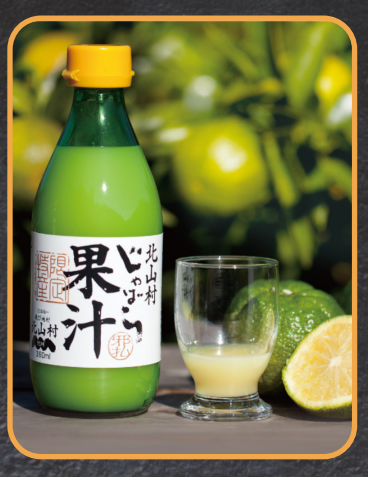
Yoruzuya Trading Jabara 100% Juice