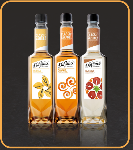
Kerry Ingredients Sdn Bhd DaVinci Gourmet Classic Syrups Booth No: F24