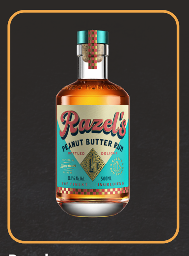
Perola Rezel Peanut Butter Rum