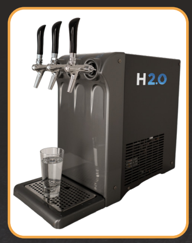
CSG (Far East) Pte Ltd Crystal Water Dispenser Booth No: K26