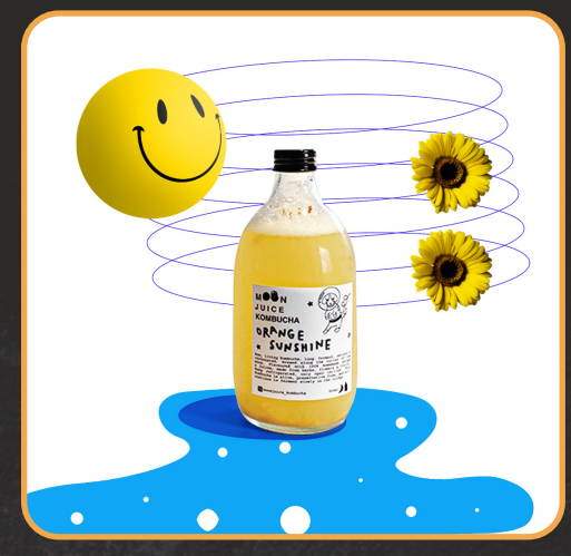
Moon Juice Pte Ltd Orange Sunshine Kombucha