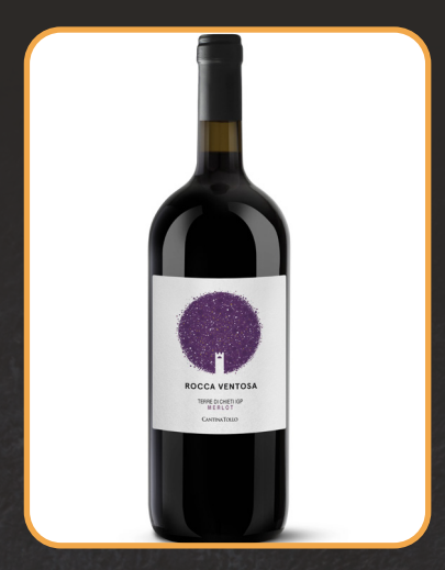
Intervino Singapore Rocca Ventosa Merlot