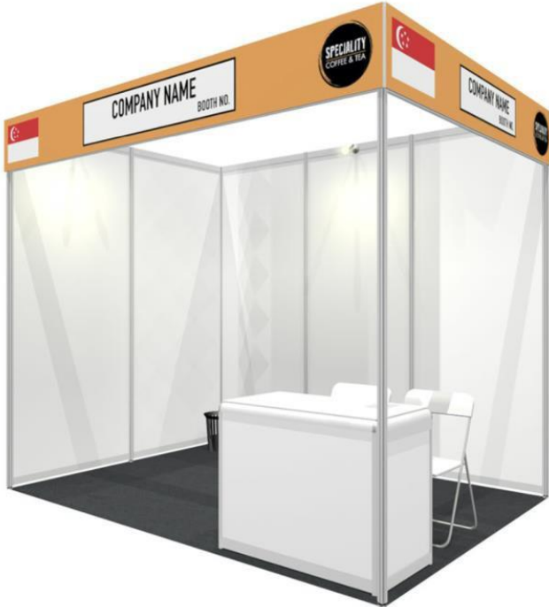
6sqm stand, 2 open sides