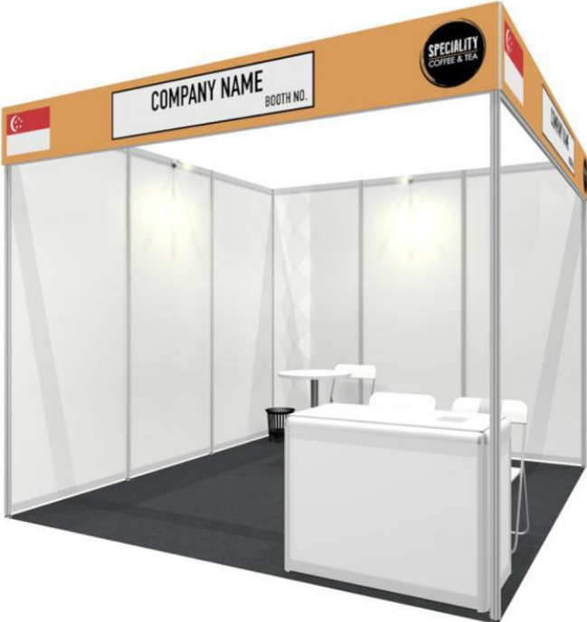
9sqm stand, 2 open sides

*Please note this visual is for guidance only – your stand dimensions and open sides may be different*