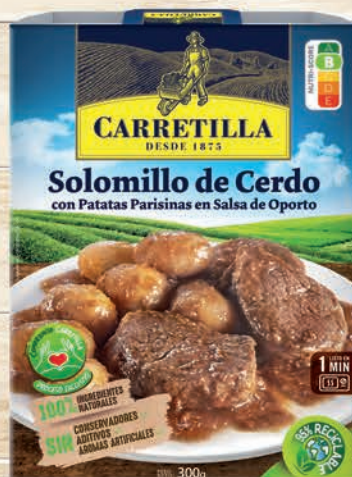
PORK TENDERLOIN WITH PARISIAN POTATOES IN PORT SAUCE 8410416013235 (N.W. 300 gr.)