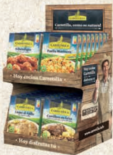
MINI-DISPLAY TRAYS (Capacity 32 trays)