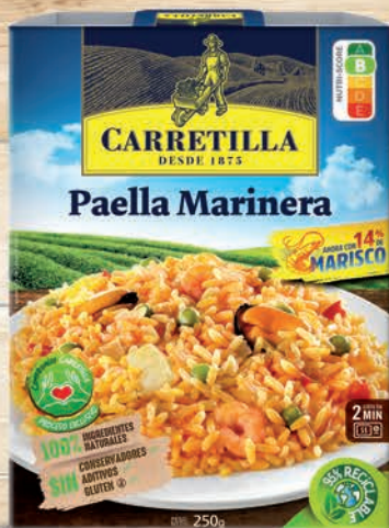
FISH AND SEAFOOD PAELLA 8410416005063 (N.W. 250 gr.)