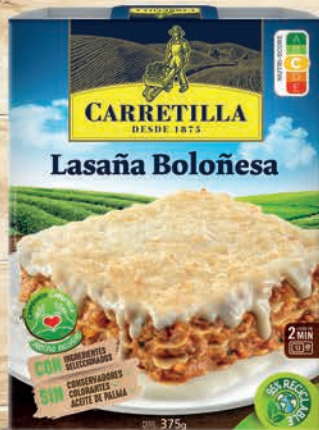
LASAGNA BOLOGNESE 8410416006091 (N.W. 375 gr.)