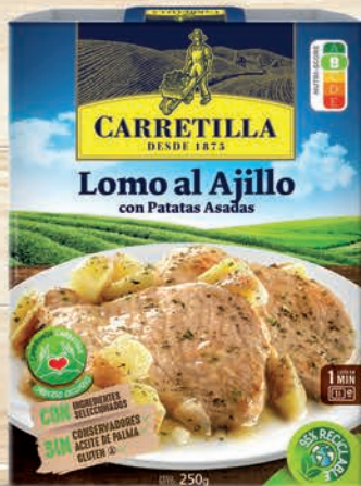
PORK LOIN WITH BAKED POTATOES IN GARLIC SAUCE 8410416008385 (N.W. 250 gr.)