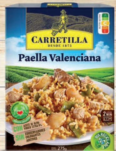
VALENCIAN PAELLA 8410416012764 (N.W. 275 gr.)