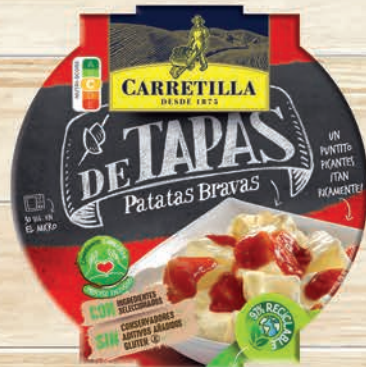
"BRAVAS" SPICY POTATOES 8410416012160 (N.W. 280 gr.)