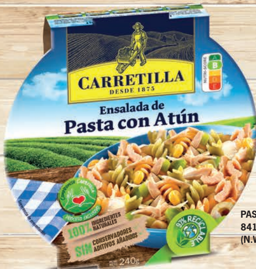
PASTA SALAD WITH TUNA 8410416001799 (N.W. 240 gr.)