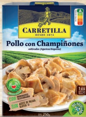
CHICKEN WITH MUSHROOMS 8410416005773 (N.W. 250 gr.)