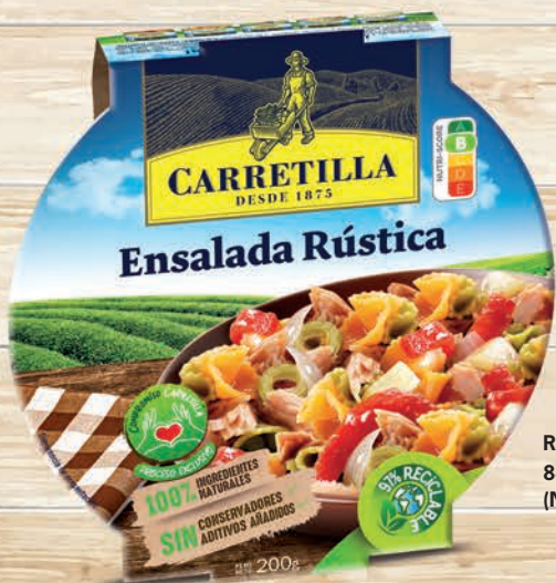
RUSTIC SALAD 8410416003243 (N.W. 200 gr.)