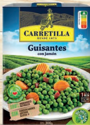
PEAS WITH HAM 8410416003595 (N.W. 300 gr.)