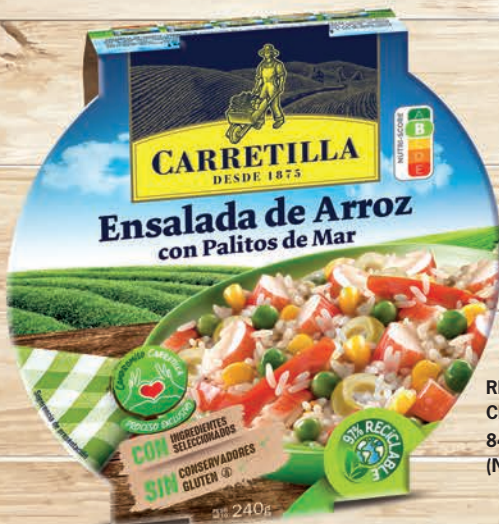
RICE SALAD WITH CRABMEAT STICKS 8410416001812 (N.W. 240 gr.)