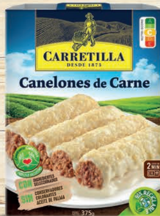
CANNELLONI STUFFED WITH MEAT 8410416006114 (N.W. 375 gr.)