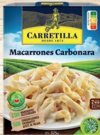
MACARONI CARBONARA 8410416006138 (N.W. 325 gr.)