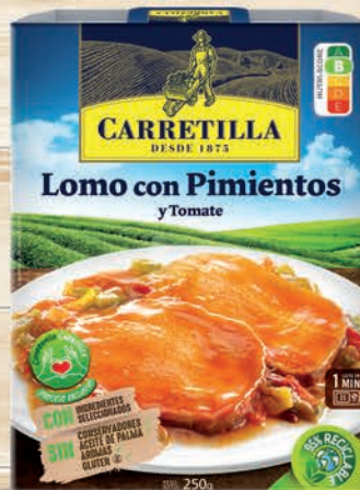
PORK LOIN WITH PEPPERS IN TOMATO SAUCE 8410416006862 (N.W. 250 gr.)