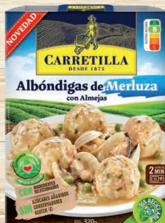
HAKE MEATBALLS WITH CLAMS 8410416014546 (N.W. 320 gr.)