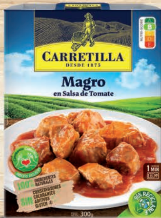
LEAN PORK IN TOMATE SAUCE 8410416012122 (N.W. 300 gr.)