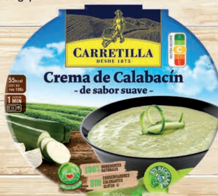
ZUCCHINI CREAM 8410416008316 (N.W. 350 gr.)