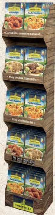
FREE-STANDING DISPLAY (50 trays or 30 bowls) *