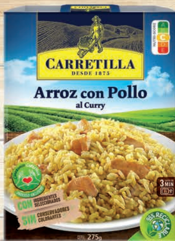
RICE WITH CURRY SAUCE AND CHICKEN 8410416008361 (N.W. 275 gr.)