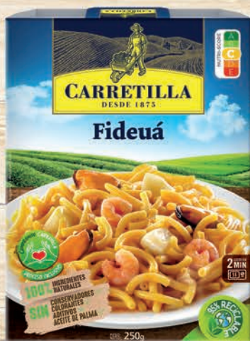
FIDEUÁ (NOODLE DISH) 8410416005087 (N.W. 250 gr.)