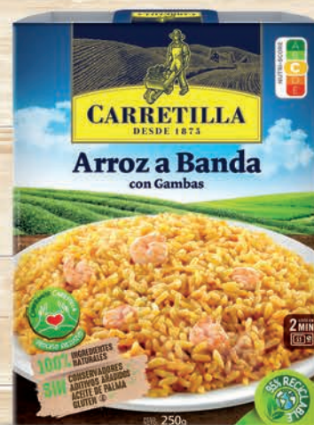
"A BANDA" RICE WITH SHRIMPS 8410416008354 (N.W. 250 gr.)