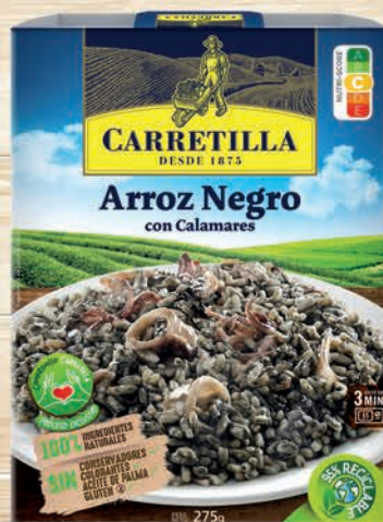
BLACK RICE 8410416008347 (N.W. 275 gr.)