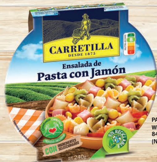
PASTA SALAD WITH HAM 8410416001805 (N.W. 240 gr.)