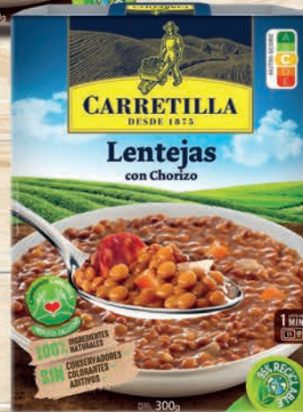
LENTILS WITH "CHORIZO" 8410416002420 (N.W. 300 gr.)