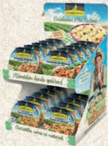
MINI-DISPLAY PIC-NIC SALADS (Capacity 24 bowls)