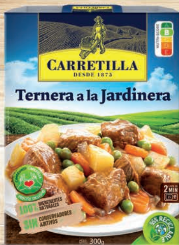
BEEF STEW WITH VEGETABLES 8410416006879 (N.W. 300 gr.)