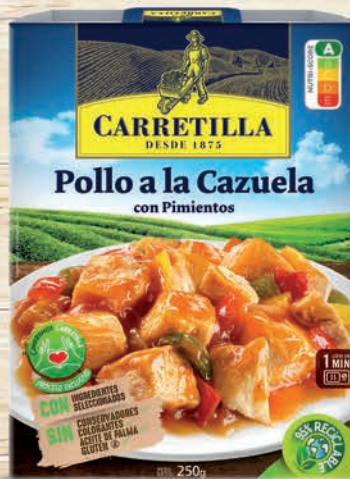
CHICKEN STEW WITH PEPPERS 8410416005766 (N.W. 250 gr.)