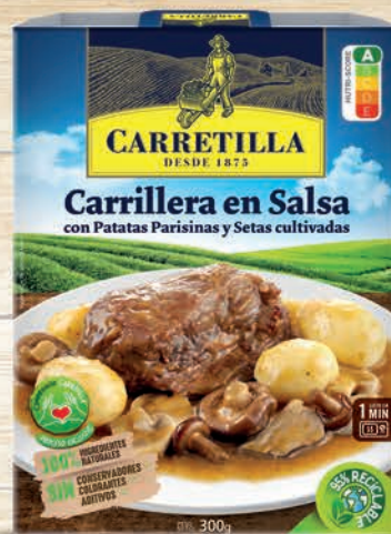
CHEEKS IN SAUCE WITH PARISIAN POTATOES AND MUSHROOM 8410416012115 (N.W. 300 gr.)