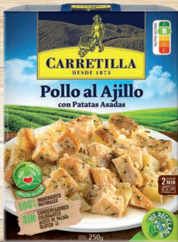
GARLIC CHICKEN WITH BAKED POTATOES 8410416005780 (N.W. 250 gr.)