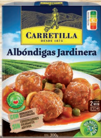
MEATBALLS WITH VEGETABLES 8410416007999 (N.W. 300 gr.)