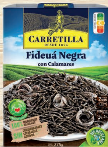
BLACK FIDEUÁ (NOODLE DISH) WITH SQUID 8410416014126 (N.W. 275 gr.)