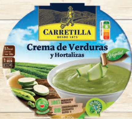
VEGETABLES CREAM 8410416008323 (N.W. 350 gr.)