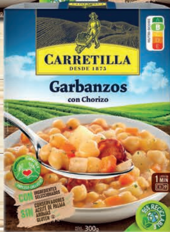
CHICKPEAS WITH "CHORIZO" 8410416002413 (N.W. 300 gr.)