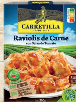
BEEF STUFFED RAVIOLI IN TOMATO SAUCE 8410416008828 (N.W. 300 gr.)