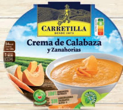
PUMPKIN AND CARROTS CREAM 8410416008330 (N.W. 350 gr.)