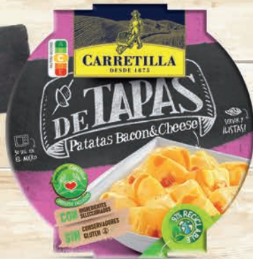
BACON&CHEESE POTATOES 8410416014560 (N.W. 250 gr.)