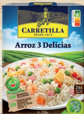
"3 DELICIAS" FRIED RICE 8410416005797 (N.W. 250gr.)