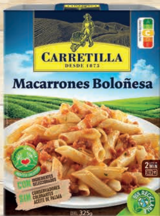
MACARONI BOLOGNESE 8410416006145 (N.W. 325 gr.)