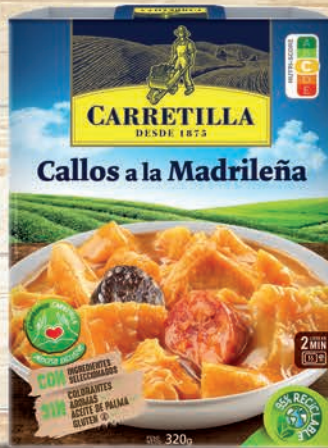
"CALLOS A LA MADRILEÑA" (Madrid Style Tripe) 8410416008804 (N.W. 320 gr.)