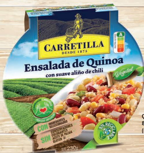
QUINOA SALAD 8410416008910 (N.W. 230 gr.)