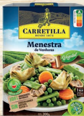
VEGETABLE STEW 8410416003588 (N.W. 300 gr.)