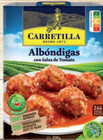
MEATBALLS IN TOMATO SAUCE 8410416006855 (N.W. 300 gr.)