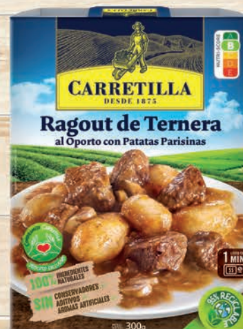
BEEF RAGOUT WITH PORT AND PARISIAN POTATOES 8410416013211 (N.W. 300 gr.)