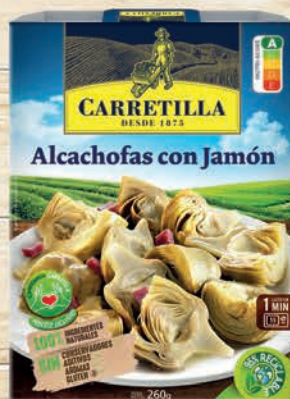
ARTICHOKES 8410416002130 (N.W. 260 gr.)