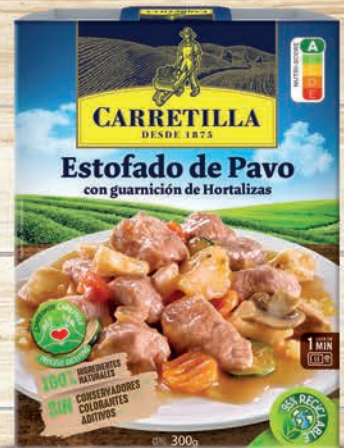
TURKEY STEW WITH VEGETABLE GARNISH 8410416012788 (N.W. 300 gr.)