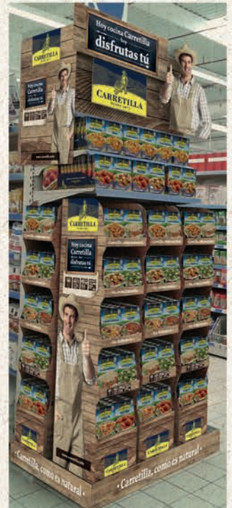
AISLE END CAP DISPLAY