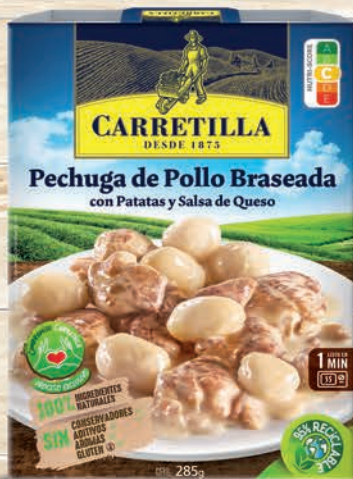
BRAISED CHICKEN BREAST WITH POTATOES AND CHEESE SAUCE 8410416013228 (N.W. 285 gr.)