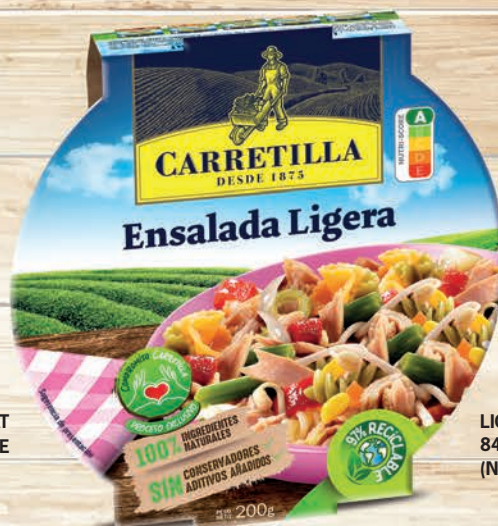
LIGHT SALAD 8410416003236 (N.W. 200 gr.)