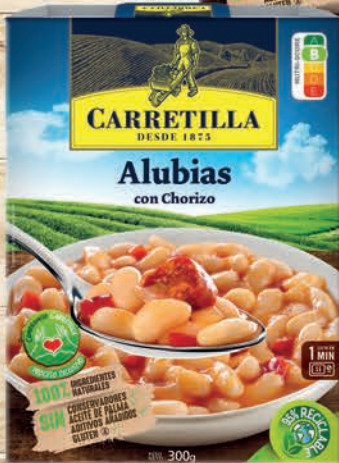
BEANS WITH "CHORIZO" 8410416002406 (N.W. 300 gr.)