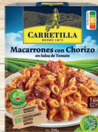
MACARONI WITH CHORIZO IN TOMATO SAUCE 8410416013204 (N.W. 300 gr.)