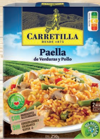
CHICKEN VEGETABLE PAELLA 8410416005070 (N.W. 250 gr.)