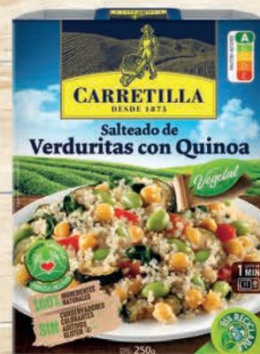
SAUTÉED VEGETABLES WITH QUINOA 8410416012221 (N.W. 250 gr.)