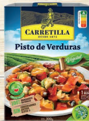
VEGETABLE RATATOUILLE 8410416003250 (N.W. 300 gr.)