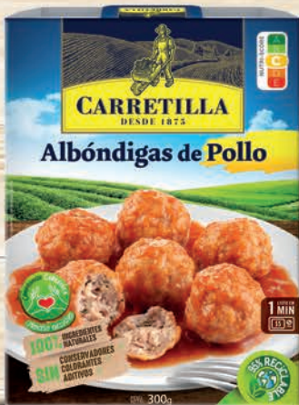
CHICKEN MEATBALLS IN TOMATO SAUCE 8410416012054 (N.W. 300 gr.)