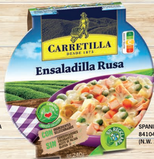
SPANISH POTATO SALAD 8410416004400 (N.W. 240 gr.)