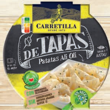
"ALI-OLI" POTATOES 8410416012177 (N.W. 280 gr.)