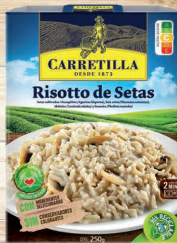
FUNGHI RISOTTO 8410416007272 (N.W. 250 gr.)