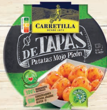
"MOJO PICÓN" POTATOES 8410416014119 (N.W. 250 gr.)