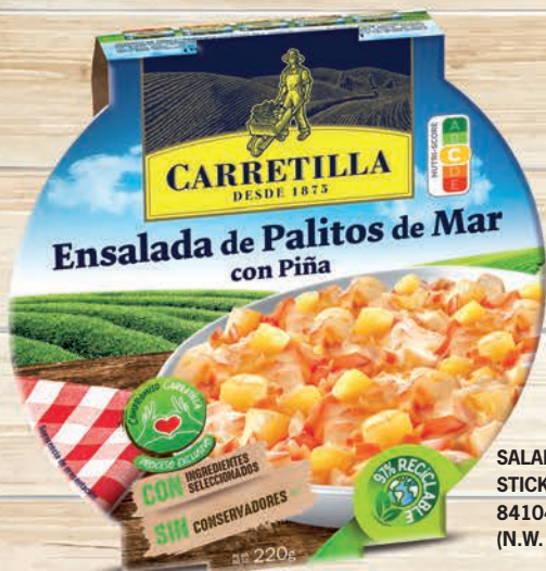
SALAD WITH CRABMEAT STICKS AND PINEAPPLE 8410416004417 (N.W. 220 gr.)