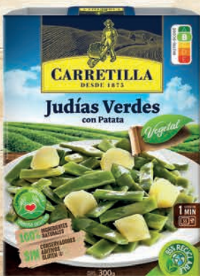
GREEN BEANS WITH POTATO 8410416003571 (N.W. 300 gr.)