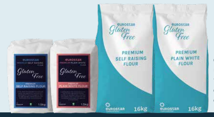
Gluten free flours created using a mix of premium functional ingredients that offers higher quality bakes, cakes and breads.

Available in 1.5kg & cases of 8x1.5kg and 16kg bags