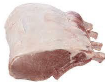
LOIN BONE IN