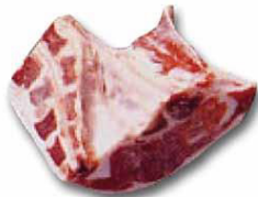
BONE IN CHUMP