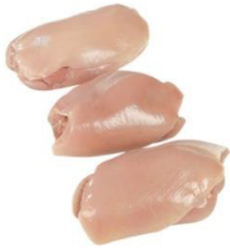
THIGH MEAT S/LESS B/LESS