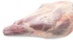
ABO CHUMP OFF