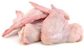
MID & TIP WINGS