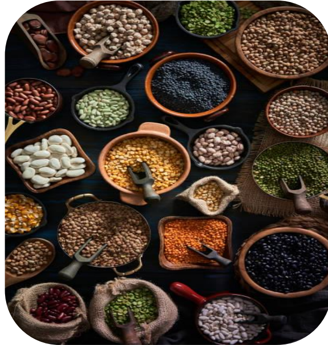
Pulses & Corns