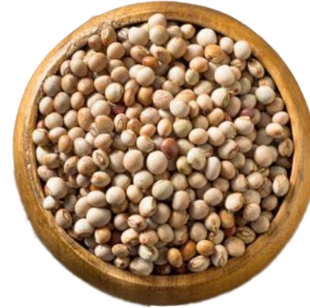
Dry Pigeon Peas