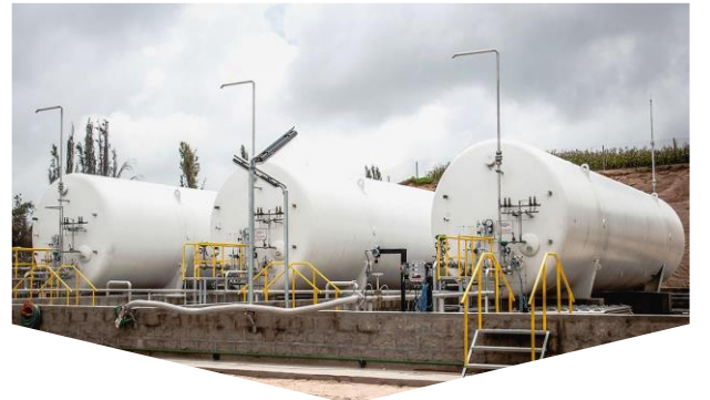
Natural Gas (NGV)

100% of the energy used at the factory is supplied by 2 renewable sources.