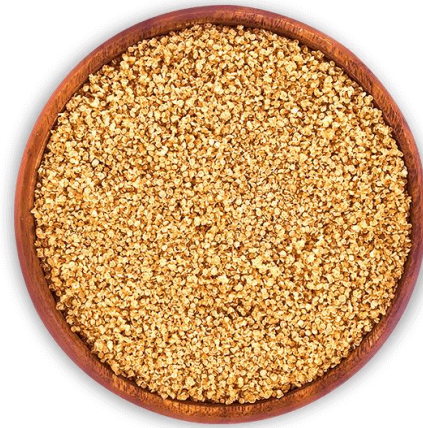
Pre – Cooked Quinoa