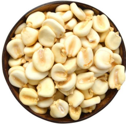
Giant Cusco Corn