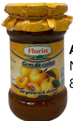
Apricot Net Weight: 360 gr 8 Pcs / Box