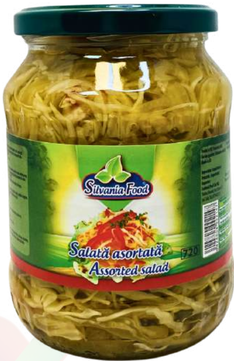
Assorted Salad Net Weight: 680 gr 8 Pcs / Box