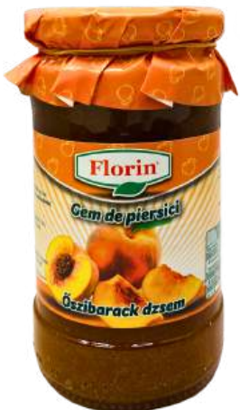
Peach Net Weight: 360 gr 8 Pcs / Box