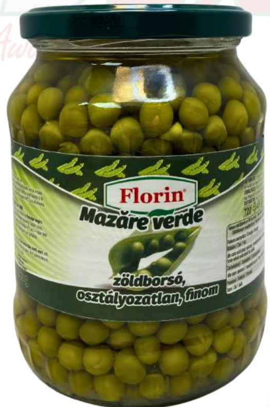
Green Peas Net Weight: 690 gr 8 Pcs / Box