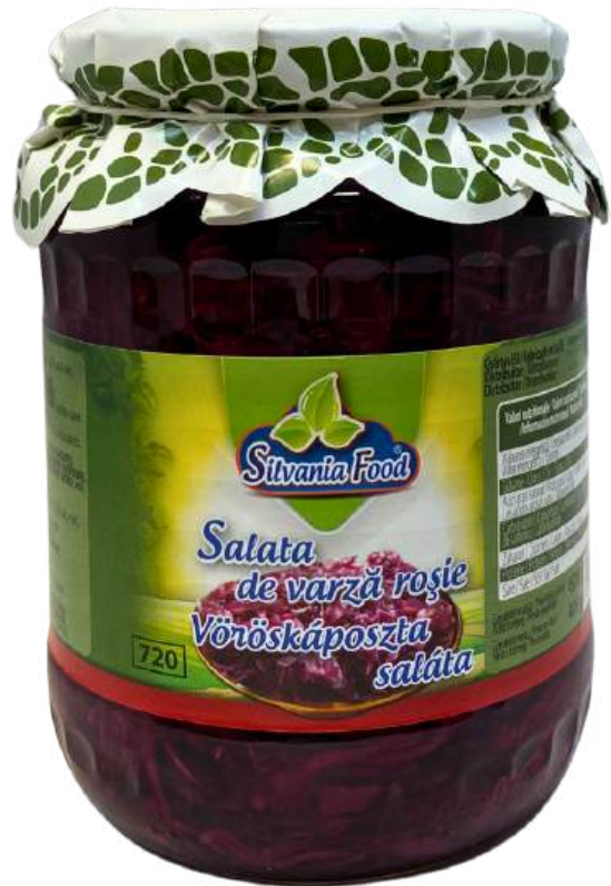
Red Cabbage Salad Net Weight: 680 gr 8 Pcs / Box