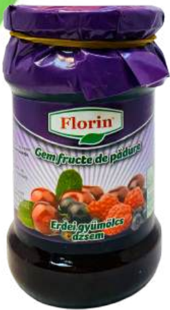
Forrest Fruits Net Weight: 360 gr 8 Pcs / Box