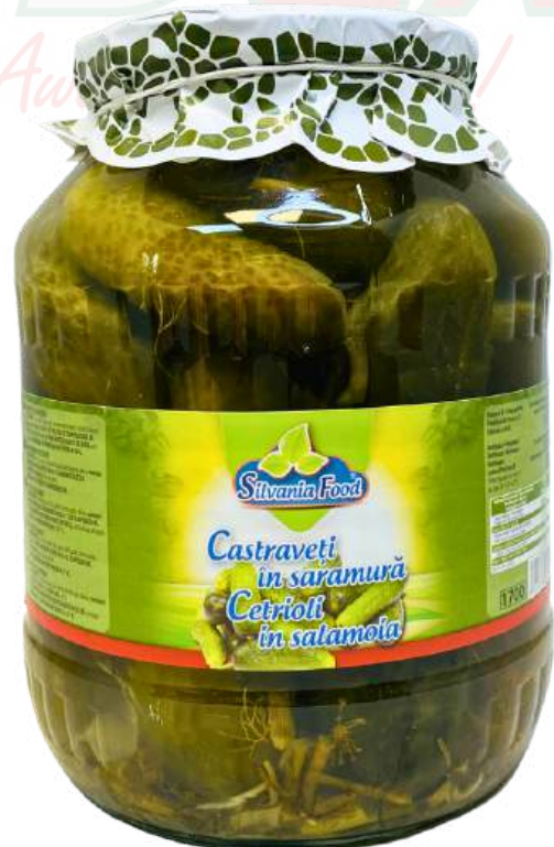
Cucumbers in Brine Net Weight: 1590 gr 6 Pcs / Box