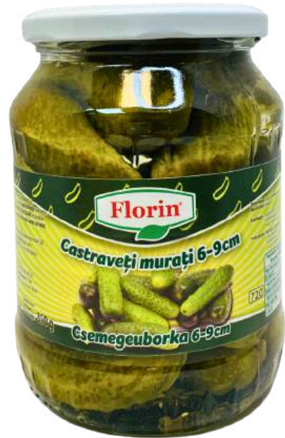
Cucumbers 6-9 cm Net Weight: 720 ml 8 Pcs / Box