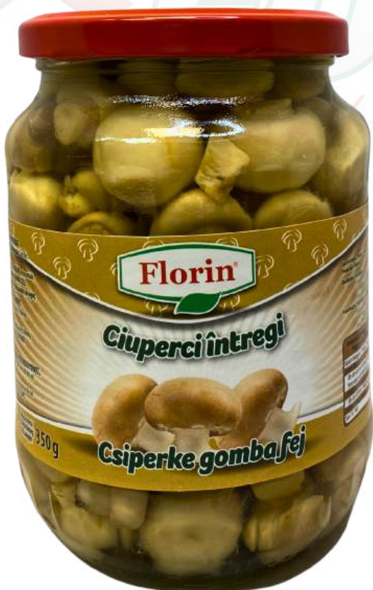
Whole Mushrooms Net Weight: 720 gr 8 Pcs / Box