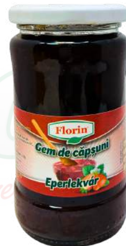
Strawberry Net Weight: 360 gr 8 Pcs / Box