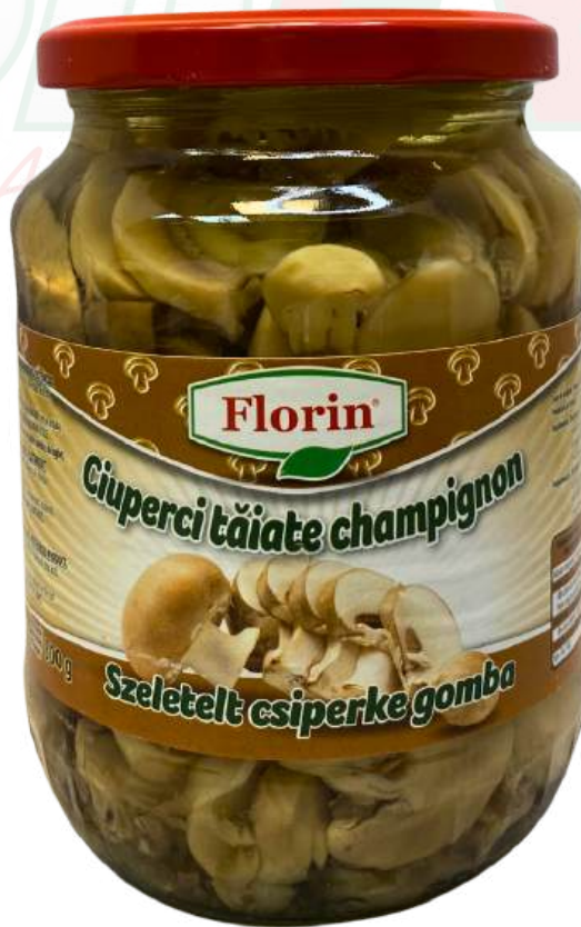
Sliced Mushrooms Net Weight: 720 gr 8 Pcs / Box