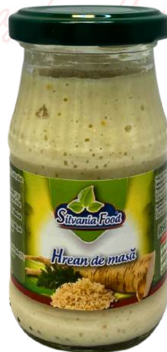
Grated Horseradish Net Weight: 180 gr 10 Pcs / Box