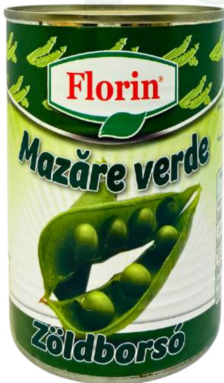
Canned Green Peas Net Weight: 420 gr 12 Pcs / Box