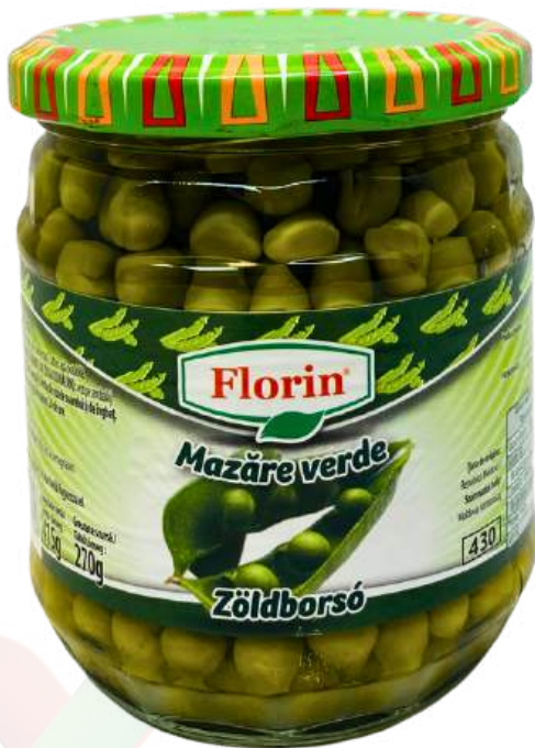
Green Peas Net Weight: 415 gr 12 Pcs / Box