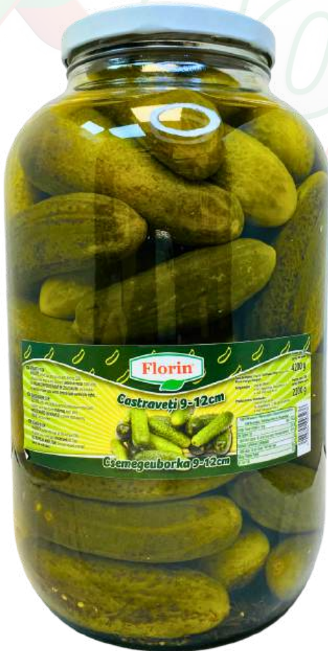
Cucumbers 9-12 cm Net Weight: 4250 ml 2 Pcs / Box