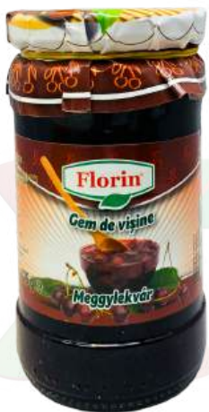
Sour Cherry Net Weight: 360 gr 8 Pcs / Box