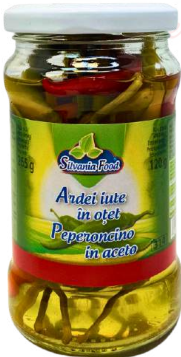
Hot Peppers Net Weight: 265 gr 12 Pcs / Box