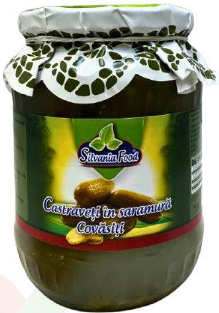
Cucumbers in Brine Net Weight: 670 gr 8 Pcs / Box