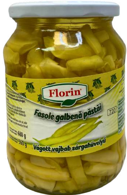
Yellow Beans Net Weight: 660 gr 8 Pcs / Box