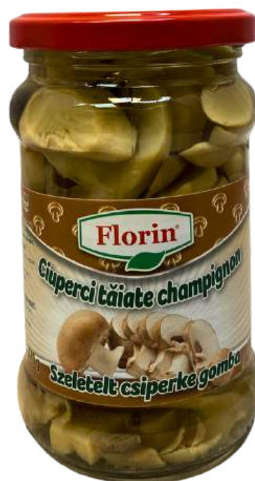
Sliced Mushrooms Net Weight: 315 gr 10 Pcs / Box