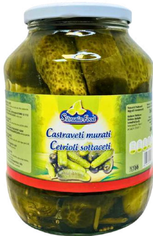
Cucumbers in Vinegar Net Weight: 1640 gr 6 Pcs / Box