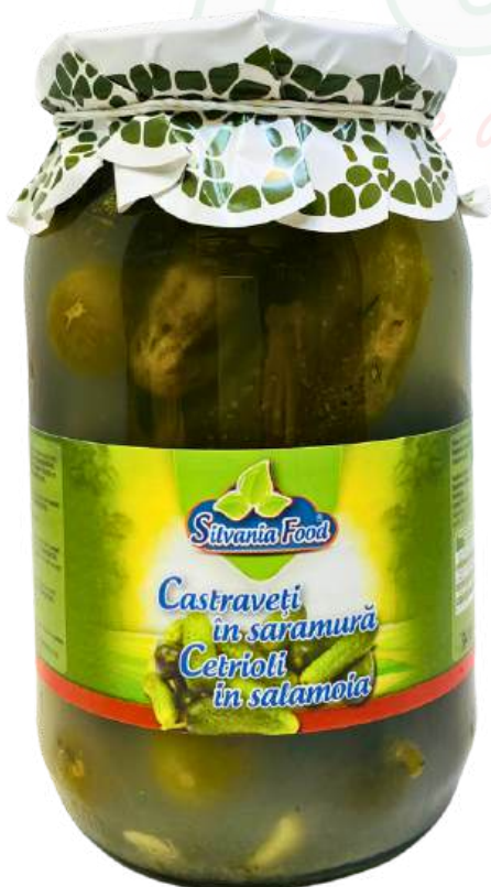
Cucumbers in Brine Net Weight: 800 gr 8 Pcs / Box