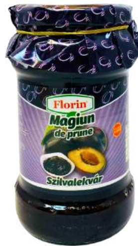
Plum Butter Net Weight: 360 gr 8 Pcs / Box