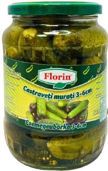
Cucumbers 3-6 cm Net Weight: 720 ml 8 Pcs / Box