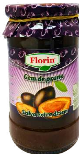
Plum Jam Net Weight: 360 gr 8 Pcs / Box