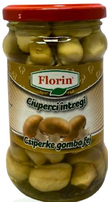
Whole Mushrooms Net Weight: 315 gr 10 Pcs / Box