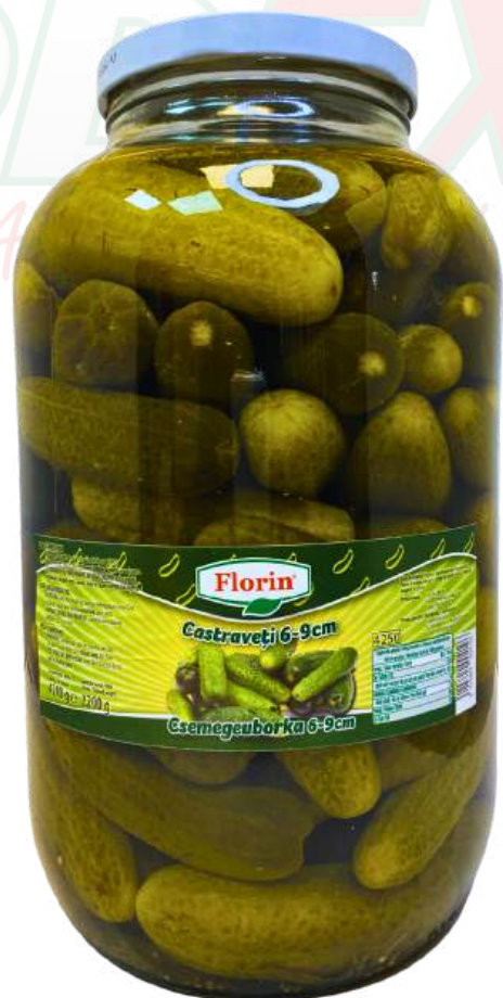
Cucumbers 6-9 cm Net Weight: 4250 ml 2 Pcs / Box