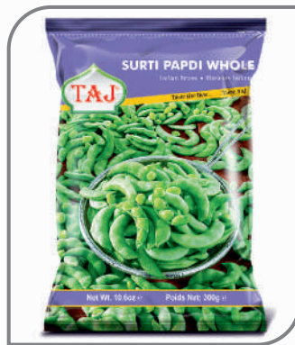
Surti Papdi 300 g