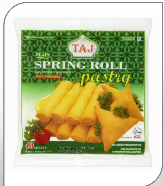
Spring Roll Pastry (8")