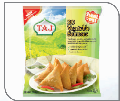
Vegetable Samosa 20 Pieces / 50 Pieces