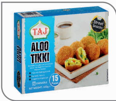
Aloo Tikki 600 g / 15 Pieces