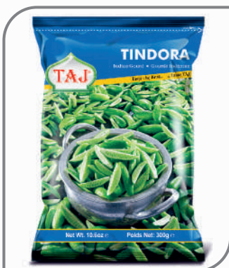
Tindora 300 g / 1 kg