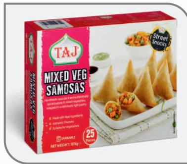
Mixed Veg Samosas 875 g / 25 Pieces