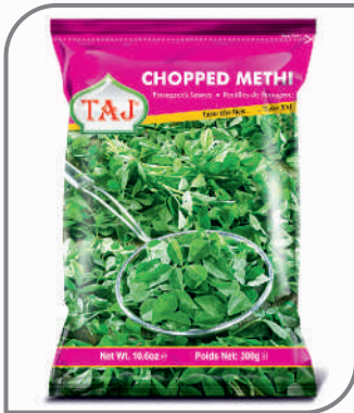
Chopped Methi 300 g