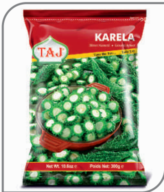
Karela 300 g / 1 kg