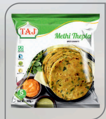
Methi Thepla 300g / 5 Pieces