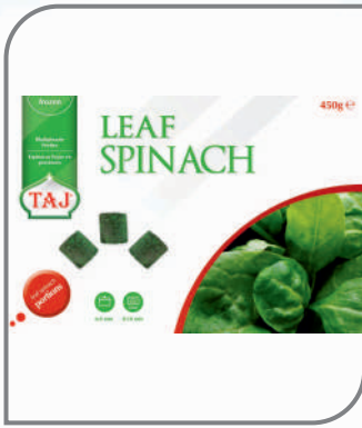
Leaf Spinach 450 g