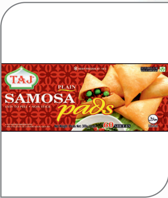
Samosa Pads (60 Sheets)