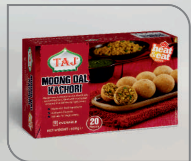
Moongdal Kachori 600 g / 20 Pieces