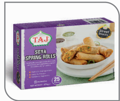
Soya Spring Rolls 875 g / 25 Pieces