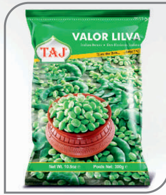
Valor Lilva 300 g