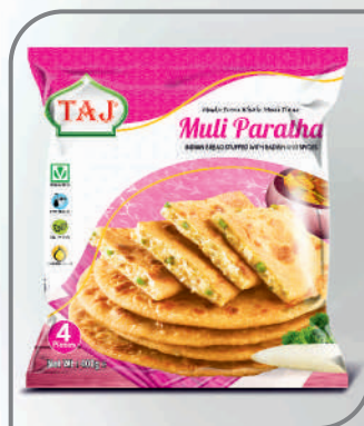
Muli Paratha 400g / 4 Pieces