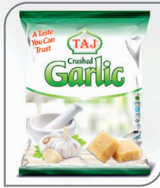
Crushed Garlic 400 g