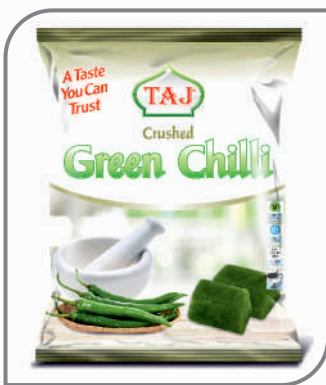
Crushed Green Chilli 400 g