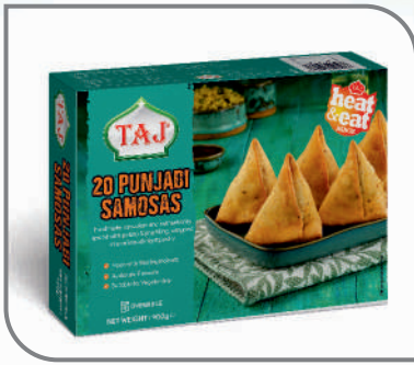
Vegetable Punjabi Samosas 900 g / 20 Pieces