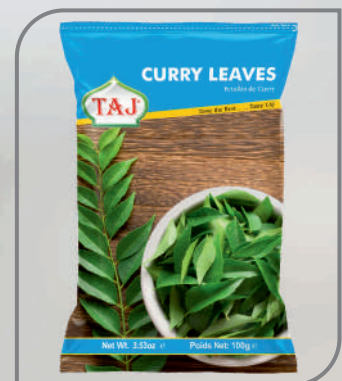
Curry Leaves 100 g