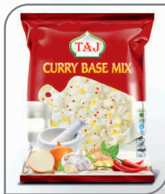
Curry Base Mix 400 g