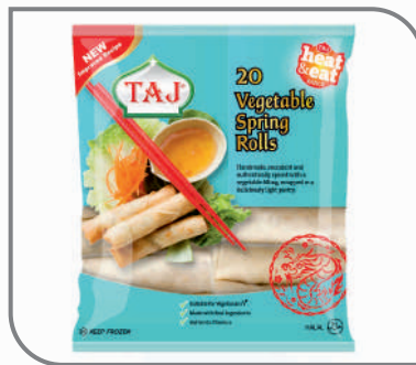
Vegetable Spring Rolls 20 Pieces / 50 Pieces