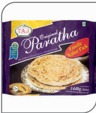
Family Pack Original Paratha 400g / 5 Pieces & 1440 g