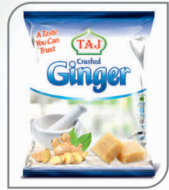
Crushed Ginger 400 g