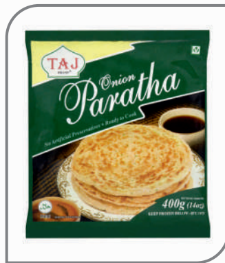
Onion Paratha 400g / 5 Pieces