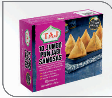
Jumbo Punjabi Samosas 750 g / 10 Pieces