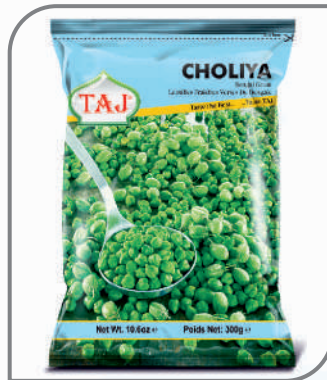
Choliya 300 g