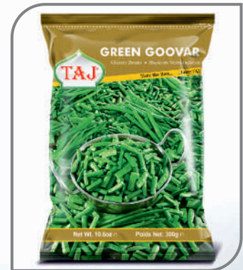
Green Goovar 300 g / 1 kg