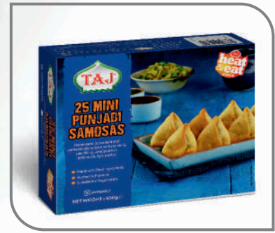
Mini Punjabi Samosas 500 g / 25 Pieces