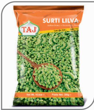
Surti Papdi Lilva 300 g