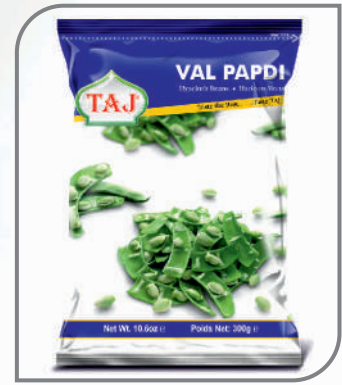
Val Papdi 300 g