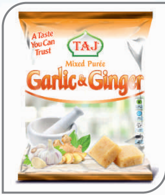
Crushed Garlic & Ginger Mix 400 g