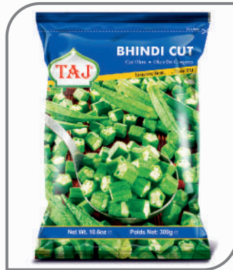
Cut Okra 300 g / 1 kg