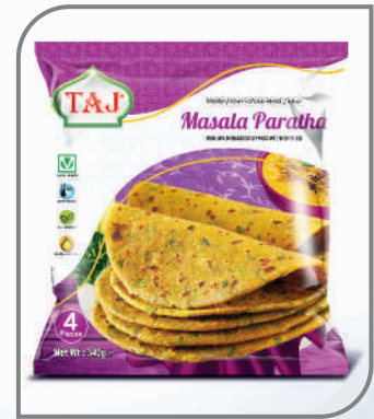
Masala Paratha 340g / 4 Pieces