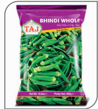
Whole Okra 300 g / 900 g