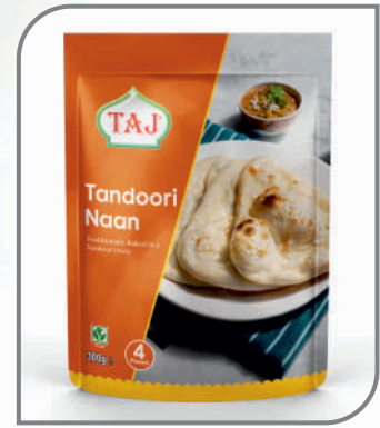
Tandoori Naan 300g / 4 Pieces