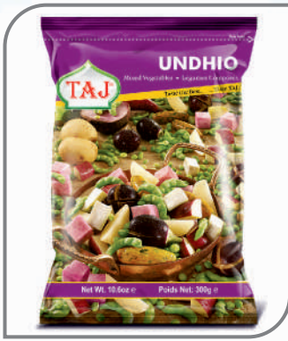
Undhio Mix 300 g