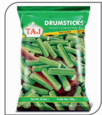
Drumstick 300 g