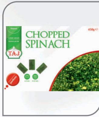
Chopped Spinach 450 g