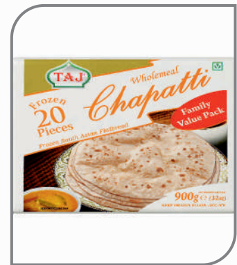
Family Pack Chapatti 900g / 20 Pieces