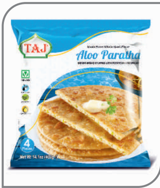
Aloo Paratha 400g / 4 Pieces