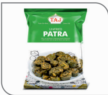
Unfried Patra / Patra Rolls 900 g