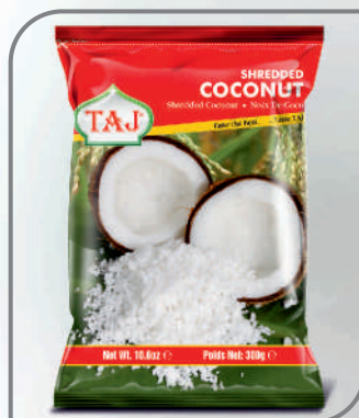
Shredded Coconut 300 g