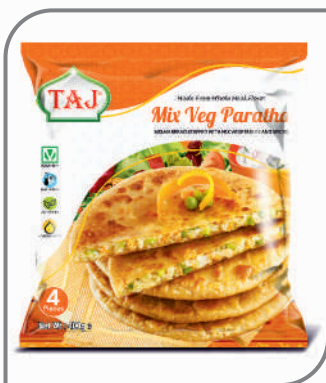
Mixed Veg Paratha 400g / 4 Pieces