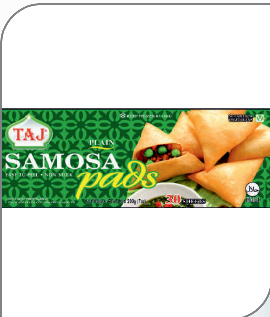
Samosa Pads (30 Sheets)