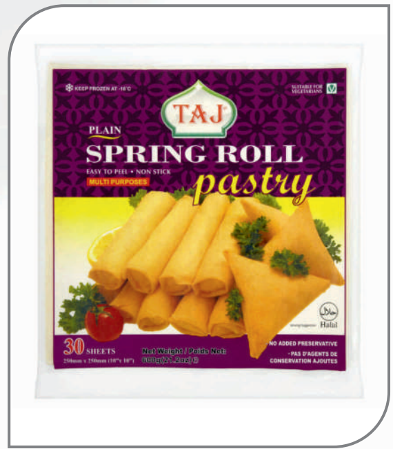
Spring Roll Pastry (10")