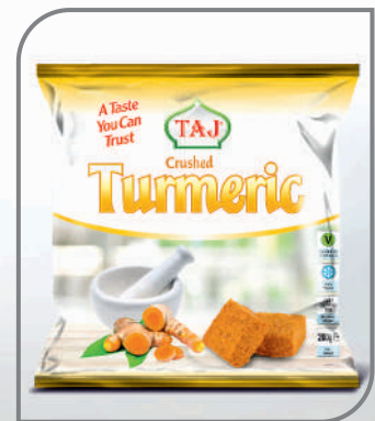
Crushed Turmeric 200 g