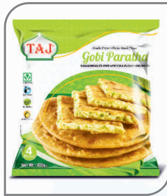
Gobi Paratha 400g / 4 Pieces