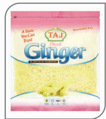
Diced Ginger 200 g