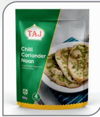
Chilli Coriander Naan 300g / 4 Pieces