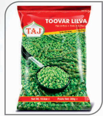
Toovar Lilva 300 g