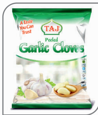
Garlic Cloves 400 g