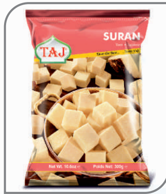
Suran 300 g