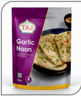
Garlic Naan 300g / 4 Pieces