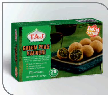
Green Peas Kachori 600 g / 20 Pieces