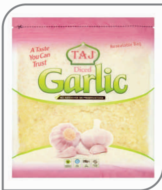
Diced Garlic 200 g