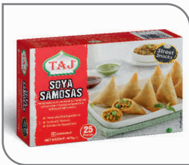
Soya Samosa 875 g / 25 Pieces