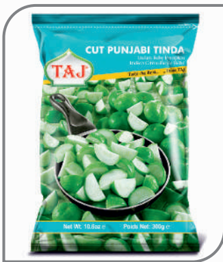
Punjabi Tinda 300 g