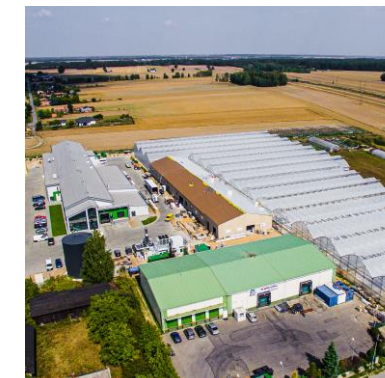
Nowalijka Convenience Food

The first Polish horticultural farm dealing with growth of lettuces and herbs in the hydroponic system.