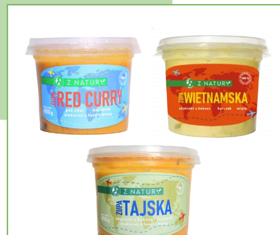
Flavours of the world