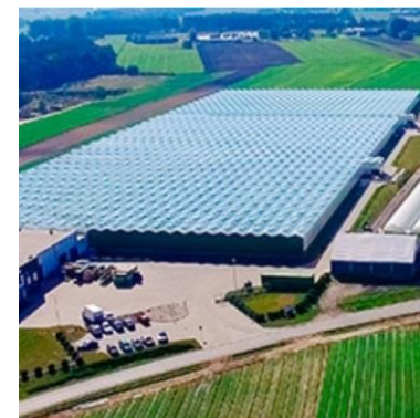
NOVITA Horticultural farm

The company's central headquarters with warehouse space and its own transport base.