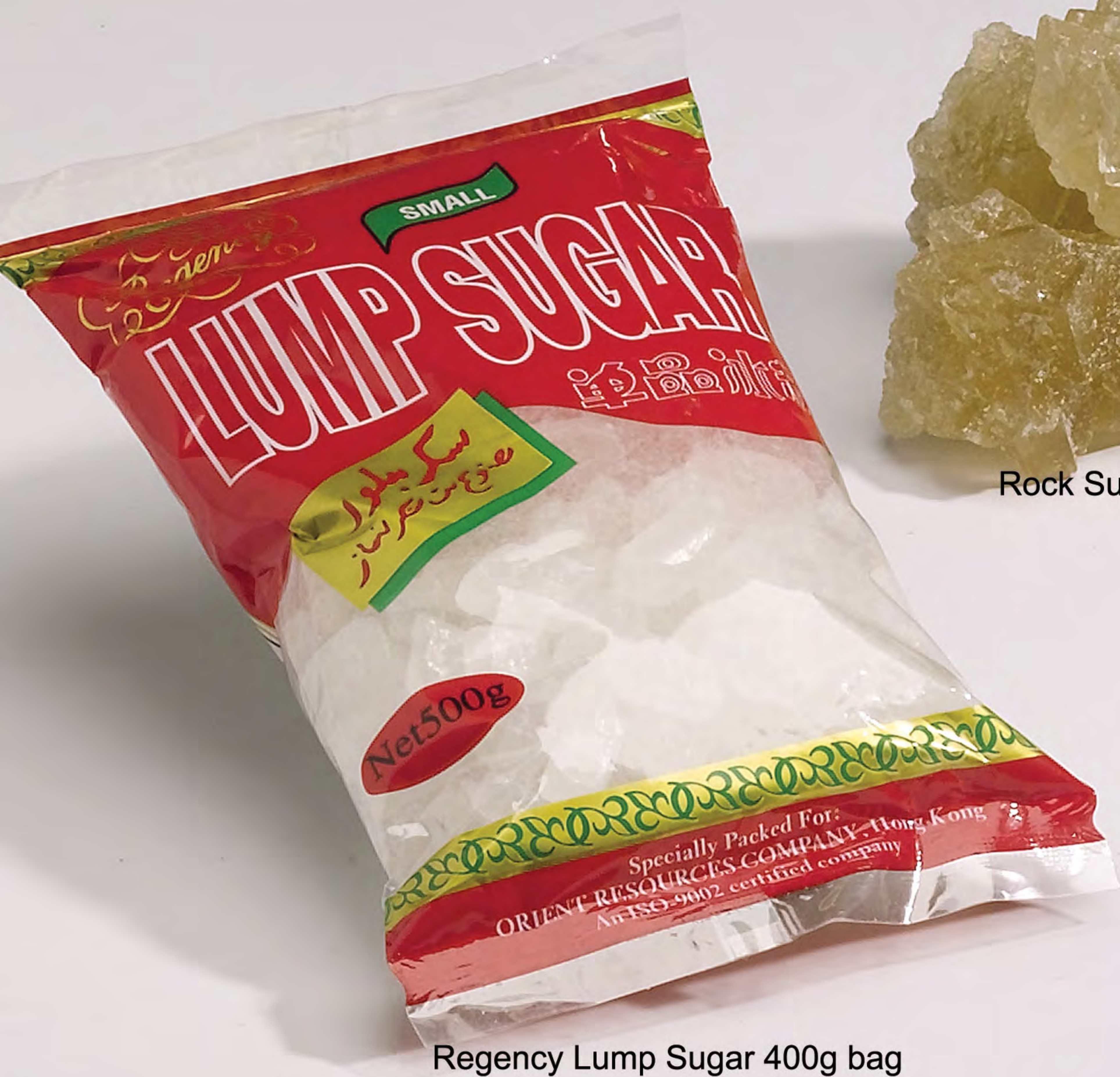
Regency Lump Sugar 400g bag