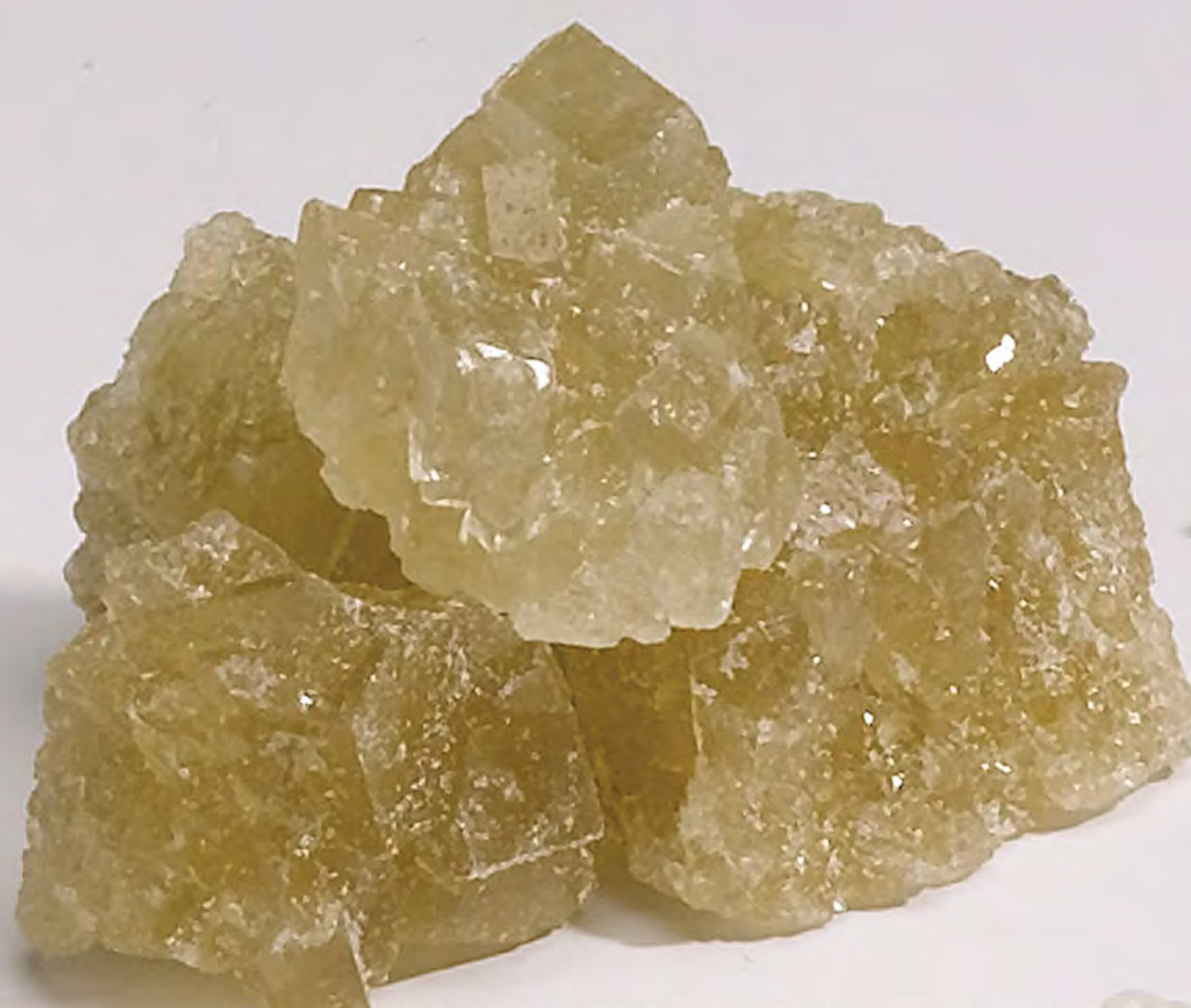
Rock Sugar (Yellow / Brown)