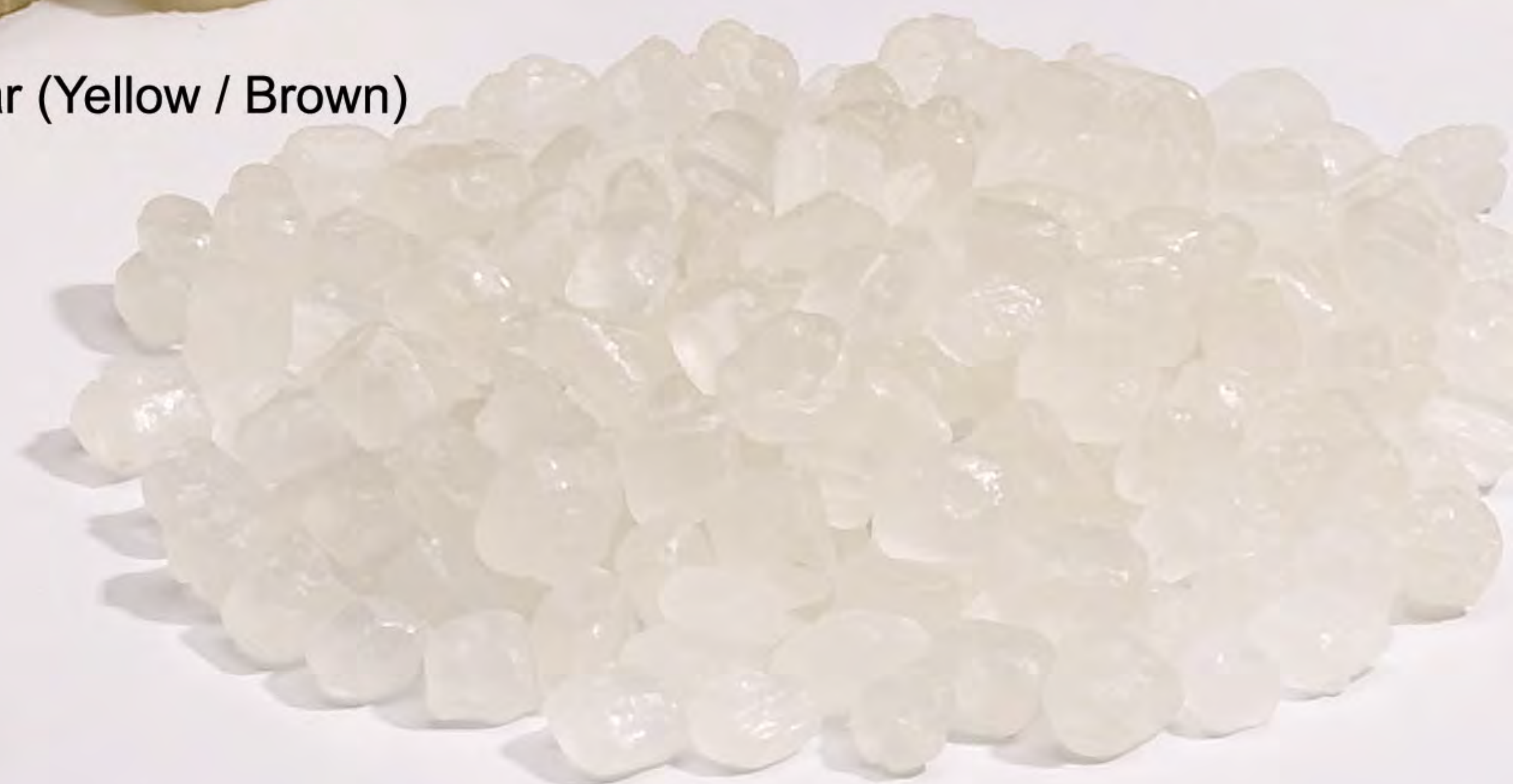
Lump Sugar White / Brown