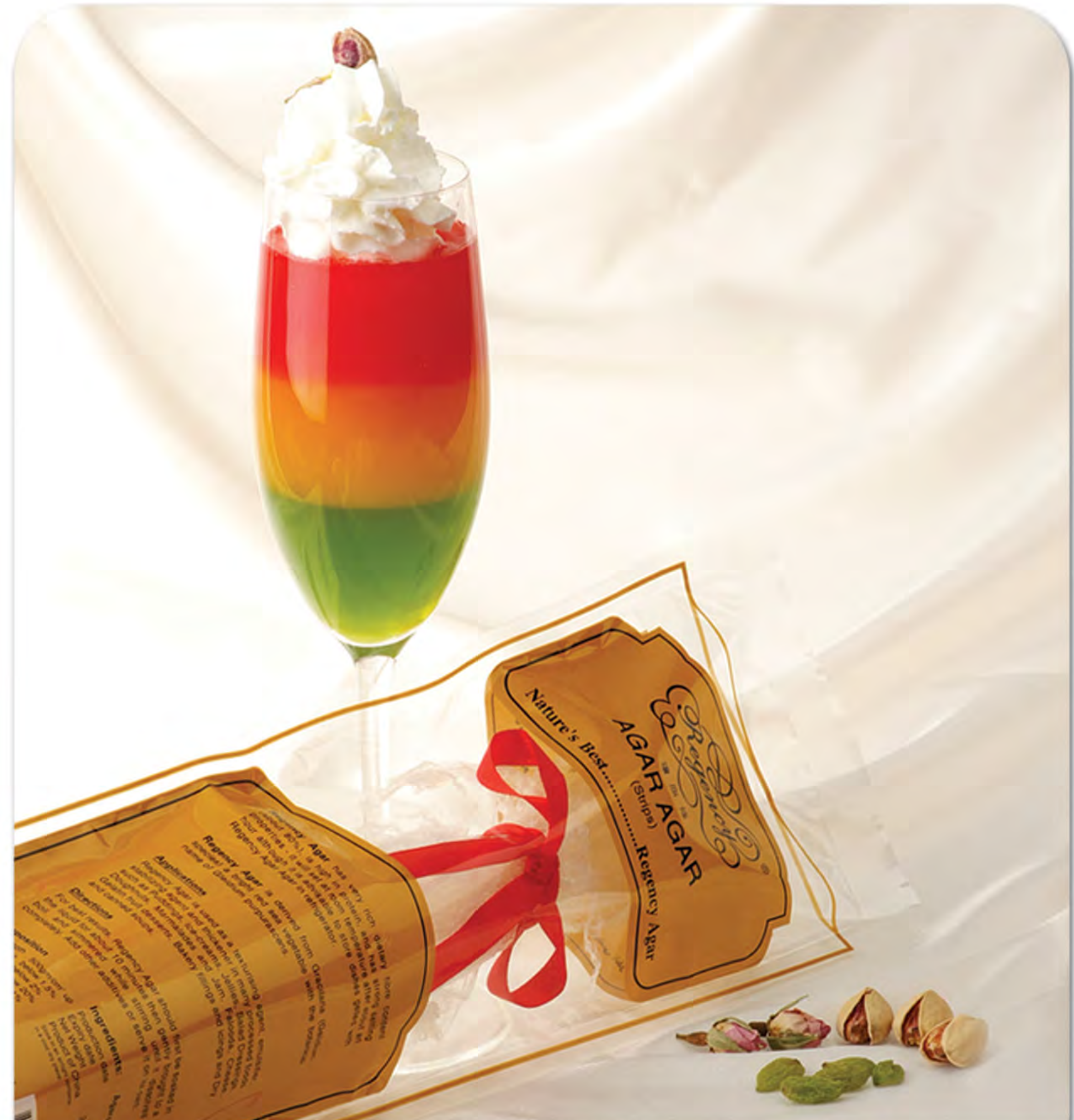
Regency Agar Agar Strips and Powder