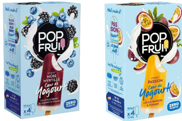
Blackberry Blueberry & Yogourt