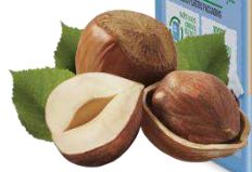
Hazelnuts from Piemont