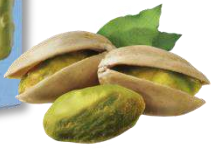
Pistachio from Sicily