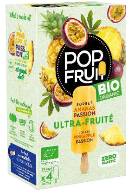
Pineapple Passion Fruit