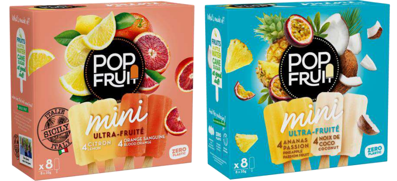
Lemon Blood orange