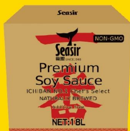
Naturally Brewed Soy Sauce 本釀造醬油