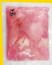
Pink Ginger 粉色姜片