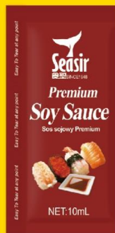
Premium Soy Sauce 上級醬油