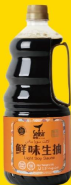
Light Soy Sauce 鲜味生抽