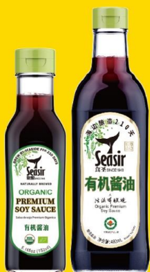
Organic Premium Soy Sauce 有機醬油