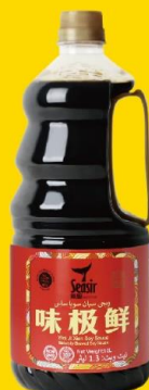
Superior Light Soy Sauce 味極鮮