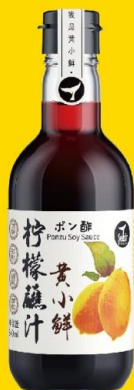
Ponzu Soy Sauce 檸檬蘆汁