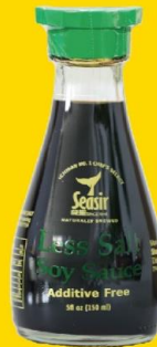
Less Salt Soy Sauce 減鹽醬油