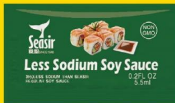
Less Sodium Soy Sauce 減鹽醬油