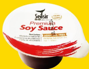
Premium Soy Sauce 本釀造醬油