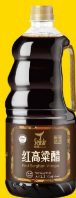
Red Sorghum Vinegar 紅高粱醋