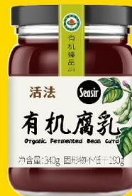
Organic Fermented Bean Curd 有機腐乳