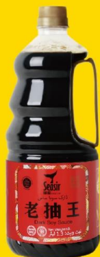
Dark Soy Sauce 老抽王