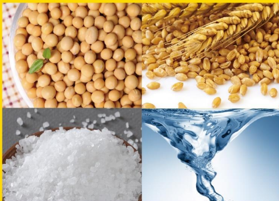
Water, Defatted soybean, wheat, Salt