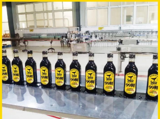
Filling Production Line