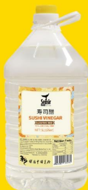
Sushi Vinegar 寿司醋