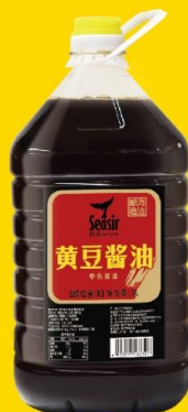
Huang Dou Soy Sauce 黄豆酱油