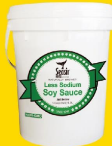
Less Salt Soy Sauce 減鹽醬油