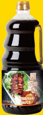
Teriyaki Sauce 照燒汁