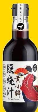
Teriyaki Sauce 照燒汁