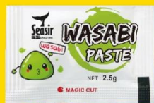
Wasabi Paste 辣根膏