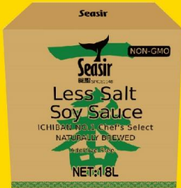
Less Salt Soy Sauce 減鹽醬油