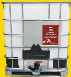
Premium Soy Sauce 原汁醬油