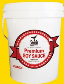
Premium Soy Sauce 原汁醬油