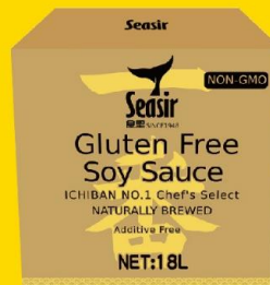
Gluten Free Soy Sauce 無麩質醬油