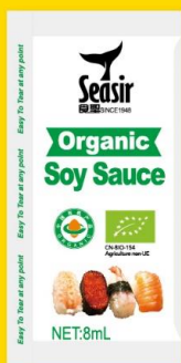
Organic Soy Sauce 有機醬油