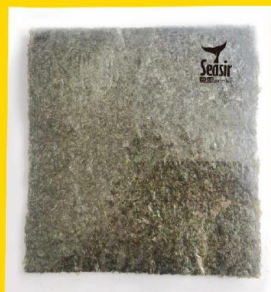
Roasted Seaweed 烤紫菜