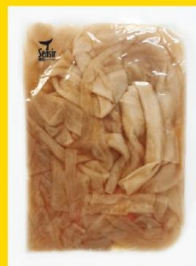
Seasoned Kanpyo 干瓢