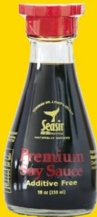
Premium Soy Sauce 原汁醬油