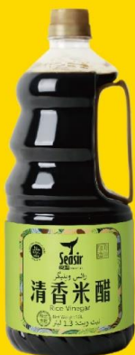
Rice Vinegar 清香米醋