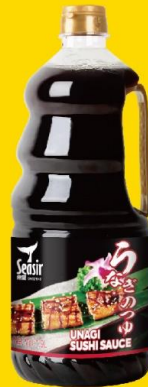
Unagi Sauce 鰻魚汁