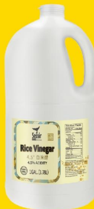
Rice Vinegar 4.5° 純米醋