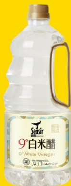
White Vinegar 9° 白米醋