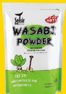
Wasabi Powder 辣根粉