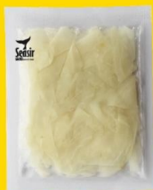
White Ginger 白色姜片