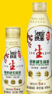
Enzyme Fresh Soy Sauce 酵素純生醬油