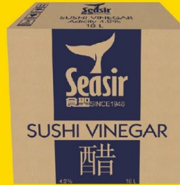
Sushi Vinegar 壽司醋