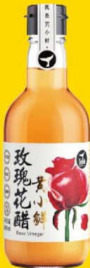
Rose Vinegar 玫瑰花醋