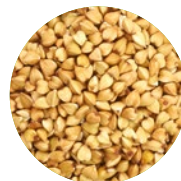
White buckwheat hulls