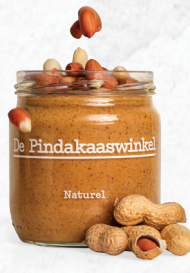
Natural (with peanut chunks)