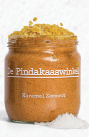
Caramel Sea Salt