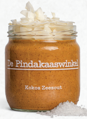
Coconut Sea Salt