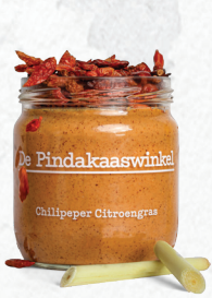
Chili Pepper Lemongrass