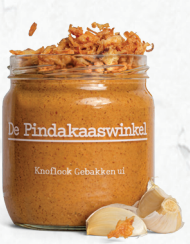
Fried Onions Garlic