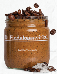
Coffee Sea Salt