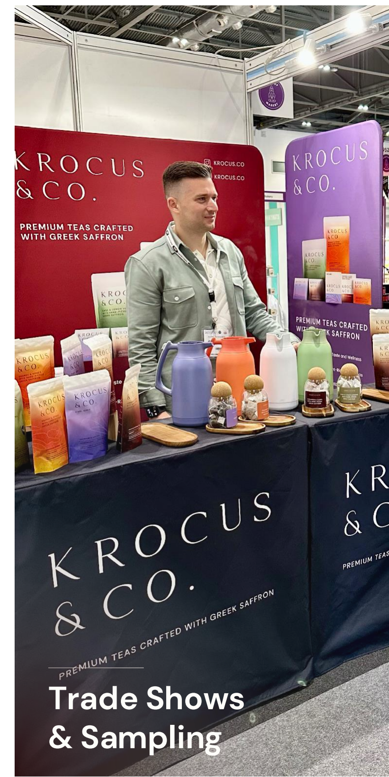
Trade Shows & Sampling