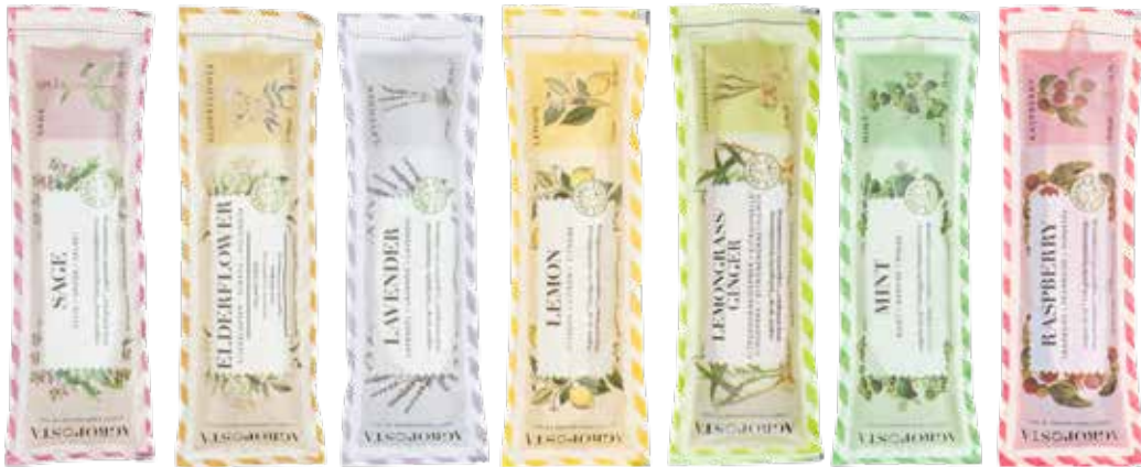
32 ML SACHET OF SYRUP Available in 8 flavours