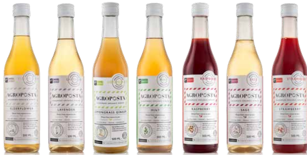
500 ML BOTTLE OF SYRUP Available in 8 flavours