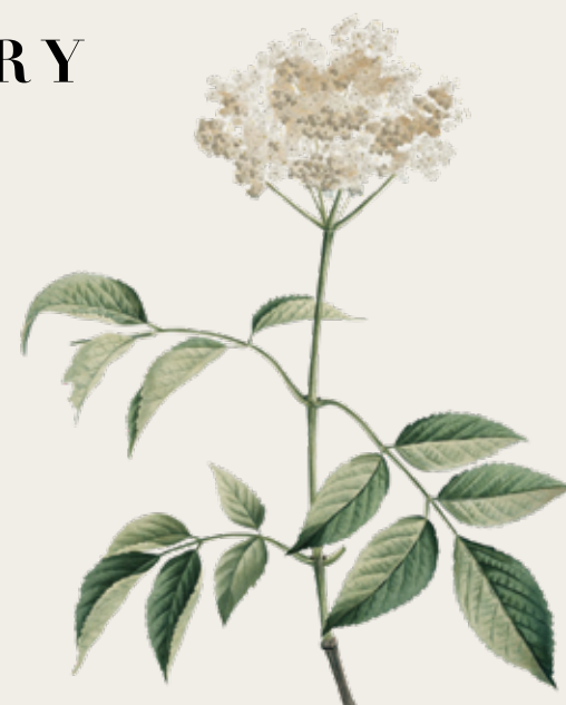
ELDERFLOWER Sambucus Nigra

ELDERFLOWER: Water, cane sugar*, elderflower*, food acid (citric acid).