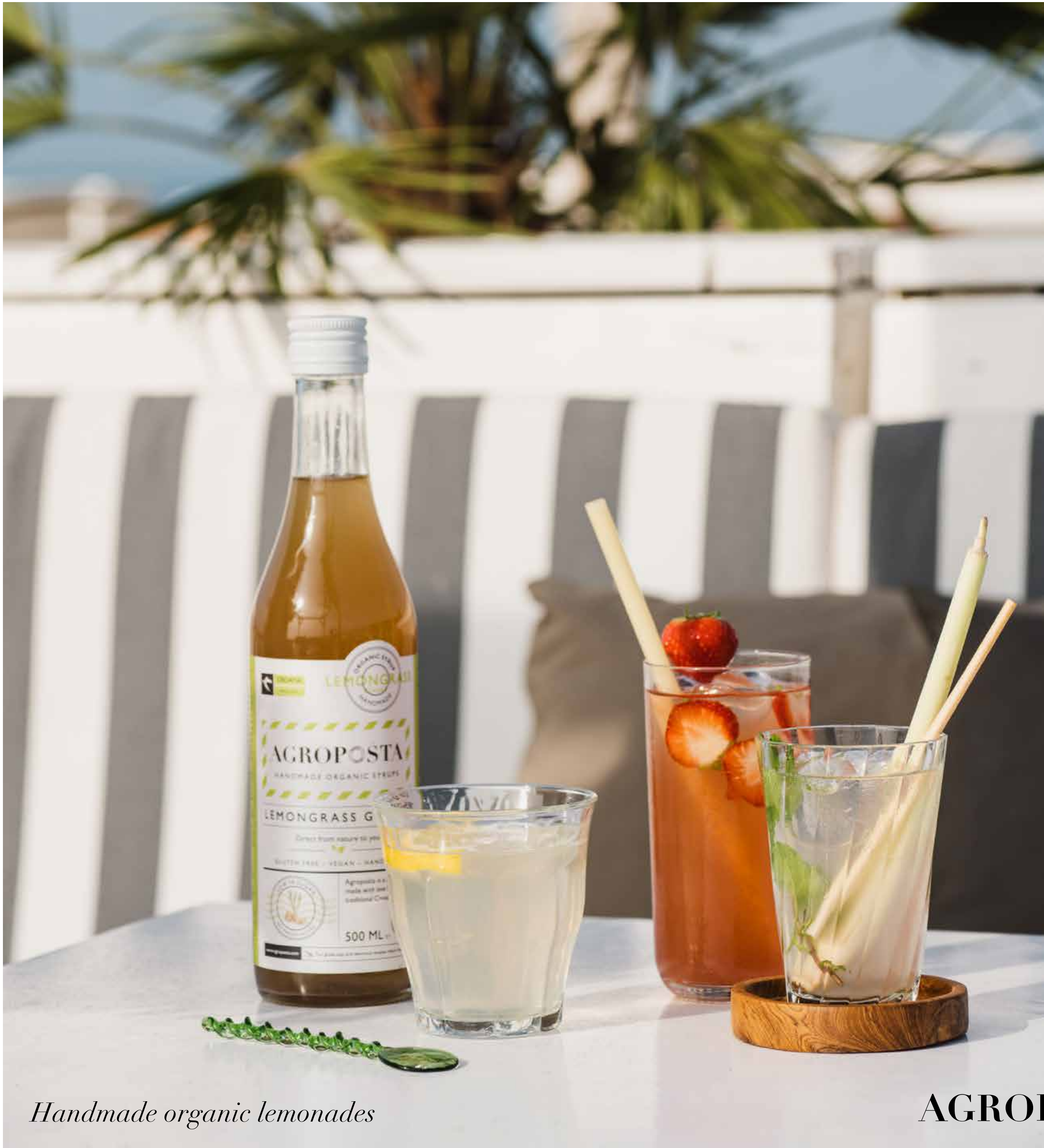
Handmade organic lemonades