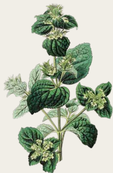
MINT Mentha Spicata