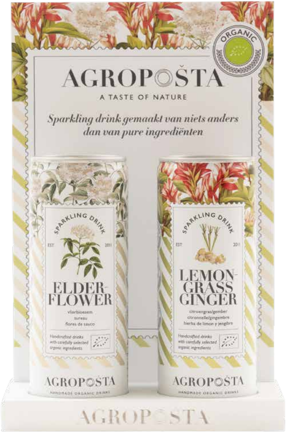
03. DISPLAY CANS