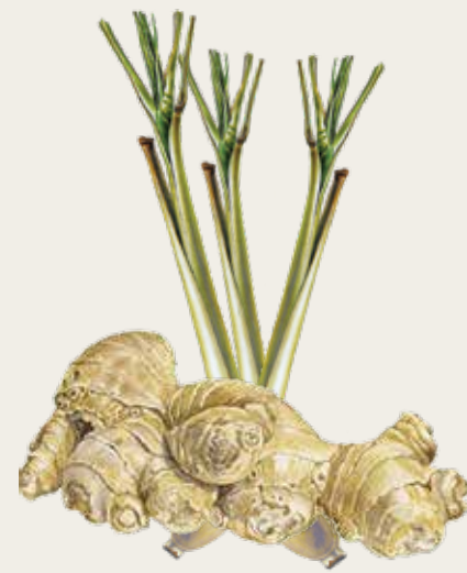
LEMONGRASS / GINGER Cymbopogon citratus / Zingiber officinale