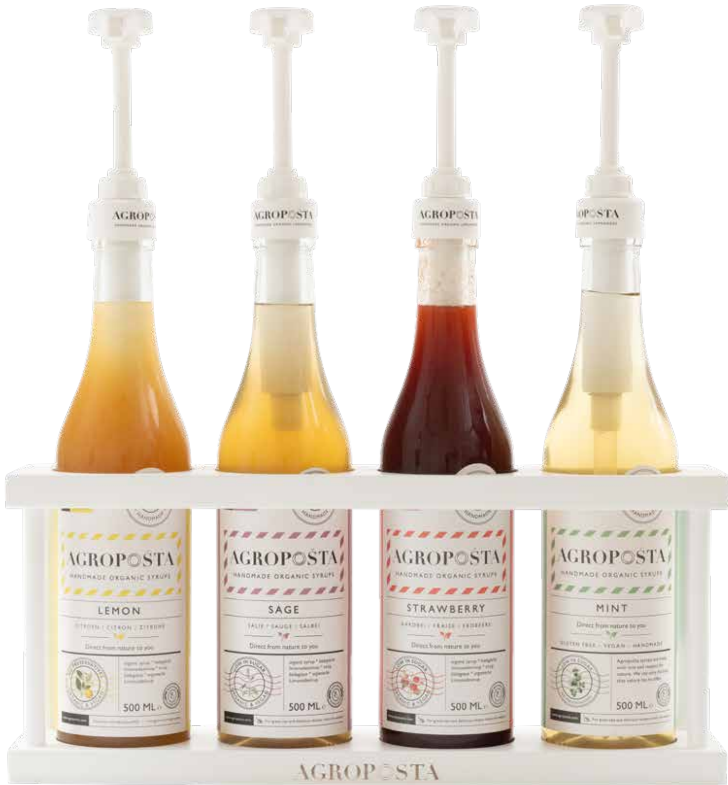
02. DISPLAY BOTTLES