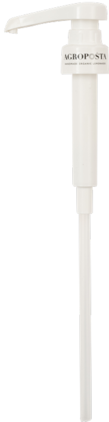
01. PUMP FOR 500 ML BOTTLE