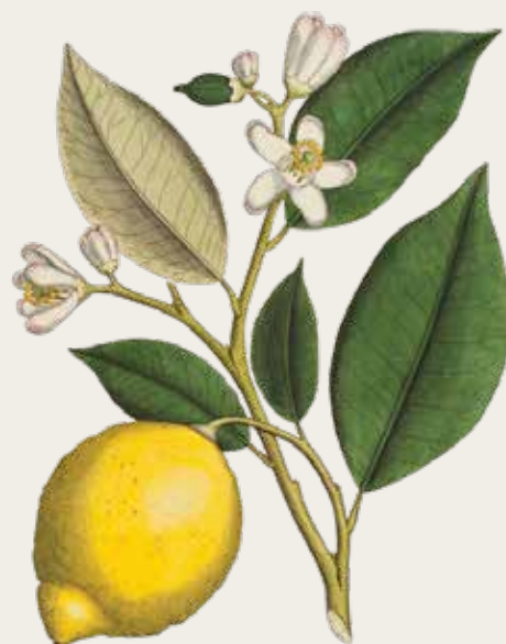
LEMON Citrus limon