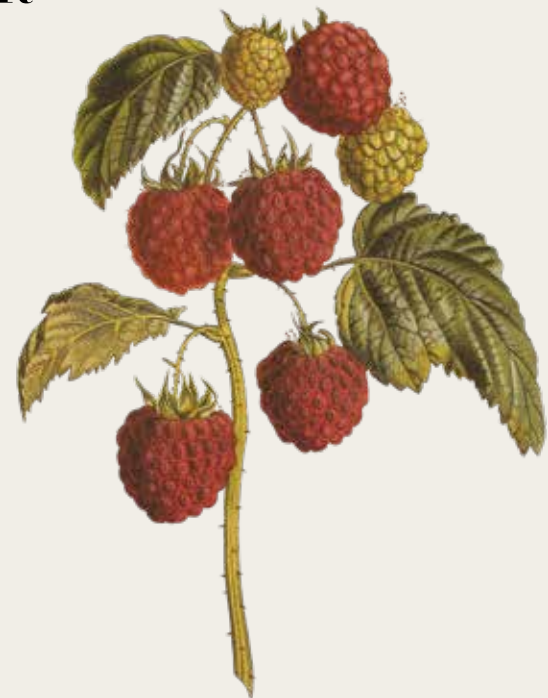
RASPBERRY Rubus Idaeus