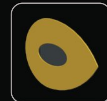
Horizontal Tear Drop

Available with complimentary designs of Portholes and door accessories.